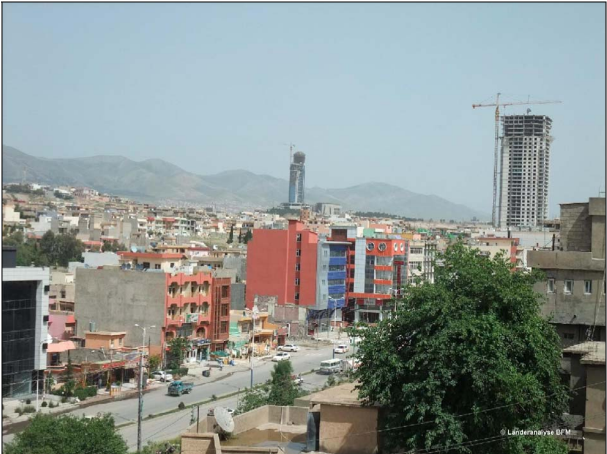
New skyscrapers under construction in Sulaymaniya.

Despite a veritable construction boom, in many ways the economy of the KRG region remains unsustainable and unproductive. There is almost no industrial activity or productive factories. Sources told the fact-finding mission that almost everything is imported 73 these days, even tomatoes. 74 The range of goods is satisfactory, but it is not easy to find Iraqi products in the KRG region. There are essentially no modern dairy farms in the area, although before the fact-finding mission, the KRG had promised to give loans of 100 million Iraqi dinars ($84,000) to farmers who sought to build a dairy farm. 75 Agriculture in the KRG region was widely destroyed during the Anfal operations and Saddam Hussein's rule in general and is largely neglected today, despite the obviously fertile land.