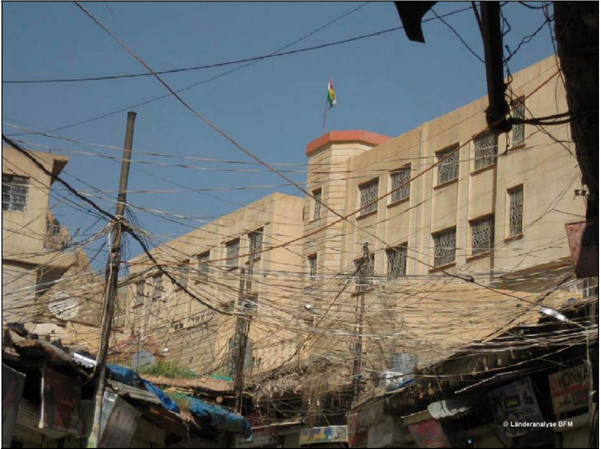
Electricity net in Akre.