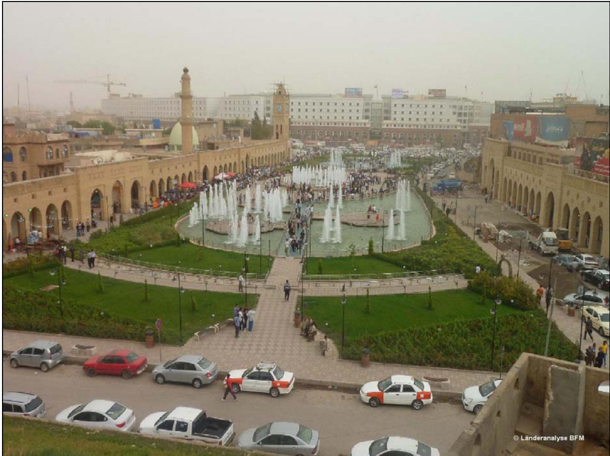
The white building in the background is a large mall in Erbil.

The KRG welcomes foreign investments. For example two Carrefour supermarkets will be opened soon, one in Erbil and another in Sulaymaniya.