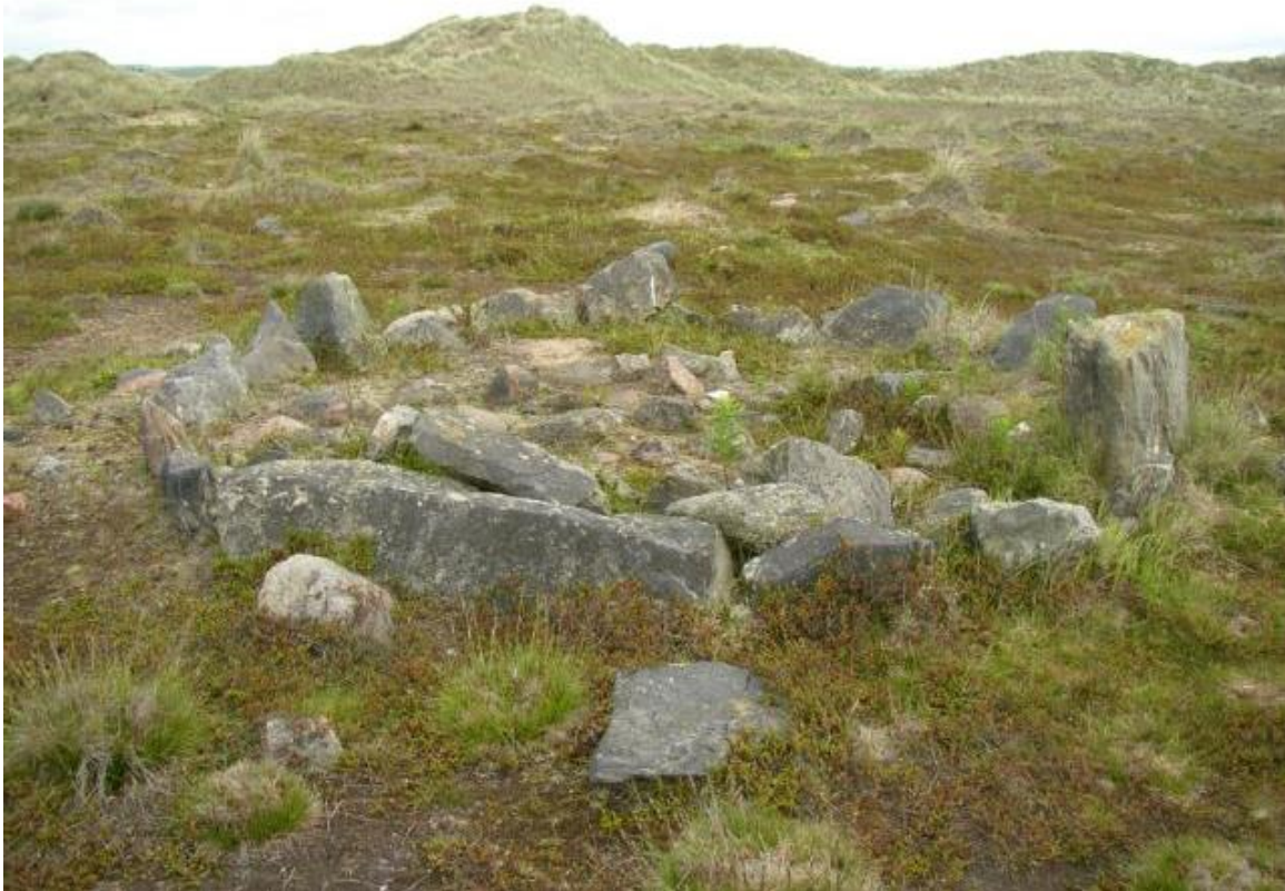
Kerb cairn at Forvie NNR

The first farmers appeared in Britain around 4,000 BC, marking the beginning of the Neolithic (new stone age) period. At this time people began to bury their dead in cairns, leaving behind traces such as the small circular foundations which at Forvie, are now mostly buried by sand. During the Bronze Age, about 3,000 BC, kerb cairns were built to hold cremation sites.