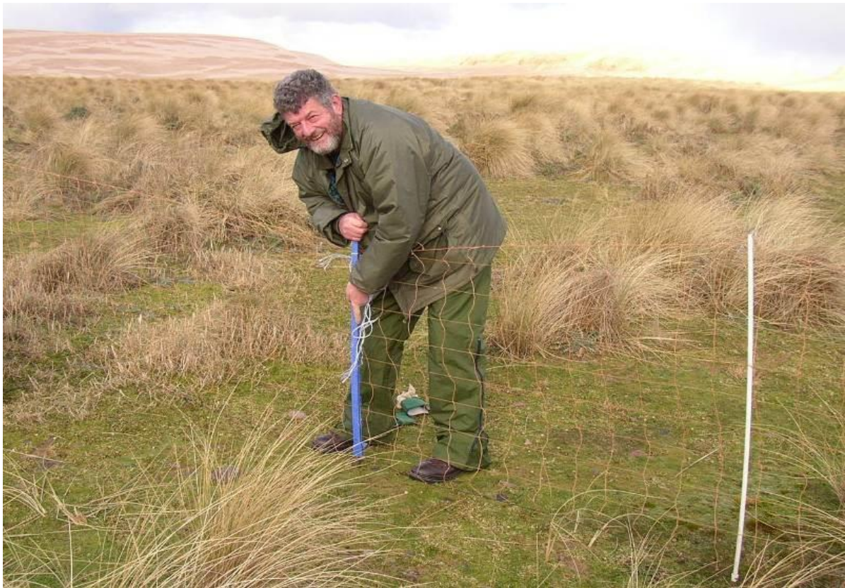
Erecting an electric fence to protect nesting terns

In the early years we introduced some innovative management practices, many are still used today. Tern nesting areas were marked off for the first time in 1961 to reduce disturbance by restricting public access. In 1974 we used electric fencing to try to restrict foxes moving into the southern part of the dunes favoured by ground nesting birds. Each year we erect temporary fencing to protect the terns during the breeding season. The fence prevents people, dogs and predators such as foxes and otters from entering the tern nesting area. Dogs can eat the eggs or scare away the adult birds exposing eggs and chicks to predators like gulls and crows, or death from the cold. Notices explain the reason for the fence and request people to keep out.