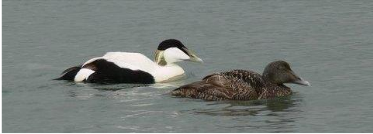
Eider duck on Ythan Estuary

Eider colony – The eider colony at Forvie is one of the largest in Britain. Between 1991 and 1995 there were around 4,000–5,000 birds, with some 1,500 breeding pairs at Forvie. More recently, the breeding population has halved with no more than 800 pairs counted in spring. In winter some birds remain while the rest of the population over winters further south on the Tay Estuary. The breeding success of the colony has been mixed. In 1971 and 1976 as many as 1,200 fledglings were counted on the estuary, but in more recent years breeding has been less successful.