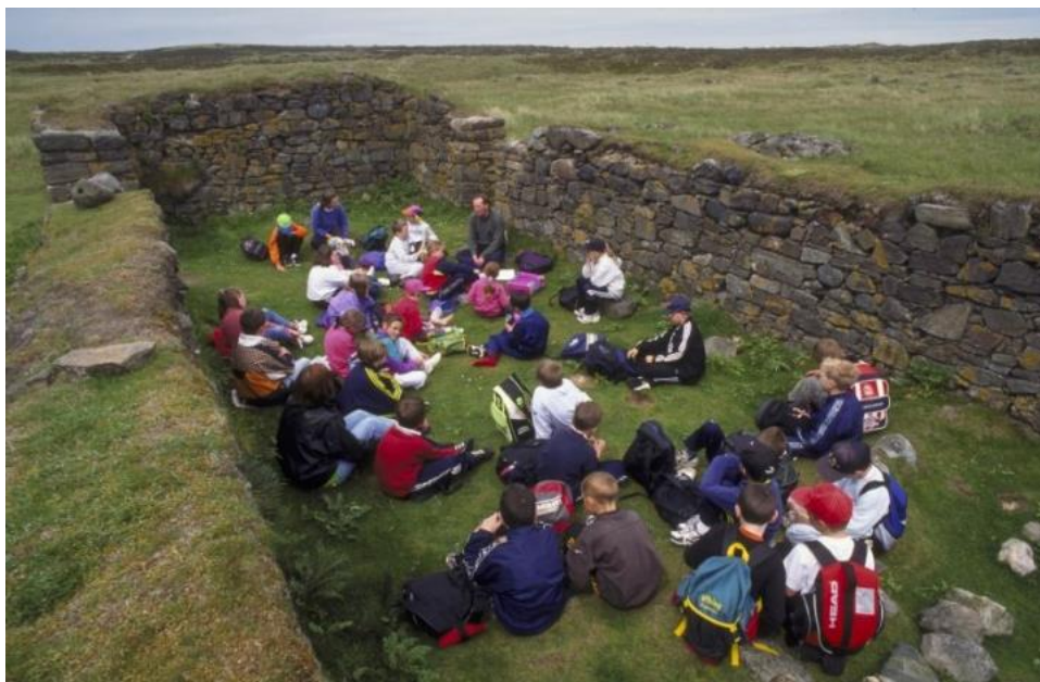
Forvie Kirk being used by school groups

Forvie is a good place for education groups, and we encourage and support visits to the reserve. There is a classroom in the visitor centre for educational purposes. More than 20 primary and secondary schools groups visit the reserve each year; our staff assist some of these groups but other groups prefer to visit independently. We ensure our outdoor learning provision is built around the experiences and outcomes of Curriculum for Excellence, including literacy and numeracy.