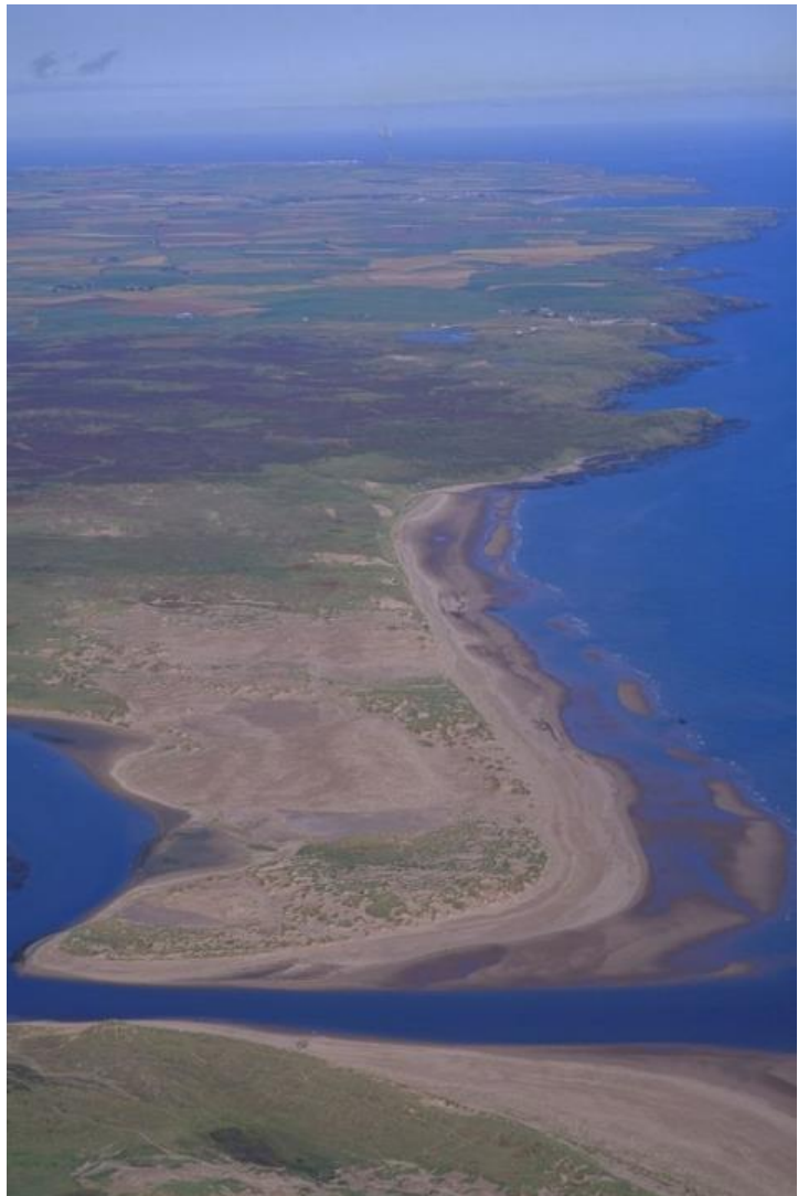
Aerial shot of Forvie NNR looking north

Forvie is a triangular area of extensive and complex dune systems, with three distinct parts. At the north end of the reserve the sand has been deposited on top of a high rock plateau, with varying depths of glacial deposits sandwiched between the rock and the sand. Along the Forvie peninsula, the sand rests on raised beach terraces and buried ridges of glacial origin. At the most southern tip of the reserve, where the River Ythan meets the North Sea, there is a dynamic spit and bar formation. Today natural processes including winds, waves and tides continue to shape the dunes.