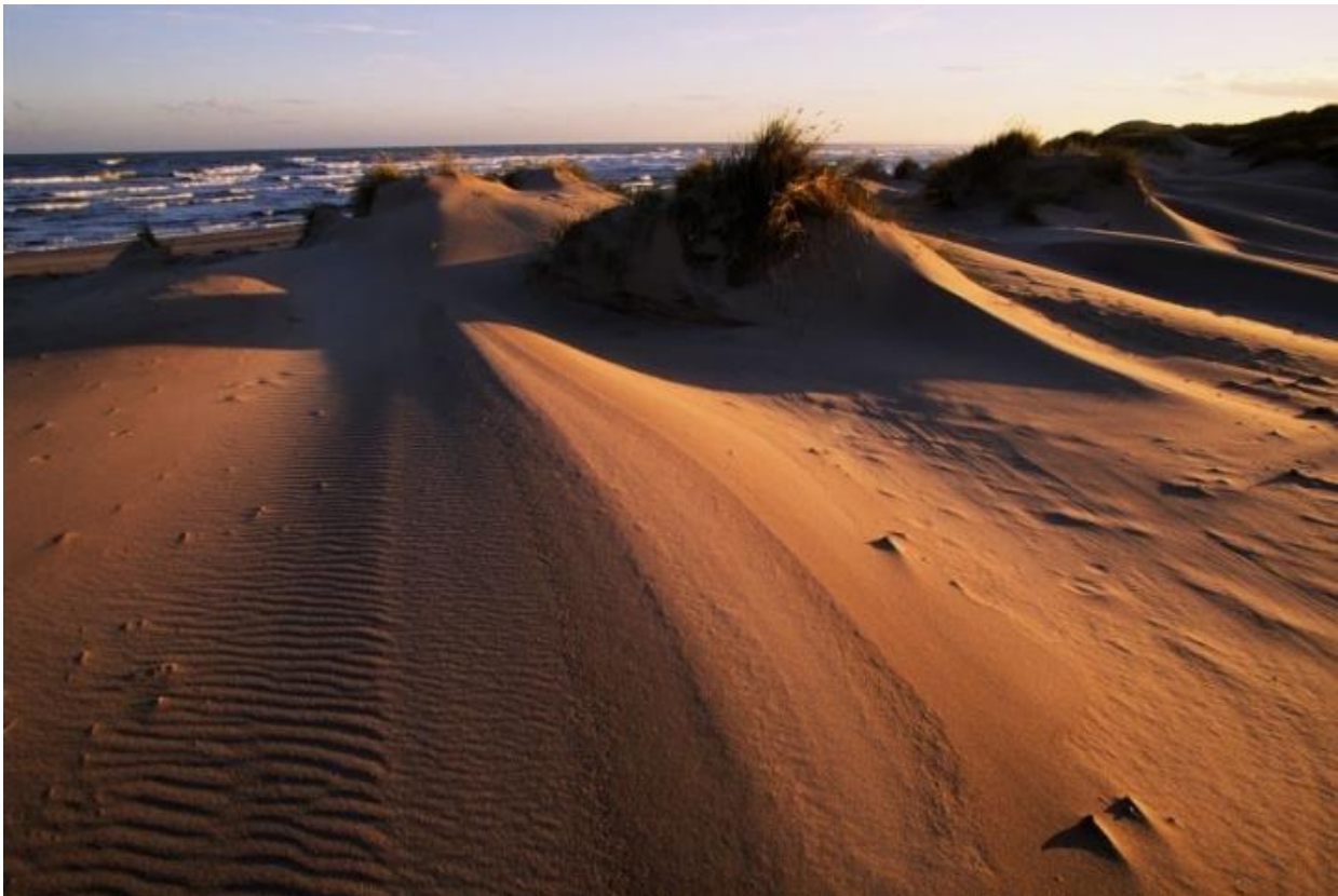
Looking across mobile dunes towards the North Sea.

Among the dunes are wet areas known as dune slacks. Slacks are low-lying areas between dune ridges that are seasonally flooded. They are mainly found in the larger dune systems in the UK, especially in the west and north, where the wetter climate favours their development, and are less common in the warmer and drier dune systems of continental Europe. In the wet slacks at Forvie, plants like common sedge and marsh pennywort are usually found, while damp slacks have crowberry, cross-leaved heath and occasional creeping willow. In the north of the reserve, the vegetation on the oldest, most stable dunes has developed into dune heath. Here there is an extensive area dominated by heather, although crowberry remains abundant along with heath mosses and lichens.