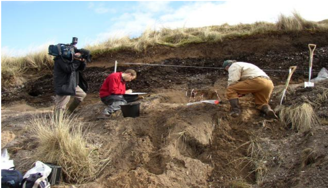
Archaeologists excavating a midden

The cairns, hut circles and Forvie church and deserted ancient village are all Scheduled Monuments. The church, dedicated to St Adamnan, is first mentioned in the 13th-century records of the Chartulary of Arbroath. Excavations date the church to the 12th-century but burials inside the church suggest that it had become ruinous by the 15th-century. Sometime in the 15th-century, the area was smothered in sand, possibly in August 1413, when legend has it that a nine-day storm moved huge quantities of sand. Excavations in 1953 near the church revealed the foundations of medieval square huts, built of roughly shaped stones and red clay. Further excavations in 1955 revealed a paved floor and yielded 13th/14th-century pottery. The font from the church is on loan from the Church of Scotland and can be seen at the Forvie Visitor Centre. For the next 400 years, the historical record shows a gradual population decline in Forvie parish and various records and of sand blowing over agricultural land.