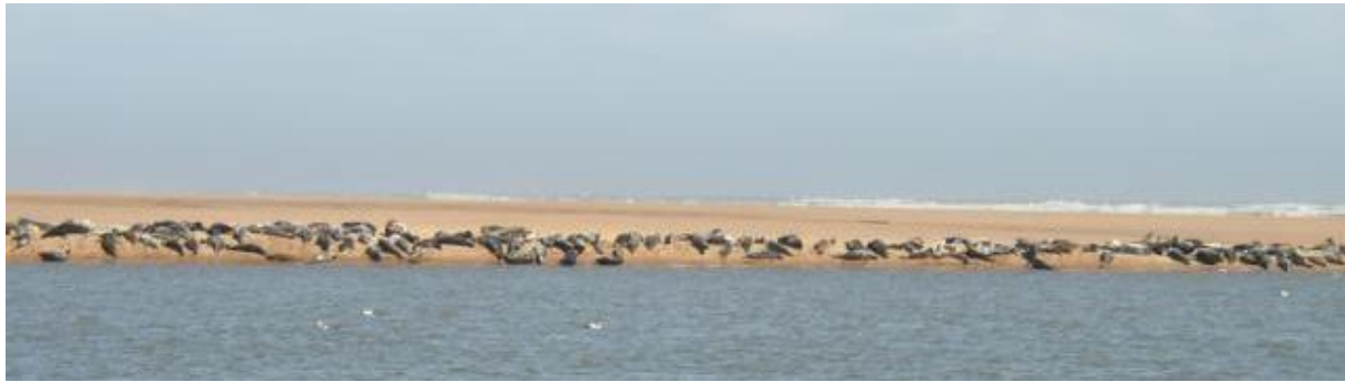
Seals hauled out beside Ythan Estuary

Mammals – mammals typical of this part of northeast Scotland are found on Forvie, including roe deer, foxes, badgers and stoats. Water voles have been recorded in burns adjacent to the reserve. The more unusual species include a healthy population of otters on the River Ythan and the grey and common seals that haul out at the mouth of the estuary. Offshore there are regular sightings of bottlenose dolphins.