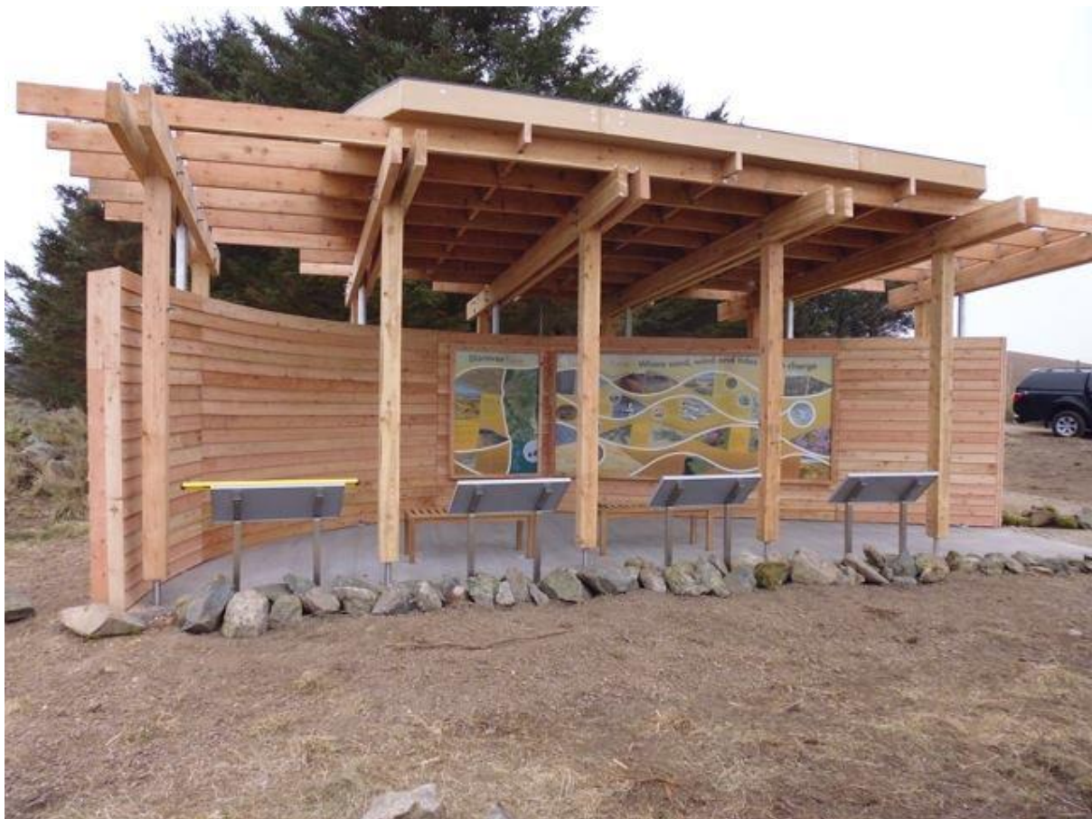
Shelter at Waterside, Forvie NNR

In 2014 we built a new shelter looking out over the estuary with interpretation on the cultural and natural heritage of the reserve. This project was made possible by funding from the Aberdeenshire European Fisheries Fund. It is intended as an information place for visitors but also designed to provide a focal point and shelter for the many education groups visiting the reserve. The main access track from the car park to the eider nesting zone was resurfaced and the area landscaped with seating and new information boards provided.