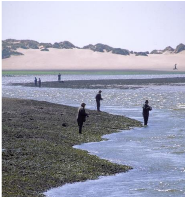
Angling on the Ythan Estuary

Fishing – salmon were netted along the north east coast of Scotland for many years. As early as the 1640s the records indicate the Ythan had important stock of migratory fish – salmon and trout. Numbers have declined in recent years, and some fisheries have been bought out by river angling interests. The salmon netting station at Rockend ceased operations in 2000 and is now owned by the Ythan District Fishery Board, which has a general duty to ensure the protection and enhancement of the fishery within the Ythan catchment. Angling in the River Ythan is popular, both from the shore and boats and three separate estates own angling and fishing rights within the NNR. The River Ythan Trust was formed in 2010 and aims to protect and enhance the river catchment through fishery management and biosecurity measures.