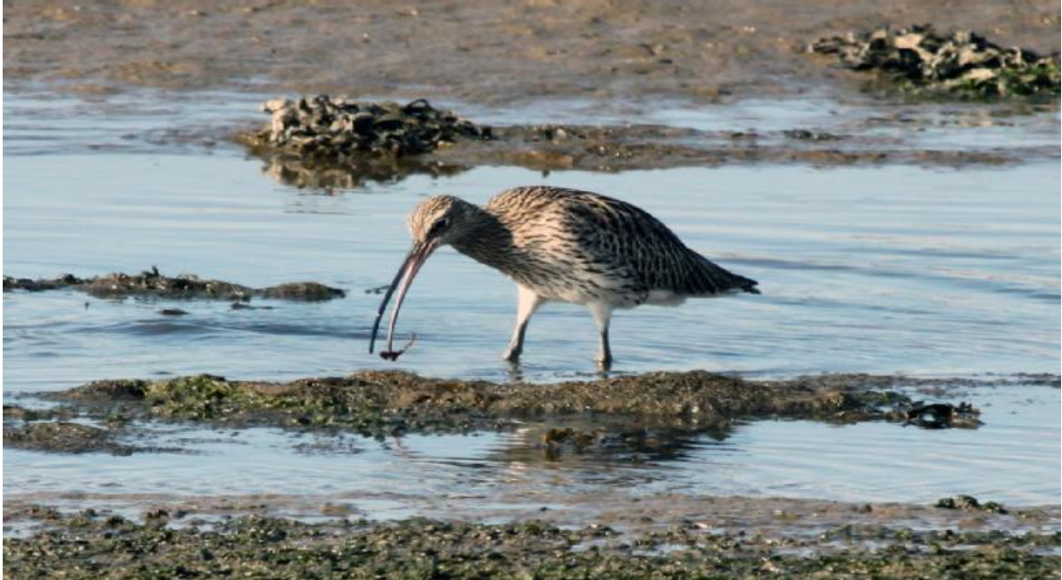
Mudflats – rich feeding for waders such as Curlew.

Estuary – the Ythan estuary is one of the least modified estuaries in Britain. It is tidal almost as far inland as Ellon. These extensive intertidal areas, exposed when the tide is out, are an essential food source for the rich bird life of the reserve. Living in the mudflats are large numbers of shellfish and invertebrates, a vital food source for waders and wildfowl. The coarser gravels support mussel beds, a vital food supply for the eiders.