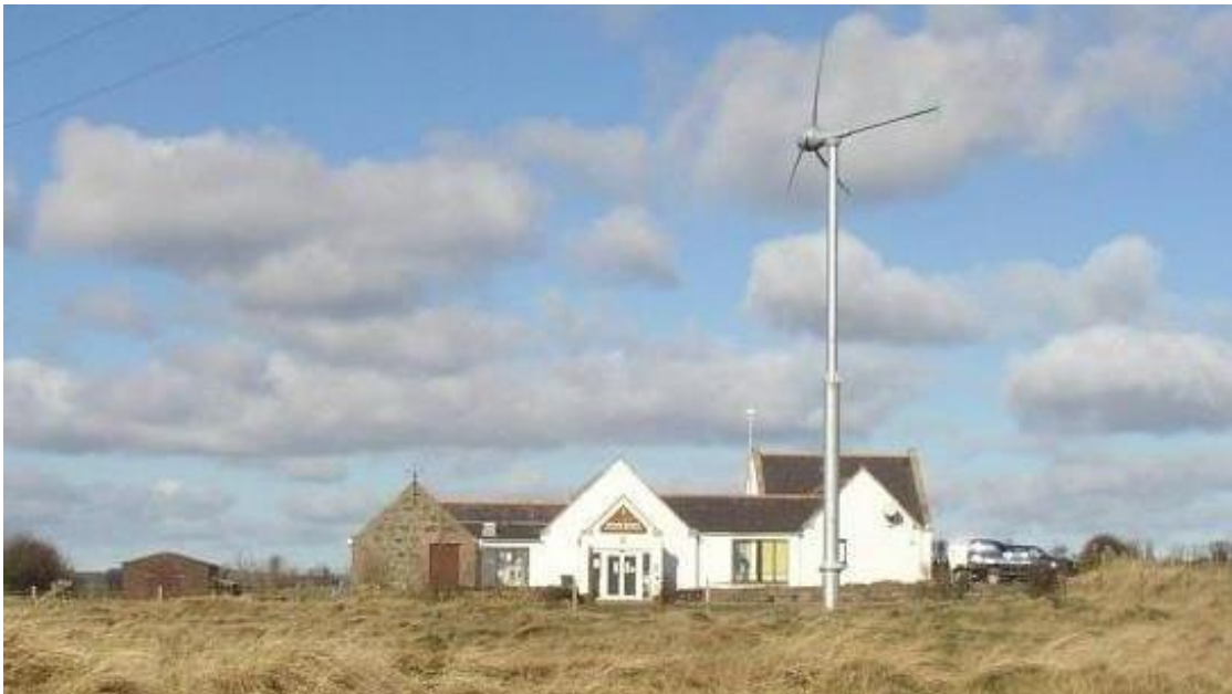
Forvie Centre and wind turbine

The 2006-13 plan continued with 12 objectives, set out around the policy for NNRs, they related to heritage, people and property management. The general direction of heritage management continued to focus on keeping the coastal features, breeding and wintering birds in good condition and protecting the biodiversity of the reserve. The people-related objectives focused on creating a high quality visitor experience, compatible with the wildlife interest of the reserve, for tourists, education users and the local community. Property management was about keeping the site well maintained and increasing the use of renewable energy.