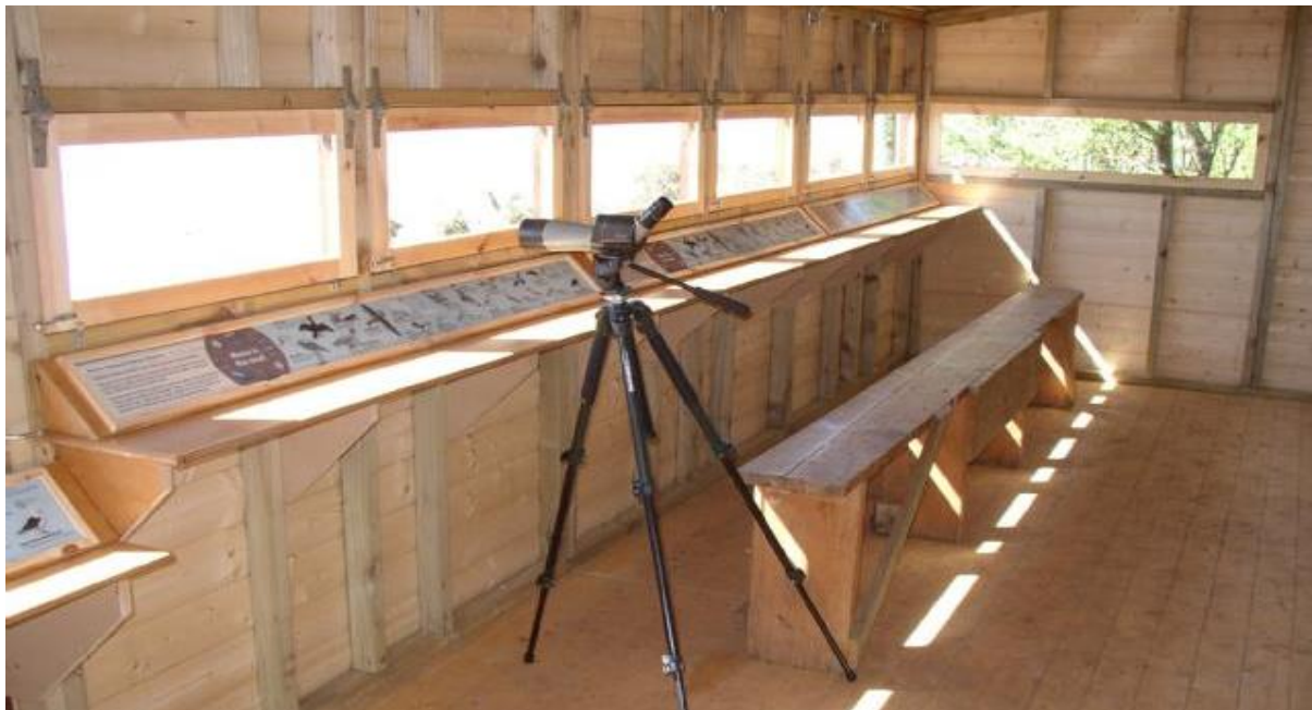
Waulkmill wildlife viewing hide

In 2008 we upgraded the path from the visitor centre to Sand Loch to ensure it is suitable for wheelchairs and buggies and installed seating looking over the loch. In 2010/11 we replaced the hide at Waulkmill providing a viewing point on the upper section of the estuary. Interpretive panels providing an introduction to the reserve and images with identification of the main bird species were installed below the viewing windows.