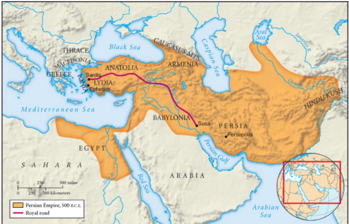
Map 3.1 The Persian Empire

At its height, the Persian Empire was the largest in the world. It dominated the lands of the First Civilizations in the Middle East and was commercially connected to neighboring regions.