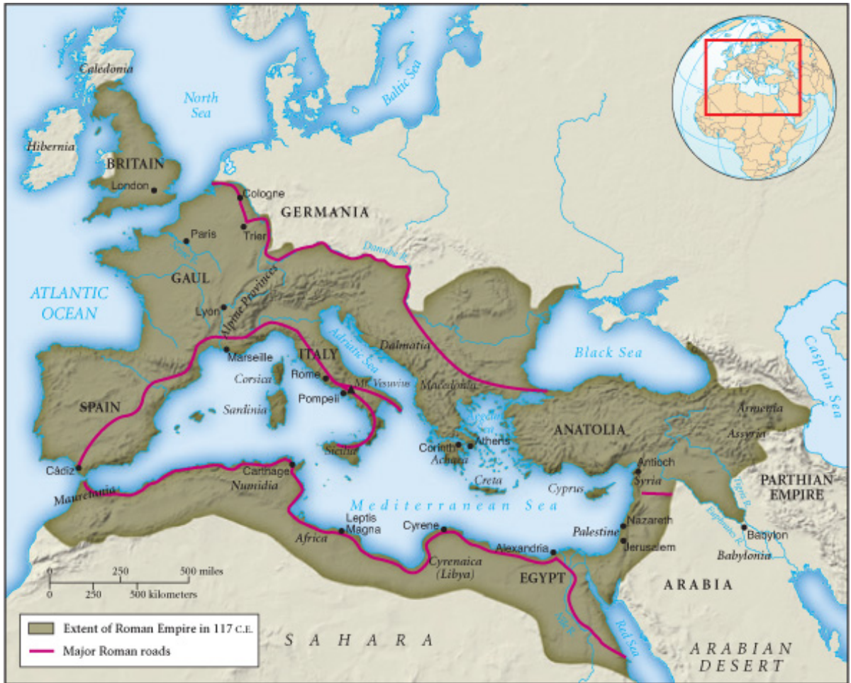
Map 3.4 The Roman Empire

At its height in the second century c.e., the Roman Empire incorporated the entire Mediterranean basin, including the lands of the Carthaginian Empire, the less-developed region of Western Europe, the heartland of Greek civilization, and the ancient civilizations of Egypt and Mesopotamia.