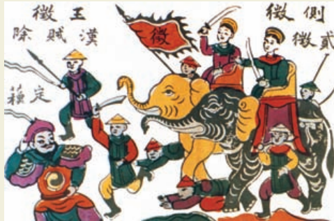
Trung Trac and Trung Nhi

Within months, her forces had captured sixty-five towns, and, for two years, they held the Chinese at bay, while Trung Trac and Trung Nhi ruled a briefly independent state as co-queens. Chinese sources referred to Trung Trac as a “ferocious warrior.” During their rule, the sisters eliminated the hated tribute taxes imposed by the Chi-