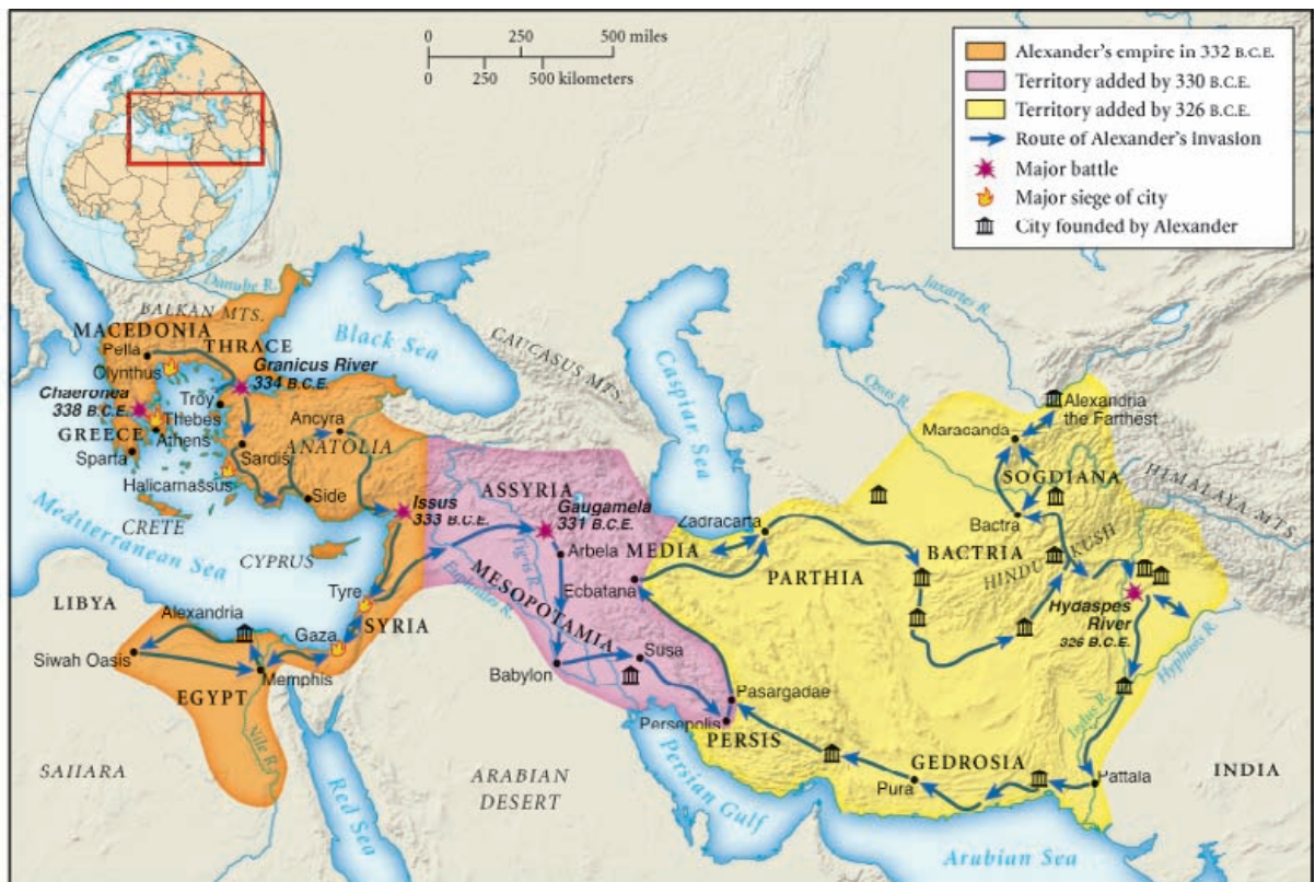
Map 3.3 Alexander's Empire and Successor States

Alexander died in 323 B.C.E., without returning to Greece, and his empire was soon divided into three kingdoms, ruled by leading Macedonian generals.