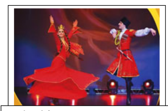
The Lezginka danced on an international stage

* PRAY for the Lezgi believers to shine as bright lights in the midst of their Lezgi families & clans. Phil.2:12-15 * PRAY for men and women of peace (Luke 10:6) in each one of the 142+ Lezgi towns & villages, to be keys to welcoming the love of God, the grace of Jesus, and the power of the Holy Spirit into each Lezgi community in the years ahead. Matthew 9:36-38 & Hebrews 2:3-4 * GIVE THANKS for the Translation Work which is underway. PRAY for wide reading! II Timothy 3:15-16 * PRAY for many Lezgi to dance, full of the joy of the Holy Spirit, in the years to come. Isaiah 55:11 * PRAY for the noble Lezgi culture to be graced with the Fruit of the Spirit in the next generation. Gal. 5:22-23