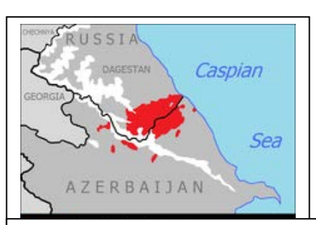
In Red – Lezgi home region – in southern Dagestan (Russia) & northern Azerbaijan.

In the 90 Lezgi towns and villages of Dagestan—see Page 2—the Lezgi raise sheep and goats, combined with subsistence agriculture, leather working, and textile production [famous hand woven carpets]. Life is similar in the more than 50 Lezgi towns and villages of northern Azerbaijan; with the exception that in Dagestan Russian serves as the 2<sup>nd</sup> language, whereas Azeri is the 2<sup>nd</sup> language for Lezgi in Azerbaijan. The Lezgi language, however, is alive and well—with robust oral activity in Lezgi villages, homes, and schools; and a huge reservoir of Lezgi literature and music. Many Lezgi have also out-migrated from rural Lezgi regions to urban areas of Dagestan and Azerbaijan, primarily for economic reasons. Patriarchal social structure among the Lezgi remains strong, especially in village life and in demarcated urban enclaves.