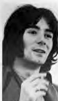
together once more.

Twelve songs scribbled on a piece of paper are the Stones' nicely optimistic target. "Yes, it's a long list," says Jagger, and he shrugs, gathering the group