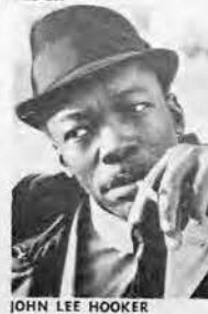
JOHN LEE HOOKER