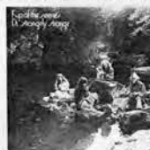
The first Dr. Strangely Strange, 'Kip of the Serenes', ILPS 9106

All three LP's were produced by Witchseason — that means by Joe Boyd and the artistes concerned. The Fairport LP is simpler than the last one — more the way they sound live and includes Sandy Denny's own version of "Who Knows Where 'The Time Goes'" as well as three Dylan tracks you've never heard before.