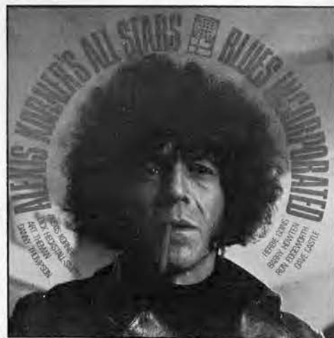
Alexis Korner's All Stars/TRA SAM 7/15s 5d

... of whom there are many, including, on this fantastic 15/5 sampler: Dick Heckstall-Smith, Herbie Goins, Danny Thompson and a few more who helped make Blues Incorporated so influential and so exciting.