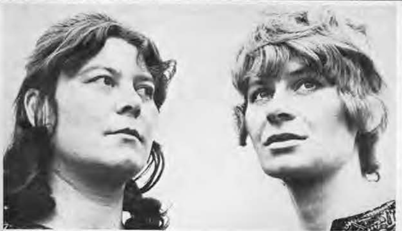
DOLLY AND SHIRLEY COLLINS

THE ALBUM Top Twenty chart in the window of HMV's Oxford Street showroom had an unusual LP at number twelve recently: Shirley Collins' "Anthems in Eden" record on the new Harvest label.