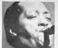
LESTER YOUNG, COLEMAN HAWKINS, WILLIE SMITH, ETC.:

"Windmill Tiller" (Fontana STL5494). Trumpeter Wheeler confirms his stature as a major soloist and adds another dimension with his composing-arranging skills. A sensitive, occasionally brilliant set of originals, well played by John Dankworth's Orchestra.