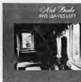
The first Nick Drake album, 'Five Leaves Left', ILPS 9105