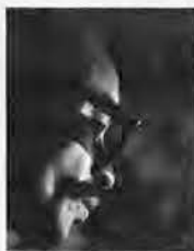
CECIL TAYLOR first time here

MANY OF the biggest names in jazz are lined up for jazz Expo '69 this autumn, third of the Newport Festivals in London to be staged by piano-playing impresario George Wein in association with the Harold Davison Office.