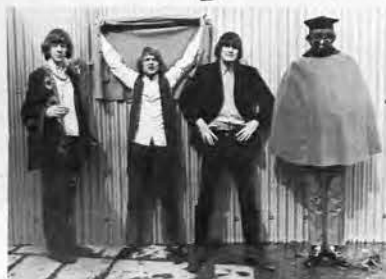
SOFT MACHINE: Cecil Taylor influence

"The Soft Machine may still be a minority-appeal group, but, for us, it is the music that is important. And we certainly haven't done badly. We do a fair