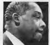
KENNY CLARKE, FRANCY BOLAND AND THE BAND LIVE AT RONNIE'S: ALBUM 1 "Volcano" (Polydor 583 054), ALBUM 2 "Rue Clapart" (Polydor 583 055). Hundreds of jazz enthusiasts who caught this fabulous band at Ronnie Scott's Club in London have been waiting for these two albums. They won't be disappointed. Powerhouse section work spiced with exciting solos.

"Louis and the Big Bands 1928-30" (Parlophone PMC7074). Another extraordinary set of historic Armstrong performances from Parlophone, this time with his bands of 1928-30 vintage. How can you detail the magnificent trumpet passages? Two takes of "Some Of These Days," one with vocal, are among rare pleasures for connoisseurs. Vital stuff for collectors.