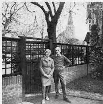
The new Fairport Convention, 'Unhalfbricking', ILPS 9102