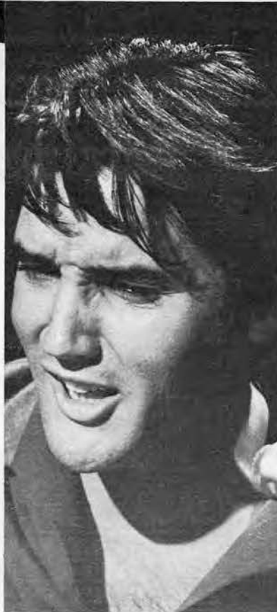
ELVIS: mean, moody, magnificent

Mills grind exceedingly slowly. Let's hope the BBC doesn't miss the boat.