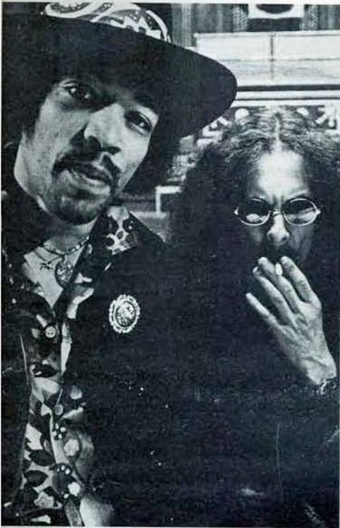
HENDRIX AND REDDING, parting company