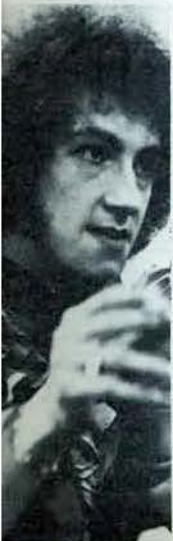
MITCHELL: may return

PLANS by Jimi Hendrix to enlarge his Experience have led to British bass guitarist Noel Redding quitting the group.