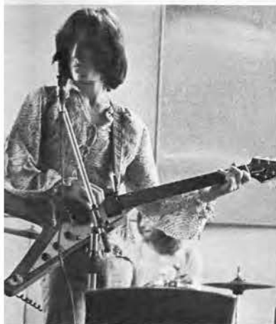
JAGGER: "I can't play it properly"