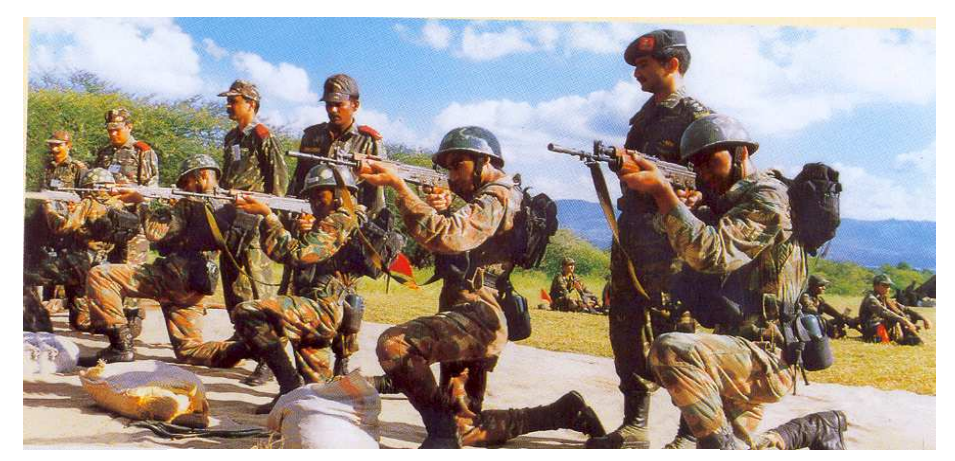
Army Cadets Firing at the long range

9. At the Academy, cadets belonging to the three services live and train together. This ensures that the future officers of the three services are on the friendliest terms. They understand the organisation, capabilities and limitations of the other services apart from their own. The three services thus operate as an integrated fighting force.