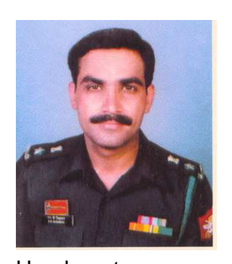
Headquarters National Defence Academy Pin - 900449