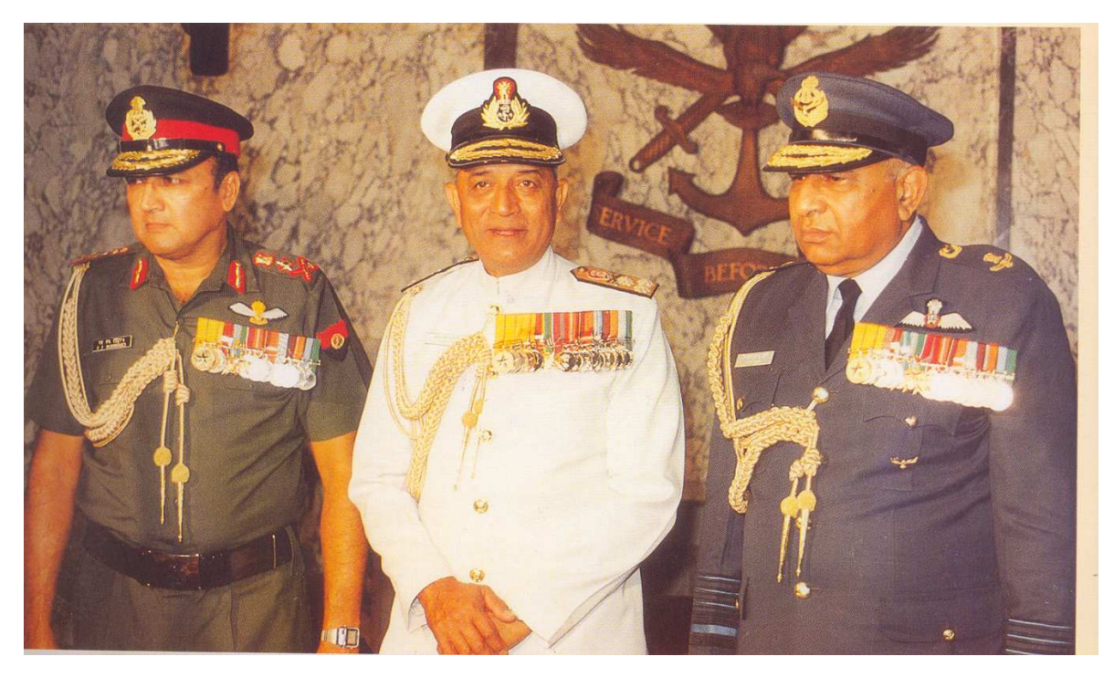
A historic Day... Service Chiefs of the 1<sup>st</sup> Course at the NDA 30 Nov 1991

5. The NDA, in its various avatars, has completed sixty years of eventful service in January 2009. This institution is proud that over 27,000 of its alumni have joined the Armed Forces of India as well as of many foreign countries after having imbibed academic and military training of the highest standard in an unique inter-services ambience. The NDA is also proud that amongst its alumni are many winners of the nation's highest awards for Gallantry and Distinguished Service, both in peace and in war. We cherish with pride, the honour-roll of so many other former NDA cadets who have laid down their lives in battle, to uphold the safety and integrity of our Republic. The NDA has the distinction of many of its alumnus, reaching the pinnacle of military achievement by becoming Chiefs of their respective Services.