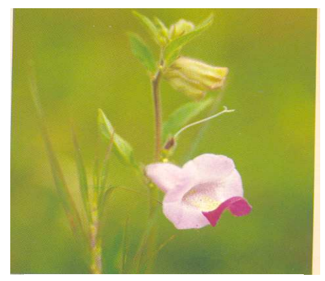
Wild Sesame (Sesamum Indicum)