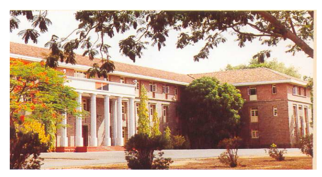
Squadron Building: Living Accomodation for Cadets