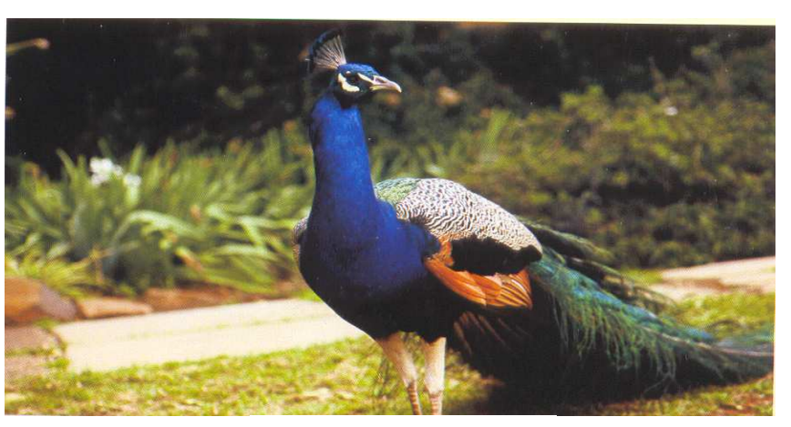
Peacock (Pavo Cristatus)