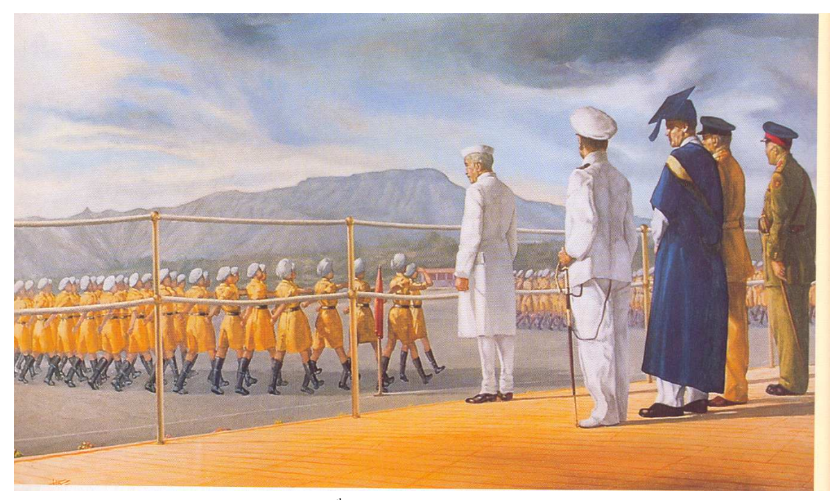
First POP at NDA, Khadakwasla... 10<sup>th</sup> Course POP reviewed by Pt Nehru, Hon PM of Inida 05 Jun 1955.

5. The NDA, in its various avatars, has completed sixty years of eventful service in January 2009. This institution is proud that over 27,000 of its alumni have joined the Armed Forces of India as well as of many foreign countries after having imbibed academic and military training of the highest standard in an unique inter-services ambience. The NDA is also proud that amongst its alumni are many winners of the nation's highest awards for Gallantry and Distinguished Service, both in peace and in war. We cherish with pride, the honour-roll of so many other former NDA cadets who have laid down their lives in battle, to uphold the safety and integrity of our Republic. The NDA has the distinction of many of its alumnus, reaching the pinnacle of military achievement by becoming Chiefs of their respective Services.