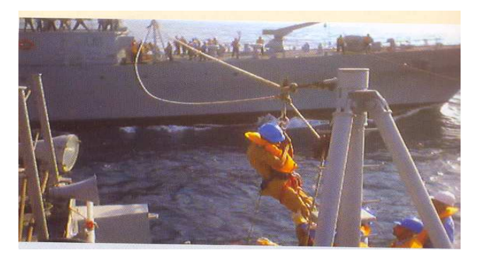
Naval Cadets Undergoing training on a ship