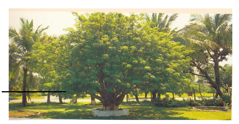
Baobab (Adansonia Digitata) and Coconut Palm (Cocos Nucifera)

14. Spread over 6735 acres, the NDA has a salubrious climate with a mean temperature of 24.3 degrees C, pollution free environment, elaborate infrastructure and a wide variety of flora & fauna. March to May get warm but the monsoon is active in the area. Winters are mild. Blankets/quilts are necessary during Dec to Feb. Mosquito menace is experienced throughout the year.