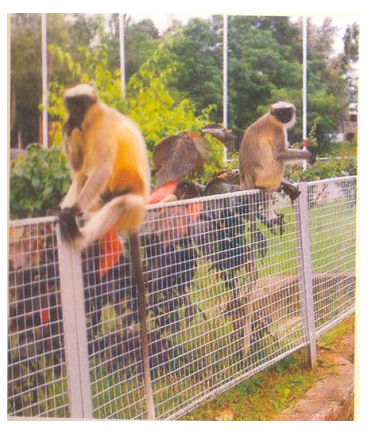
Common Langur (Presbytis Entellus)