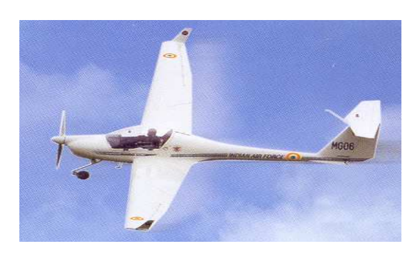
Super Dimona : The Training Aircraft of Air Force Cadets

9. At the Academy, cadets belonging to the three services live and train together. This ensures that the future officers of the three services are on the friendliest terms. They understand the organisation, capabilities and limitations of the other services apart from their own. The three services thus operate as an integrated fighting force.