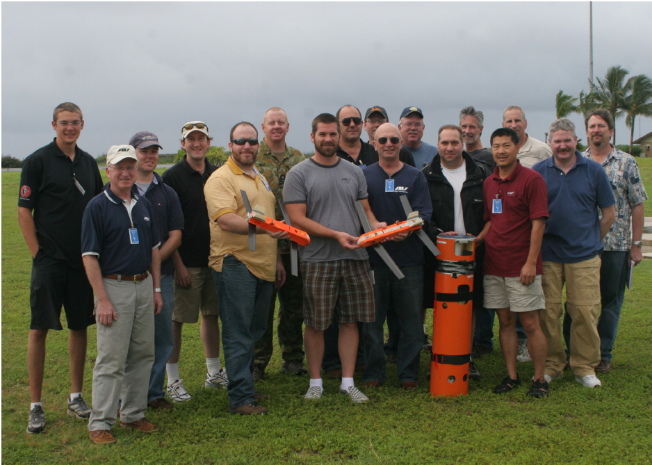
Submarine Over-The-Horizon Organic Capability vehicle based on Block 1 Switchblade. Pacific Missile Range Facility, January 13, 2009.