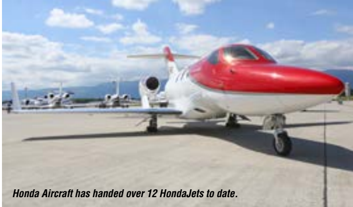
Honda Aircraft has handed over 12 HondaJets to date.

easily viewable and reachable. The power levers and yoke feel substantial and match the purposeful decor of the flight deck, while adding a touch of leather-trimmed design flavor.