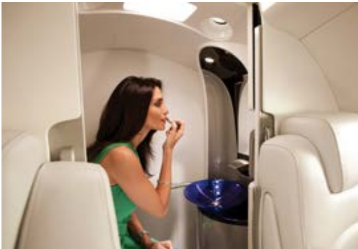
The HondaJet has room for an enclosed externally serviced lavatory.