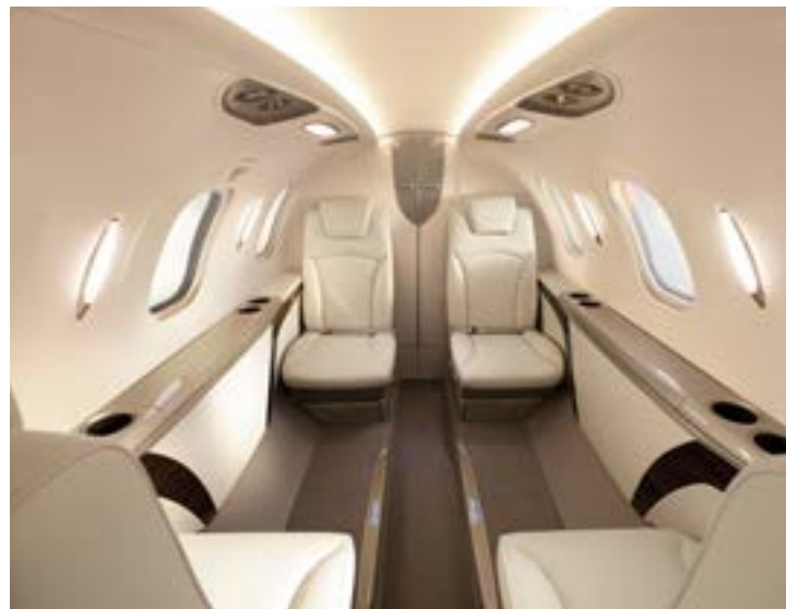
The over-the-wing engine mount design makes more room in the cabin. Honda Aircraft expects the most popular configuration to be the executive version, with leather seats and an under-seat storage drawer.

could help delay the onset of the drag-producing shock wave that builds as jets gain speed, the result being a 5-percent improvement in fuel efficiency. Fujino and engineer Yuichi Kawamura received a U.S. patent for this "method of reducing wave resistance in airplane" on Oct. 30, 2001. In the HondaJet, it was critical not only to position the engines precisely but also to design the engine pylon so that it doesn't generate too much side lift or drag. The aerodynamic shape of the vertically mounted engine pylons is clearly evident. The engines' placement also makes it easier to look them over during preflight.