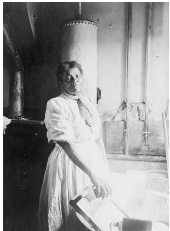
A photograph of an African American woman doing laundry at a wash tub, in either Washington, D.C. or New York. Dated circa 1909 to 1932.

The narrative conveyed by Carson is also similar to that described by Ruíz: the bridging of cultural differences by the employees, the partnership with radical leftists, the creation of a democratic unionism that offers leadership roles to women of color, and the undermining of that success by bureaucratic and hierarchical union executives. Even the Teamsters make a repeat performance.