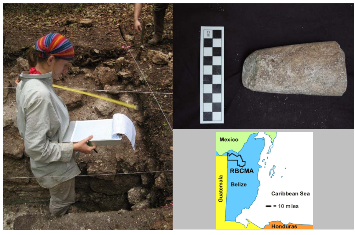
Images courtesy of Maia Dedrick: (left) author at the excavation site; (upper right) Tool: "Mano"; (lower right) Map: Excavation Site.