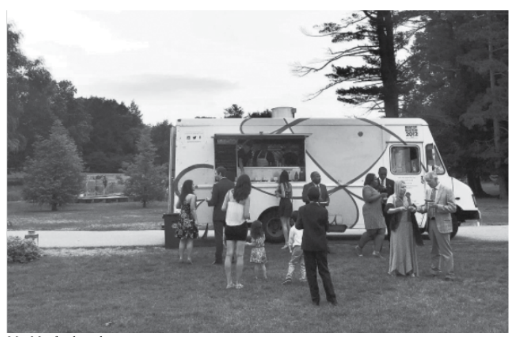
Mei Mei food truck.

Historically, farmed fish have been fed a diet consisting primarily of fishmeal and fish oil derived from wild-caught fish. This means that aquaculture as currently practiced in much of the world does not actually reduce pressure on wild fish stocks. My research is about developing low-fishmeal diets for farmed fish. I'm currently working on a project to use insects raised on dairy waste as an alternative to fishmeal and fish oil. From the industry perspective, this is seen as a way to reduce costs, but to my mind it aligns perfectly with environmental/ecological priorities. The challenge at this point is mainly nutritional: creating healthy and balanced diets from new ingredients.