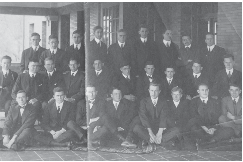
Cornell Branch 1917

In the present scheme of things, no responsibilities superior to our allegiance are admitted. We are either Americans subject to the demands of the state, or we are aliens: there are no half-way positions. We are to be either active or passive in our support of the principles the nation aims to defend, and in such a situation, we members of Telluride Association may undergo a baptism of fire that will test the strength of our organization