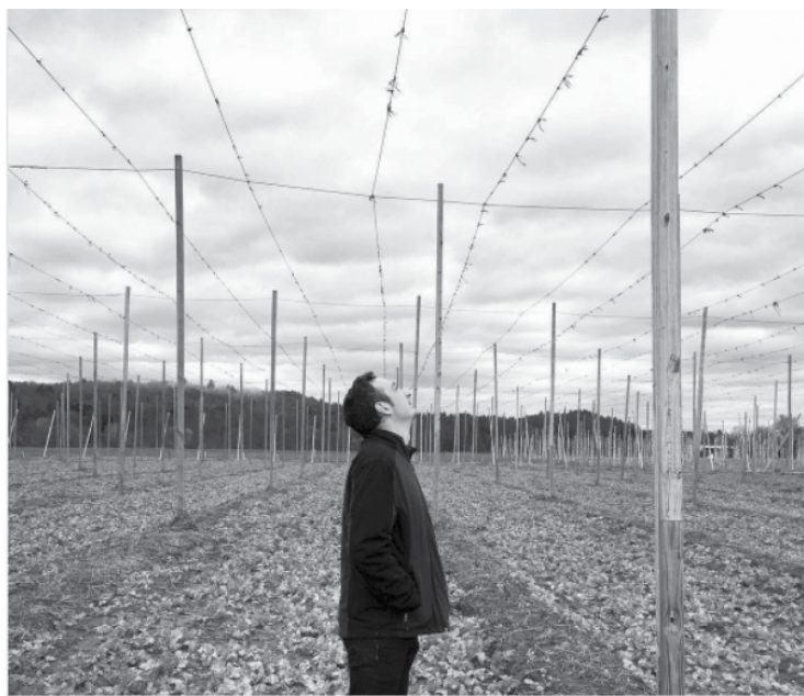
Caden Salvata visits Four Star Farms, a local supplier.

the industry feels universal, there's still an alternative minimum wage for servers in 43 states, and tipping is an archaic, racist practice that reinforces other injustices like sexual harassment and wage theft. I want diners to get clued in to all of this, and for the good food movement to champion labor practices alongside the other buzzwords like local and sustainable.