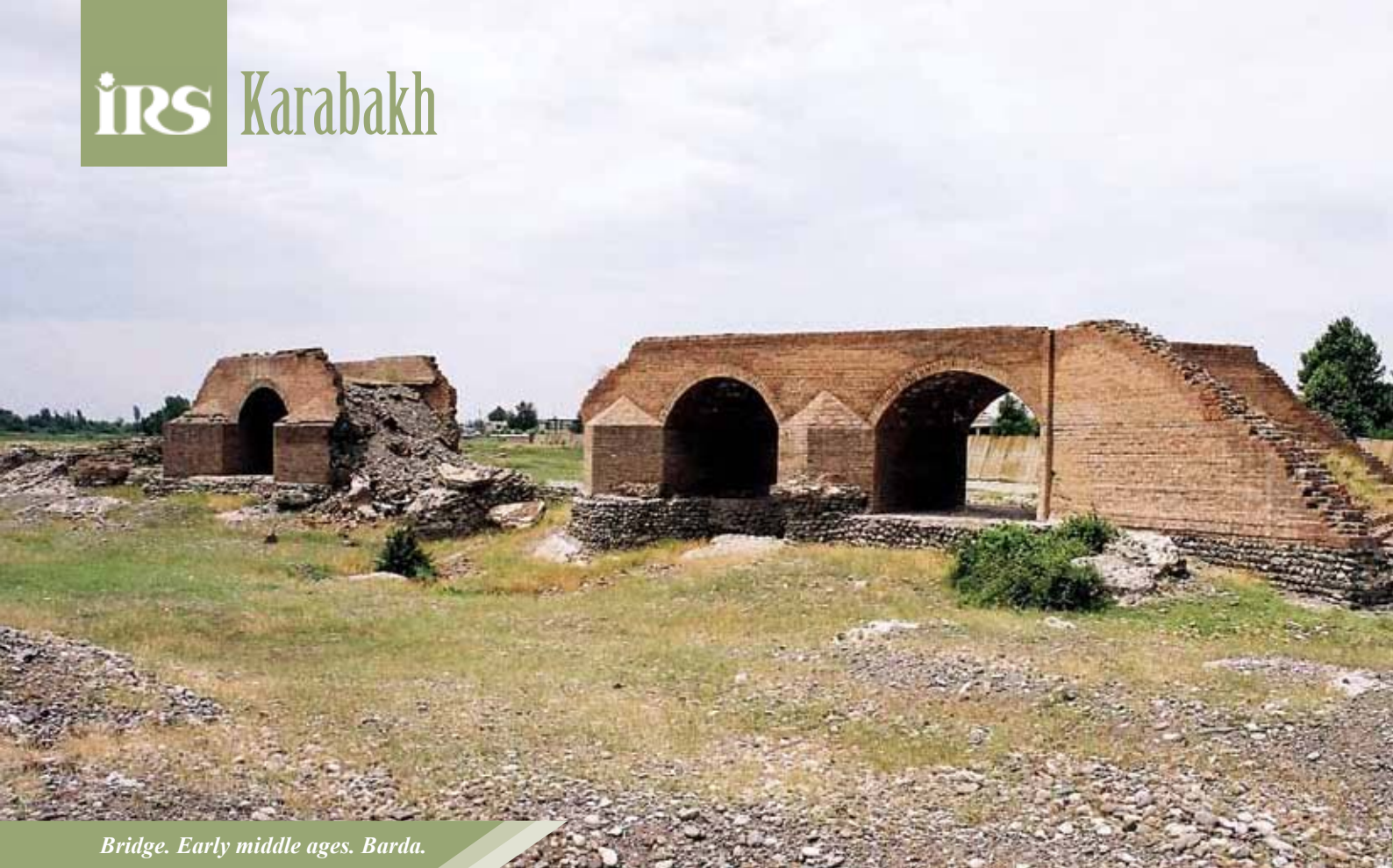
Bridge. Early middle ages. Barda.

the Dnepr and Don 14 . Karabakh was a destination for trade caravans from many countries, mainly Europe and the East. Karabakh markets were a popular transfer point and played an important part in the development of this part of Azerbaijan. This is why a large number of copper, silver and golden coins and five major hoards have been discovered here. A research of the coins has revealed that a local caulking iron appeared here in ancient times and existed until the 15 th century. Coins of many other countries were discovered in Karabakh as well, which is evidence of its participation in international commerce 15 .