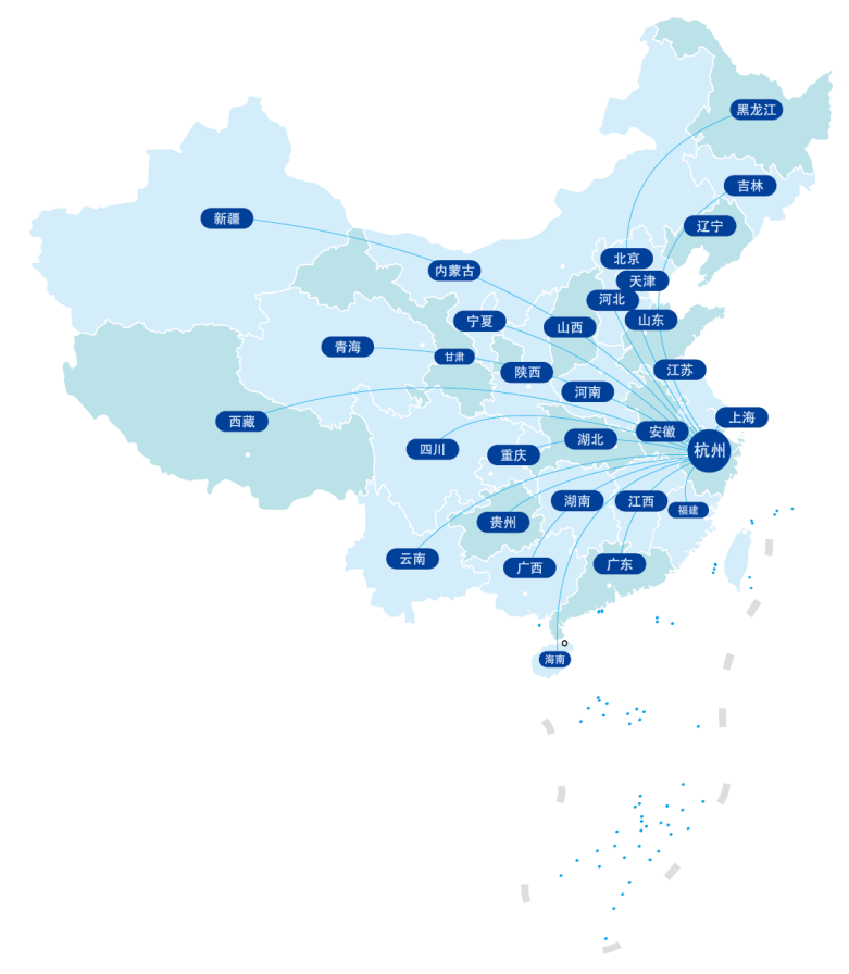
National marketing network distribution map of pharmaceutical industry

out clinical restudy of marketed products, and improved expert consensus and clinical value recognition through academic platform building. Through the differentiated market positioning of Acarbose Tablets and Acarbose Chewable Tablets, we continued to work hard in the primary-level, out-of-hospital and retail markets. The sales volume and overall market share of acarbose products remained stable throughout the year, and the proportions of out-of-hospital and retail markets increased steadily. The Company has confidence that the sales volume of acarbose will continue to grow in 2021.