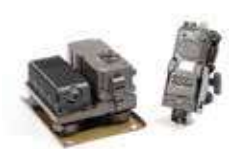
VRC-710/20 20w Vehicular/Base/ Marine/Airborne Radio set