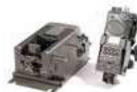
VRC-710 5w Vehicular/Base/ Marine Radio set