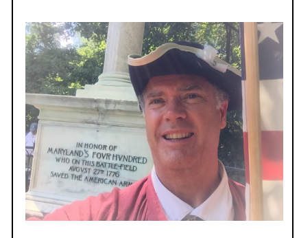
Maryland 400 Monument at Prospect Park, Lookout Point, Brooklyn, NY.