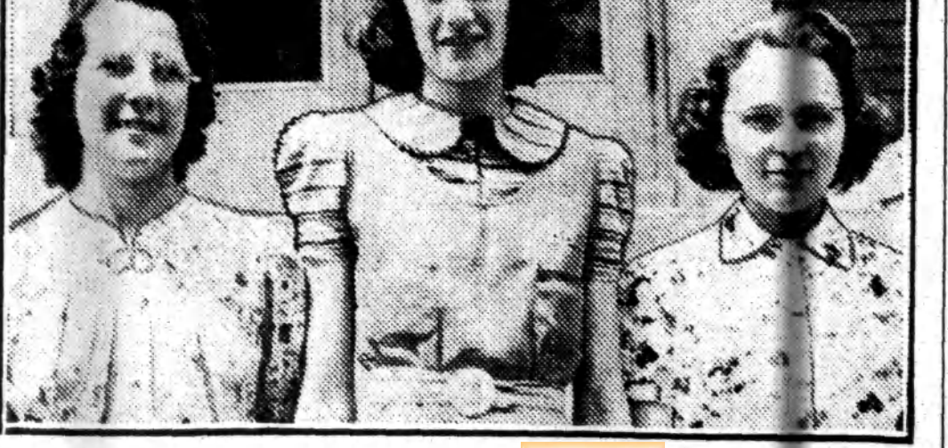
HONOR STUDENTS of the Canton Class of 1940.