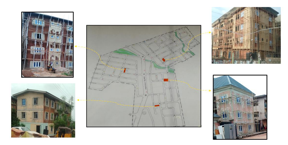
Figure 4. Map of Achara Layout and the case studies

This was obtained by an inventory of existing building stock in the layout as at the period of conducting the research, and only buildings under renovation were considered for the study. Though situated in different locations within the neighbourhood, observations, oral interviews, and empirical data collected were centred on physical measurement of window size and window area, while observations and oral interviews of four site workers provided details on the property and fenestration type of all sampled building blocks. Measurement was done using a 30m glass-fiber tape. Further instruments for data collection are photographic images as evidence for the study. Secondary sources of data include published journal papers, conference proceedings, and building standard documents available on electronic databases. Due to the qualitative nature of data collected, analysis was based on thematic content. The research results were presented using tables, photographic materials, and text. The fact that snap shots of interior spaces were not allowed was a problem in this study.