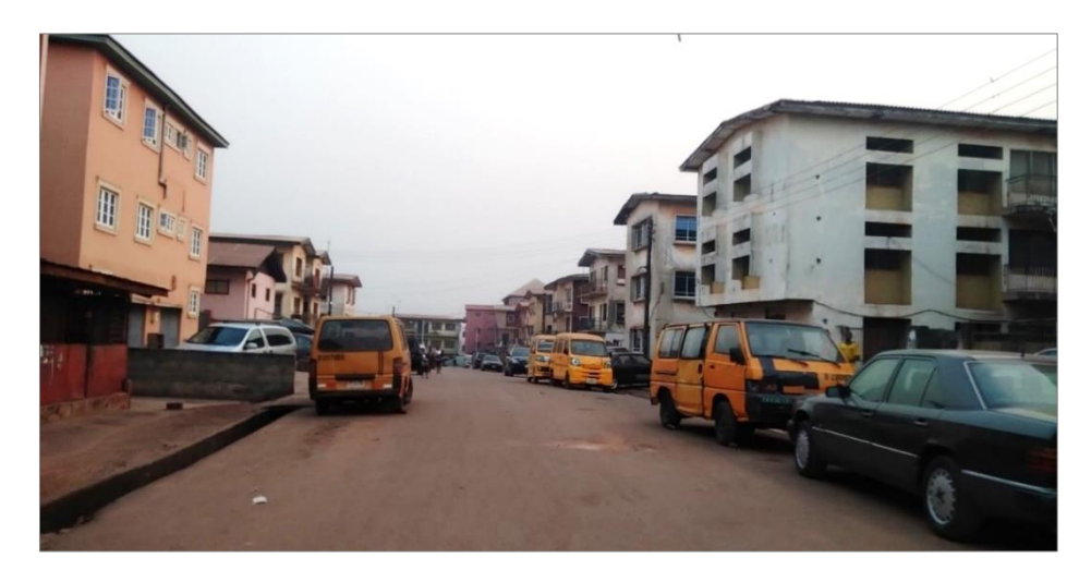
Figure 2. A typical Street view of Achara Layout in Enugu, Nigeria

From Figure 1, the selected neighbourhood was considered for the study because it is a grid-pattern planned medium density district, housing majority of middle-income class residents [32]. This neighbourhood have survived successive government administrations and is heavily built up with blocks of flat residential apartments (see Figure 2). According to the Nigerian head count of 2006, it has a population of 76,306 people and a projected figure of 112,321 in 2020 covering an area of 955ha [33]. From statistics, this is the most populated medium density neighbourhood in the city aside Abakpa and Emene districts that are both high density residential areas.