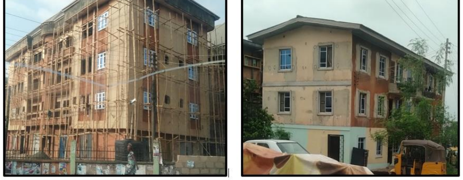
Building Block , B