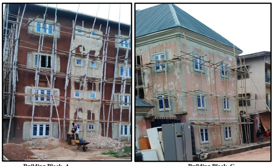
Building Block, A

Subsequently, other findings of this study are presented in the form of photographic images depicting the architectural building cases that were analyzed as evidence in support of the discussion in the next section. All four sample are undergoing renovation works. Figure 5-A, is a 3-bedroom block of flat residential building along Egbo Nnaji street; Fgure 5-B, is a 3-bedroom block of flat residential building along Jonah Agbo Street; Figure 5-C, is a 2-bedroom block of flat residential building along Amah Street; Figure 5-D, is a 2-bedroom block of flat residential building along Nnaji Nwede street all in Achara layout illustrating the dominant housing type in the metropolis.