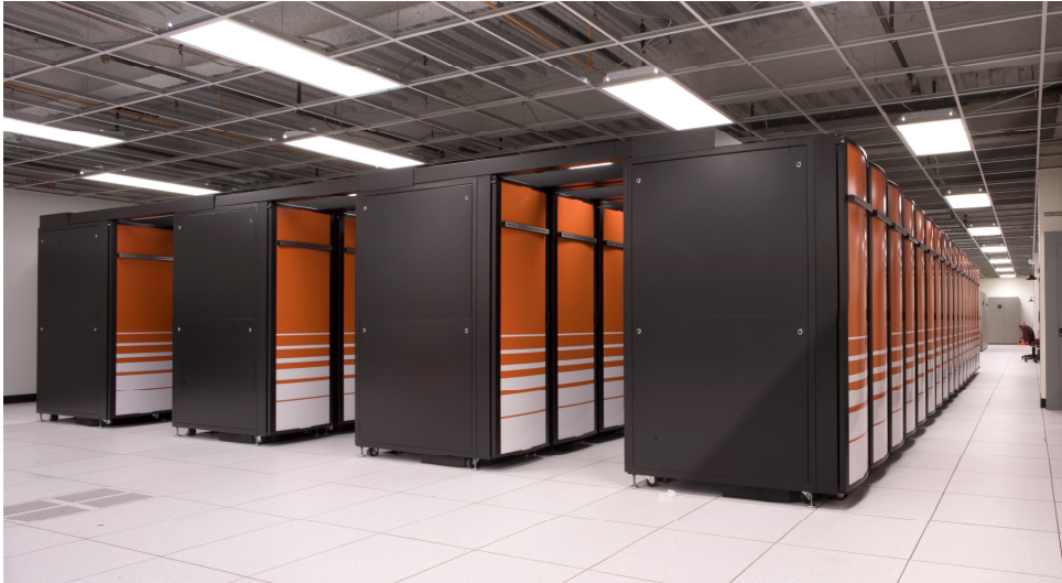
Figure 1 Oak Ridge Cray XT4

the ORNL system Jaguar began running 1.5 in production in November 2006. UNICOS/lc version 1.5 was released for general availability in December 2006. Since the release of 1.5, a total of seven minor updates have been released. The current 1.5 version is 1.5.45.