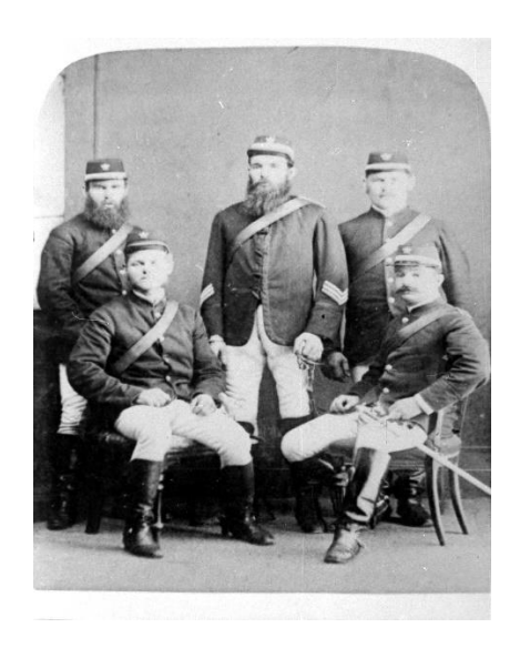
Police Officers Bridgetown c.1870s

Improvements were soon needed for the Gaol. In 1892 tenders were again called for and requested two new cells, an exercise yard and conversion of the existing cells into a change room. The two slot windows in the exercise yard were to be converted into a large, single window, but the changes never eventuated.