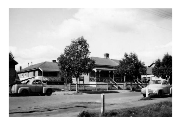
The Police Station and Quarters c. 1940s

the soft mortar out. It is likely that during the 1907 renovations the storeroom's casement window was removed and replaced with bars and shutters to provide an extra cell. Visitors had been accommodated in the storeroom until 1907.