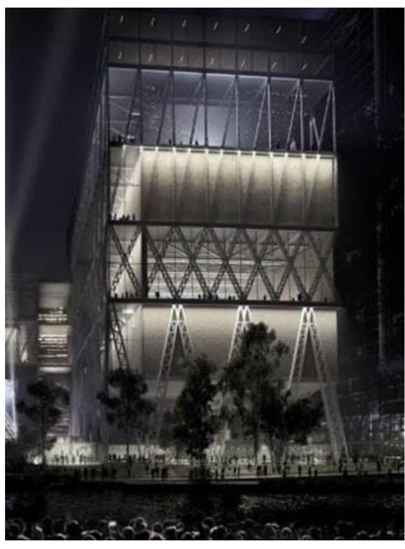
The Powerhouse Parramatta