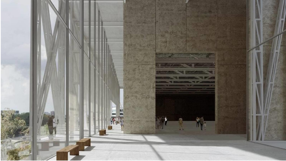
The design for the Powerhouse Museum at Parramatta.

"We will also be passing a close eye over the proposed budget given the billion dollar cost overruns that almost every infrastructure project has faced under the Coalition."