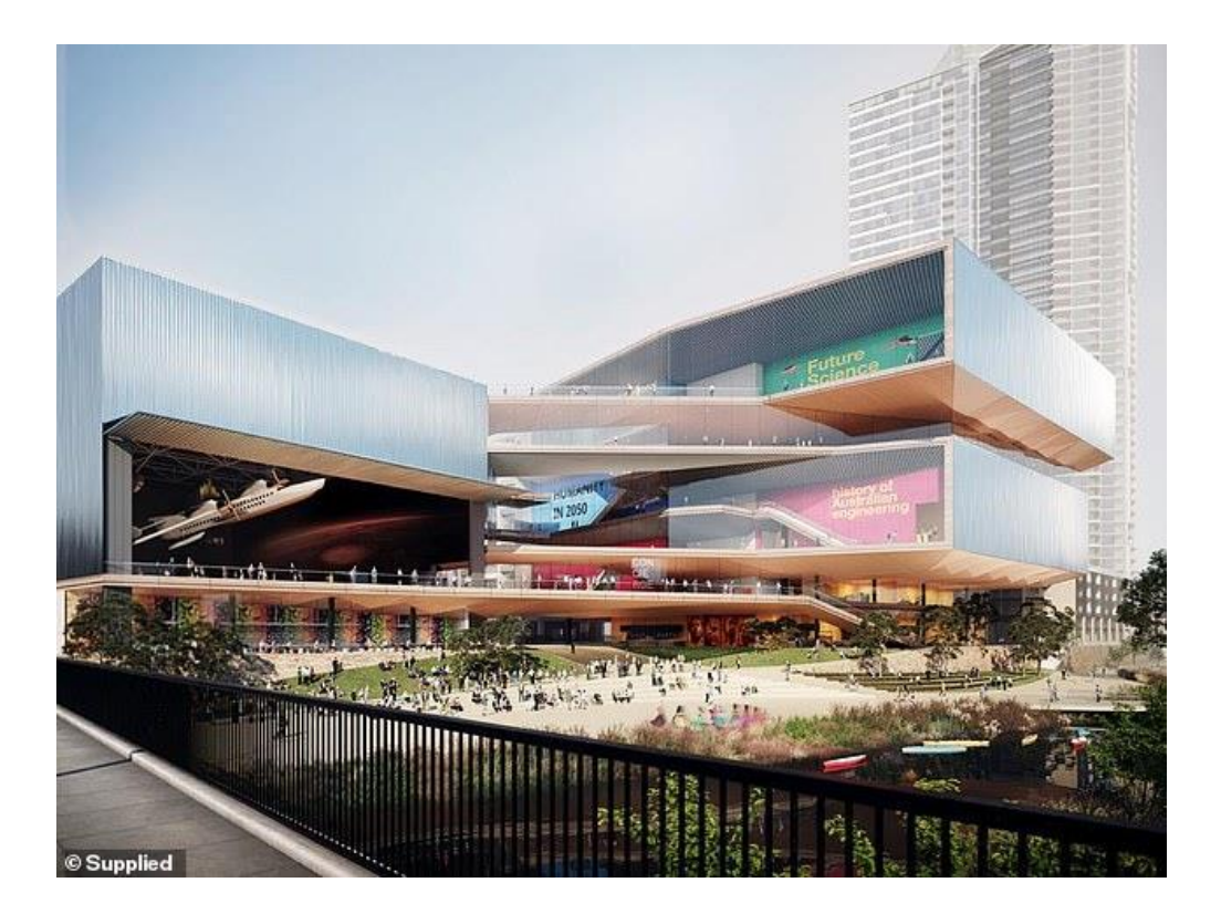
The multicoloured design which incorporates converging shapes and staggered level balconies was proposed by the UK's AL_A and Australia's Architectus (pictured)

Political observers were beginning to suspect the ambitious Parramatta Powerhouse move would be shelved as Australia falls into a recession as a result of the COVID-19 pandemic.