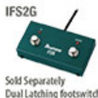
Sold Separately Dual Latching footswitch