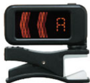
Clip Chromatic Tuner