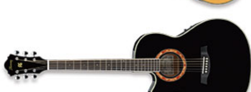
BK (Black High Gloss) NEW FINISH