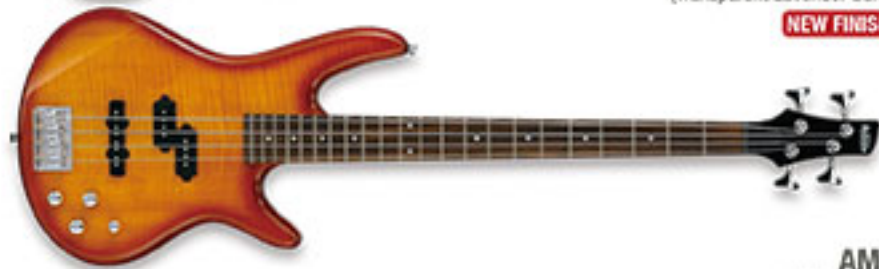
AMB (Amber Burst)