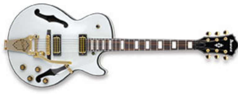
TSW (Twinkle Snow)