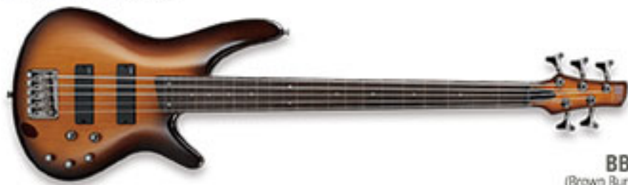
BBT (Brown Burst)