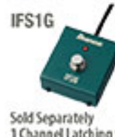
Sold Separately 1 Channel Latching footswitch