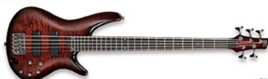
CNB (Charcoal Brown Burst)