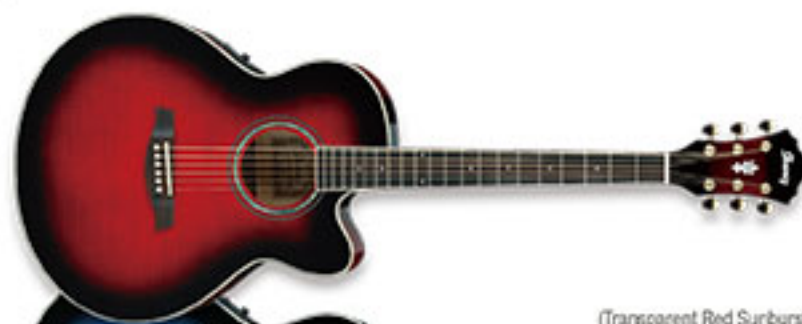
TRS (Transparent Red Sunburst High Gloss)