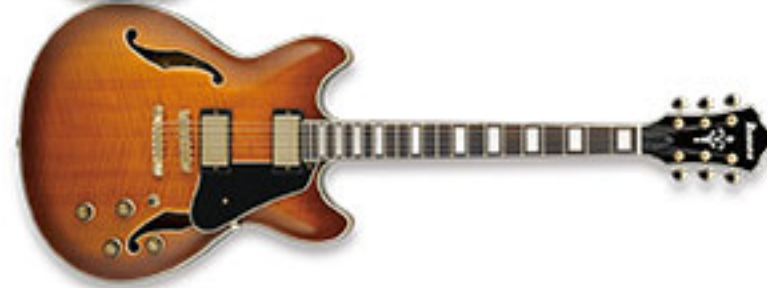
VLS (Violin Sunburst)