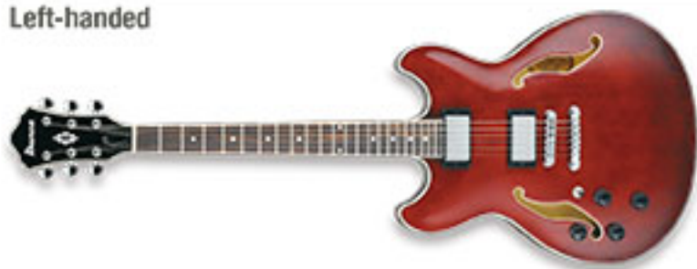
TCR (Transparent Cherry)