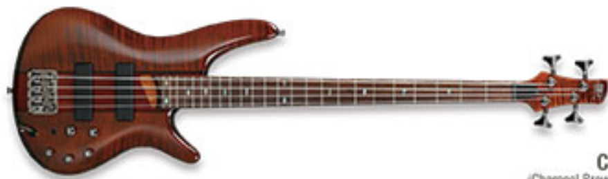
CN (Charcoal Brown)