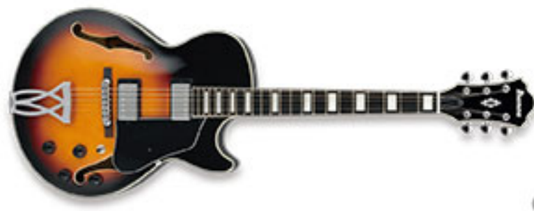
BS (Brown Sunburst)