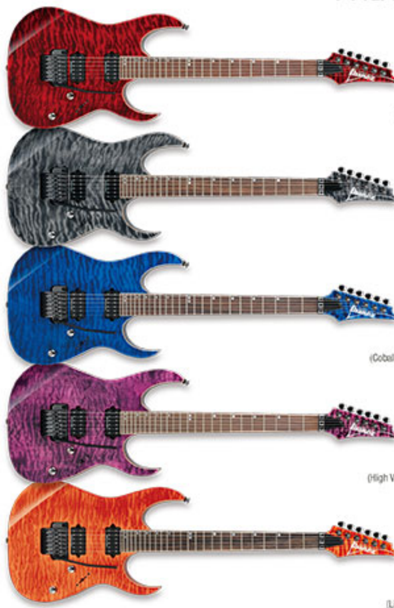
RDT (Red Desert)