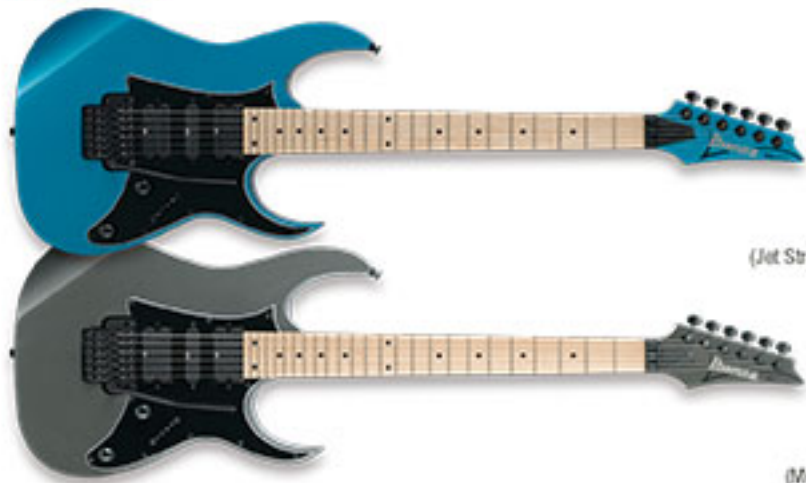
JSG (Jet Stream Green)