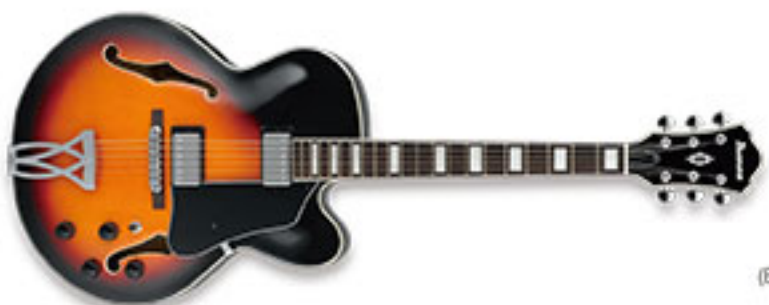
BS (Brown Sunburst)

Ibanez introduced Artcore in 2002 and has been the hollow-body guitar of choice for musicians for the last 10 years. The Artcore's combination of quality workmanship and affordability has created legions of fans from diverse genres as blues, country, rock and jazz. Musicians can find the purity of an old school style jazz-box to a hybrid semi-hollow rocker. Artcore is highly respected for its tone, sustain and the way they hold their tuning and how the series continues to push the boundaries of guitar building.