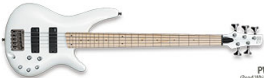
PW (Pearl White)