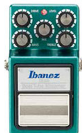
Bass Tube Screamer