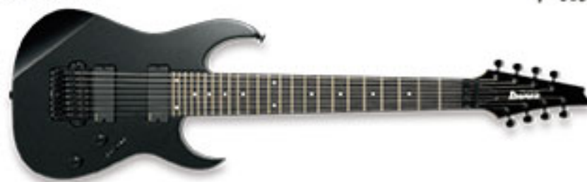
GK (Galaxy Black)