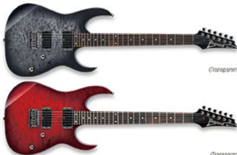
TGB (Transparent Gray Burst)