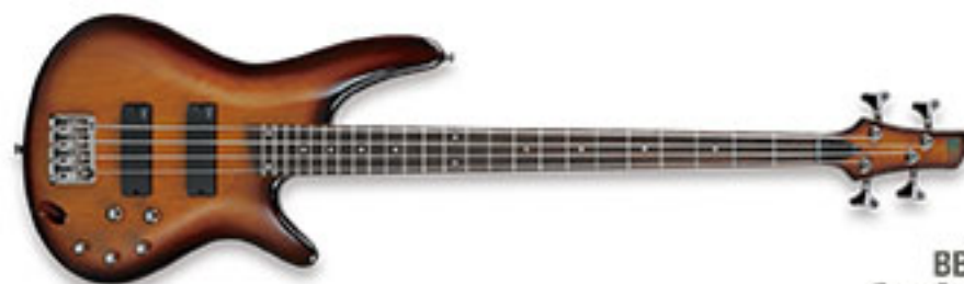
BBT (Brown Burst)