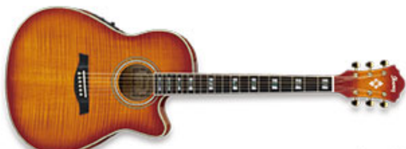
VV (Vintage Violin Sunburst)