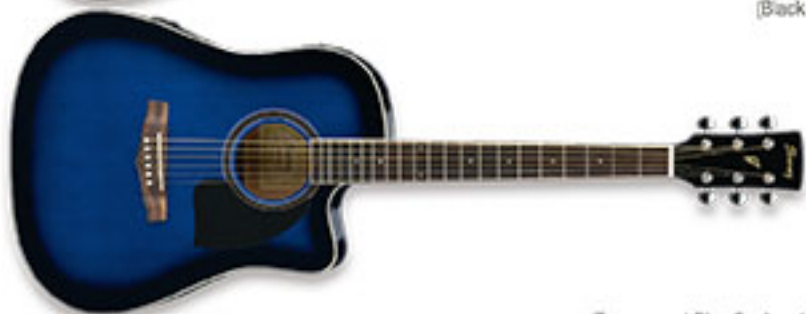
TBS (Transparent Blue Sunburst High Gloss)