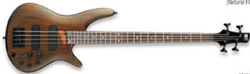
WNF (Walnut Flat)