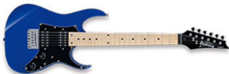
JB (Jewel Blue)