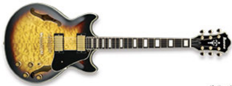
AYS (Antique Yellow Sunburst)