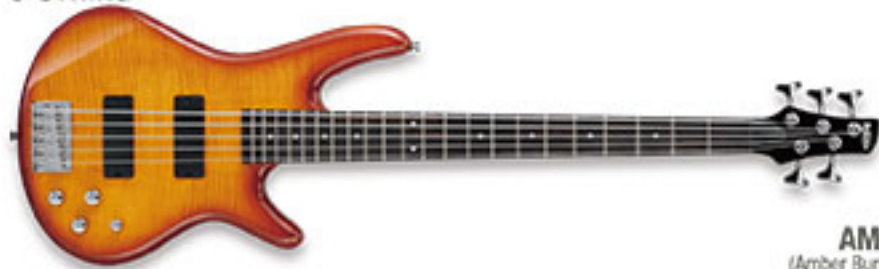
AMB (Amber Burst) NEW FINISH