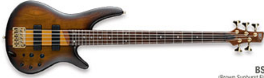
BSF (Brown Sunburst Flat)