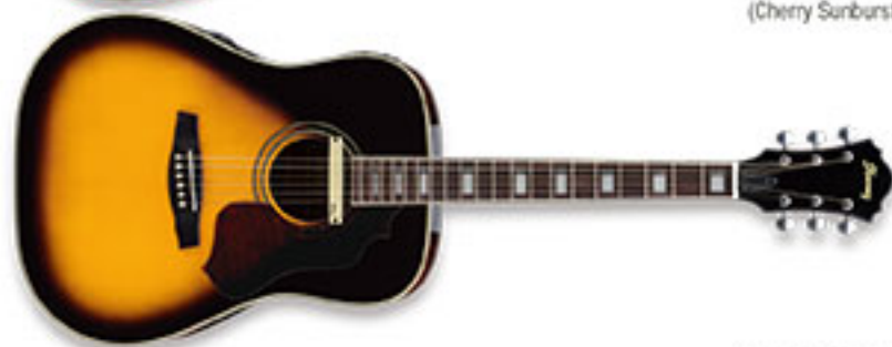
VS (Vintage Sunburst High Gloss)