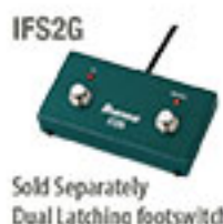
Sold Separately Dual Latching footswitch