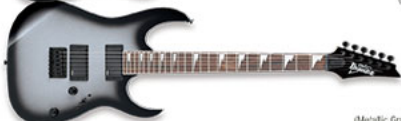
MGS (Metallic Gray Sunburst)