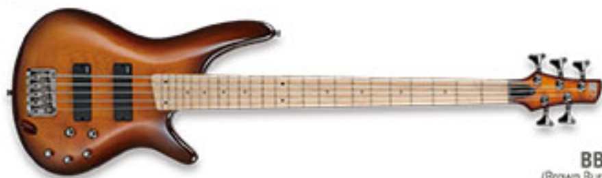
BBT (Brown Burst)