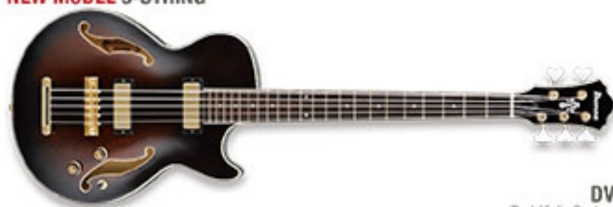
DVS (Dark Violin Sunburst)