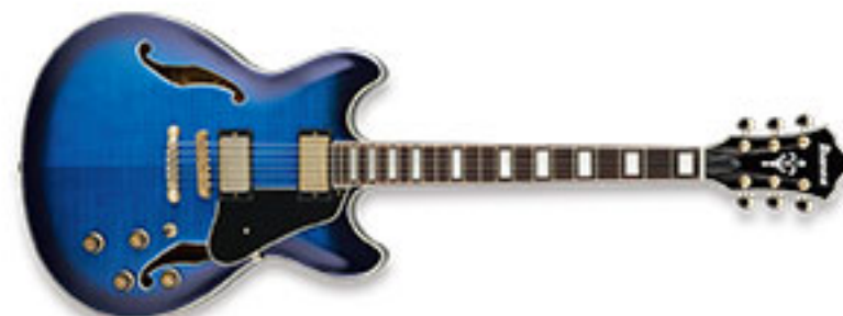
BLS (Blue Sunburst)