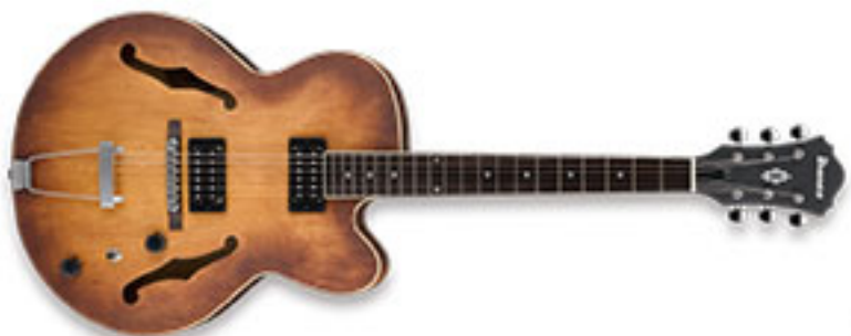
TF (Tobacco Flat)