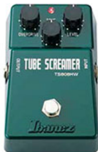
Hand-Wired Tube Screamer