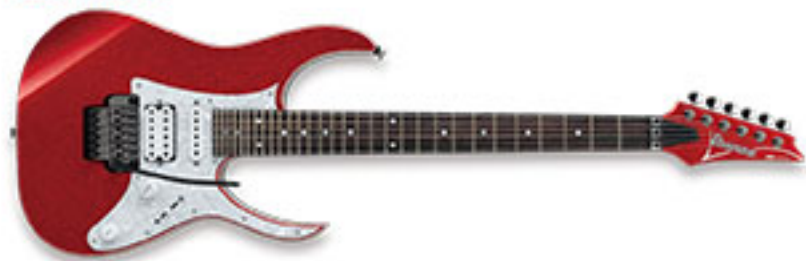
RSP (Red Sparkle)