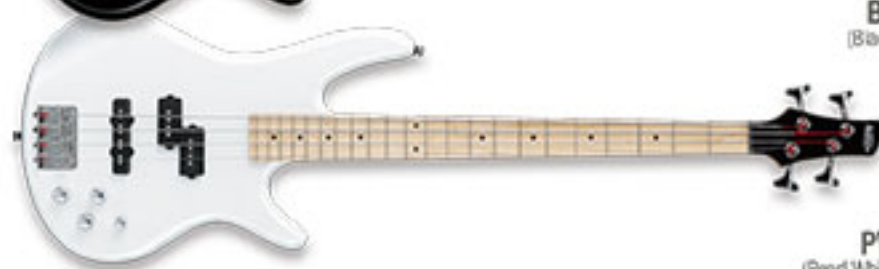
PW (Pearl White)