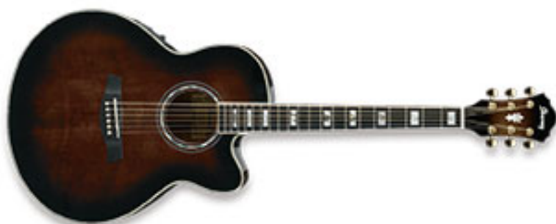
DVS (Dark Violin Sunburst High Gloss)

AEL A large body guitar isn't always what you want if the sound isn't right. The Ibanez AEL series, however, has the size, projection and beautiful tones that you need for any situation. The AEL is Ibanez's largest acoustic guitar body and is an excellent choice for players who want an expansive, natural acoustic sound. Plugged in, the AEL has Fishman® electronics delivering a sweet cascade of acoustic tones, never harsh or tinny, ready for any stage.