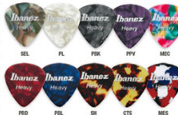
Acoustic Guitar Pick Packages NEW MODEL