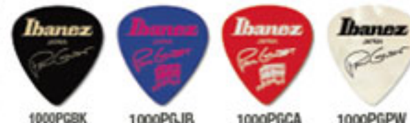
Steve Vai Signature Pick Packages