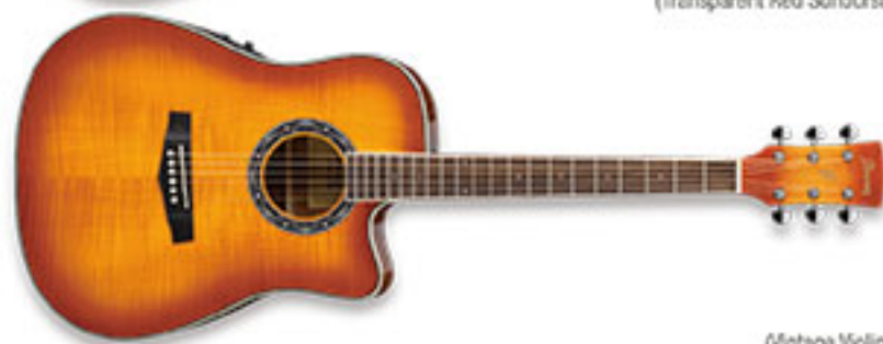
WV (Vintage Violin High Gloss)