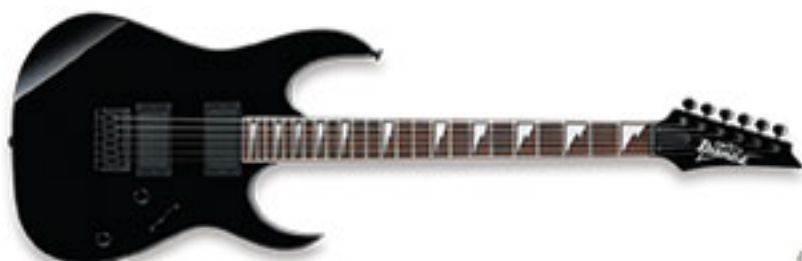
BKN (Black Night)