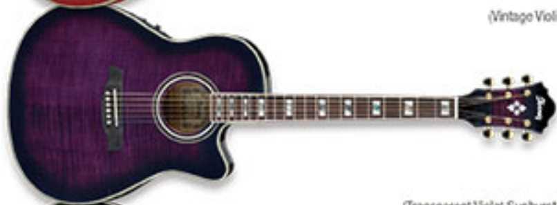
TVS (Transparent Violet Sunburst High Gloss)