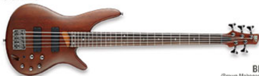
BM (Brown Mahogany)