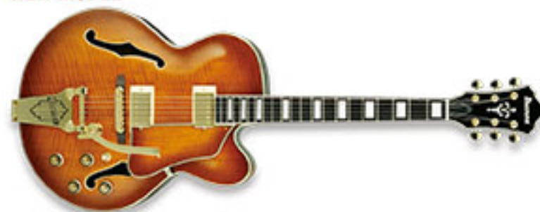
VLS (Violin Sunburst)