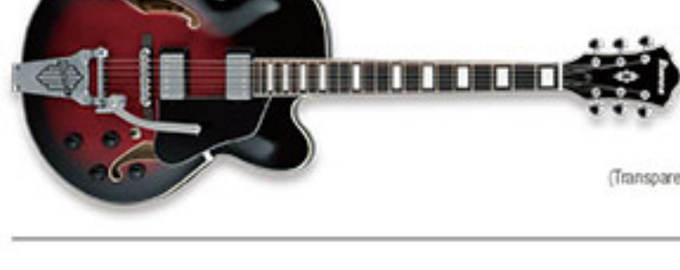
TRS (Transparent Red Sunburst) NEW FINISH