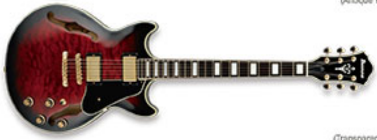
TRS (Transparent Red Sunburst)