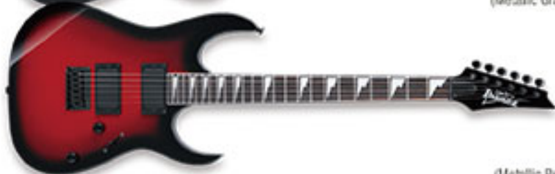
MRS (Metallic Red Sunburst)