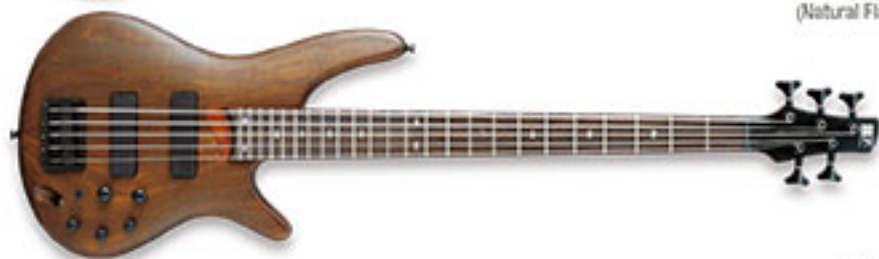
WNF (Walnut Flat)