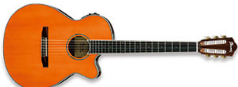
TNG (Tangerine High Gloss)