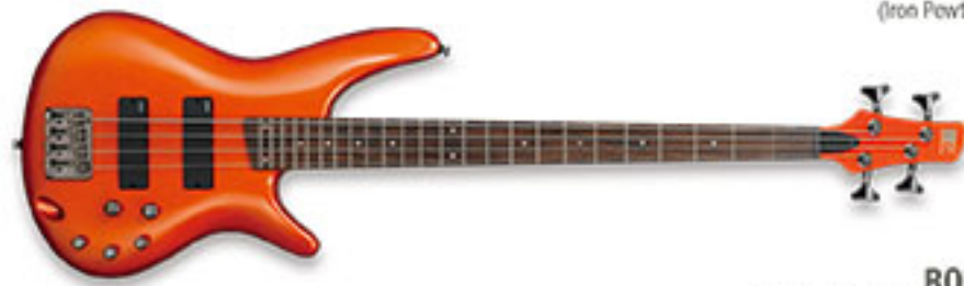
ROM (Roadstar Orange Metallic)