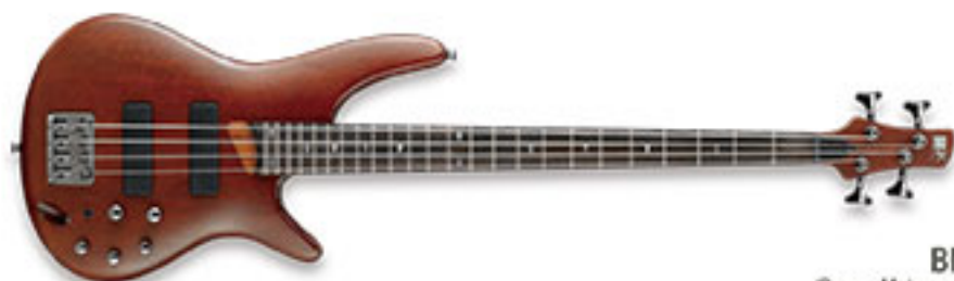
BM (Brown Mahogany)