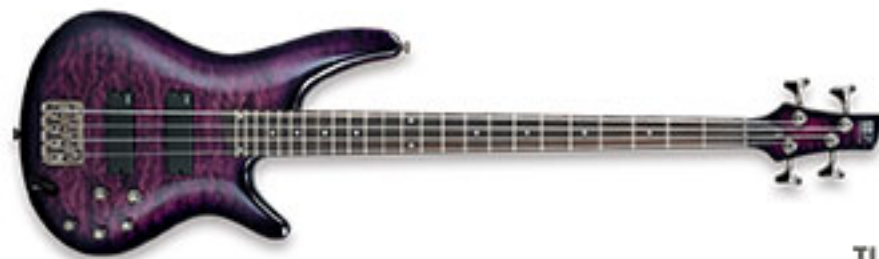
TLB (Transparent Lavender Burst)