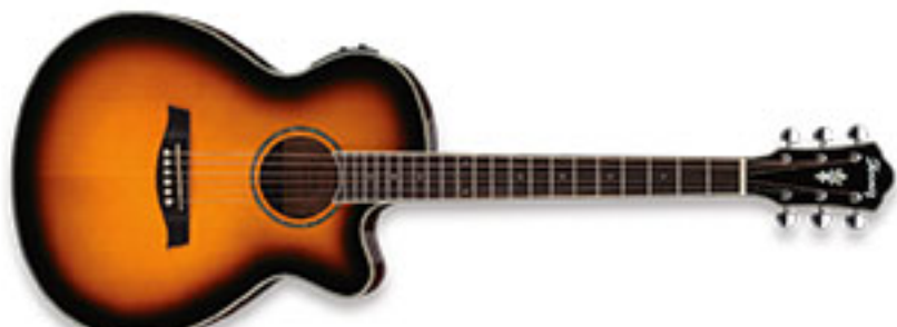
VS (Vintage Sunburst High Gloss)