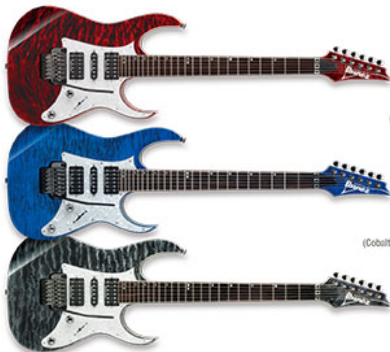
RDT (Red Desert)