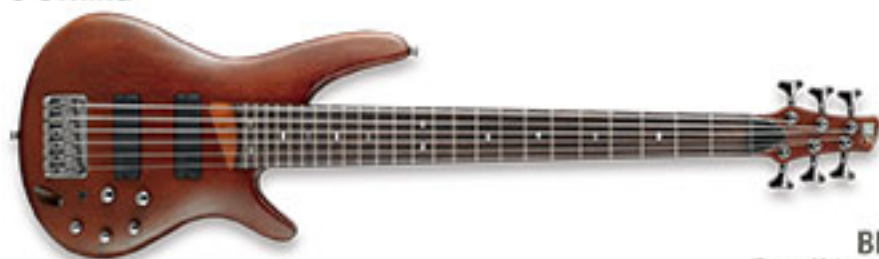
BM (Brown Mahogany)