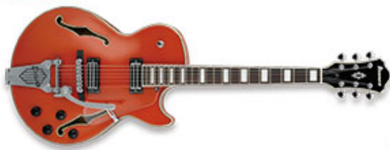
TLO (Twilight Orange)