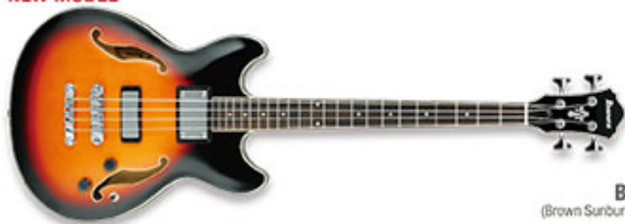
BS (Brown Sunburst)