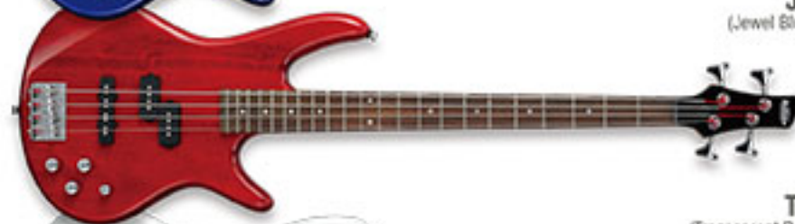
TR (Transparent Red)