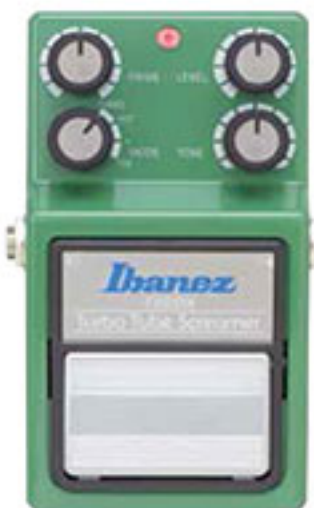
Turbo Tube Screamer