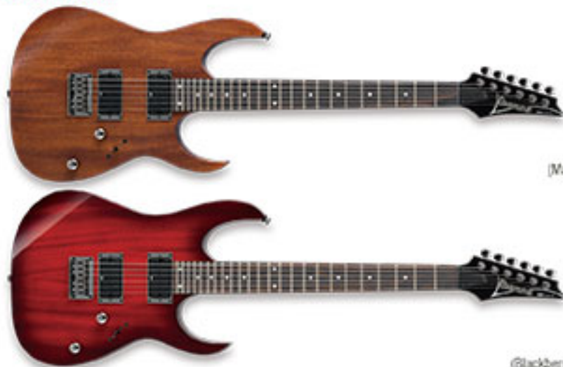
MOL (Mahogany Oil)