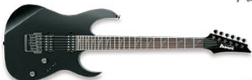
GK (Galaxy Black)