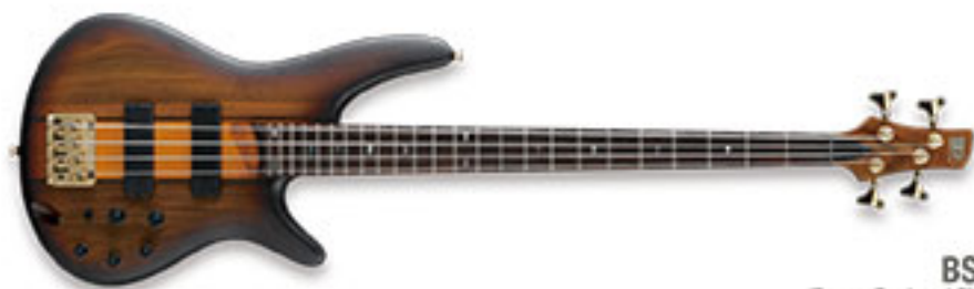
BSF (Brown Sunburst Flat)