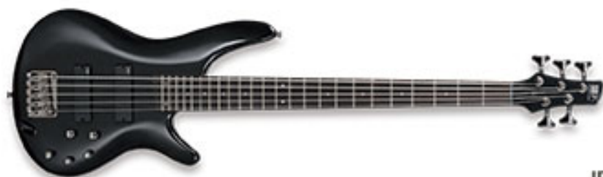
IPT (Iron Powder)