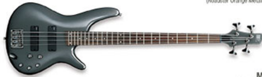
MG (Metallic Gray)