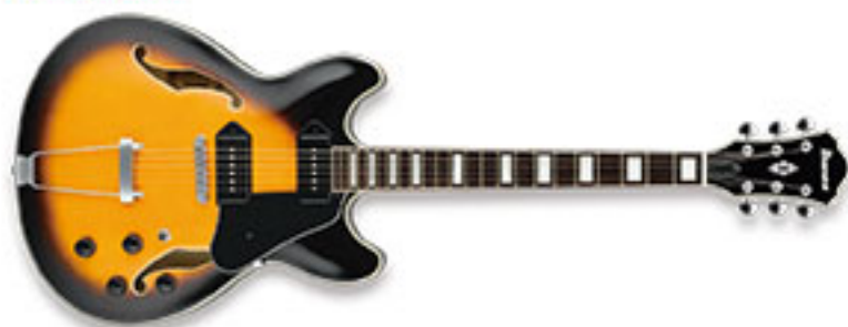
VB (Vintage Burst)