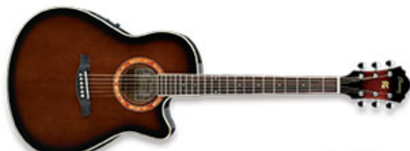
DVS (Dark Violin Sunburst High Gloss)