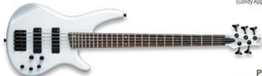
PW (Pearl White)