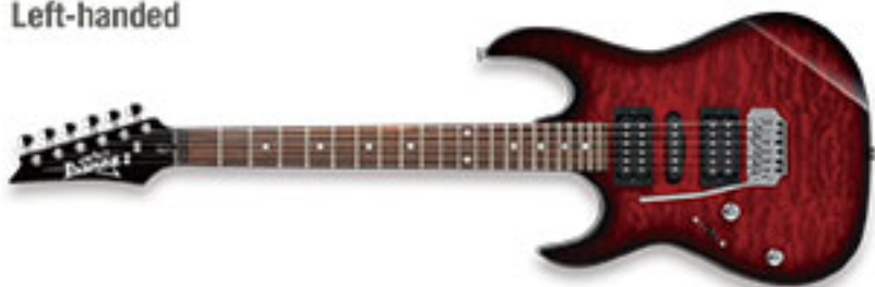
TRB (Transparent Red Burst)