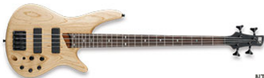
NTF (Natural Flat)