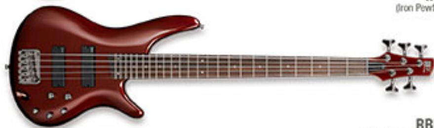
RBM (Root Beer Metallic) NEW FINISH