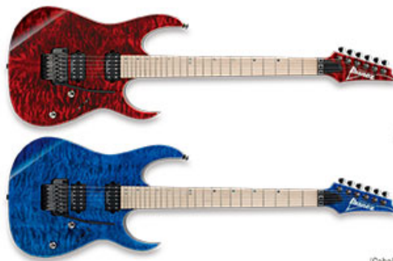
RDT (Red Desert)