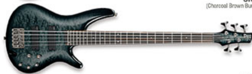
TGB (Transparent Gray Burst)