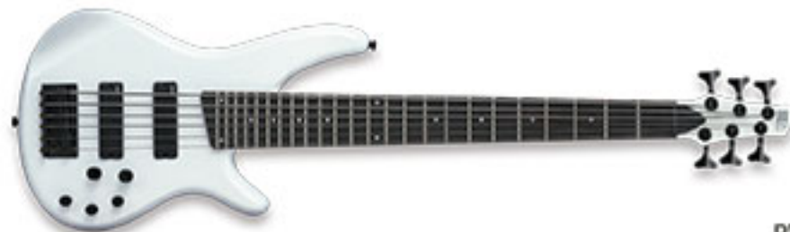
PW (Pearl White)