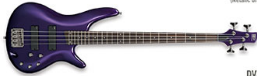
DVM (Deep Violet Metallic) NEW FINISH