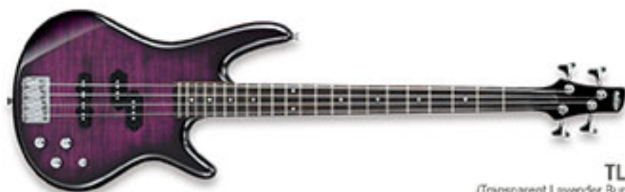
TLB (Transparent Lavender Burst)

GSRs offer the famous Soundgear sleekness, comfort, tone, and playability. Not only do GSR Soundgears look and play better than everything else in their price range, but their rigorous inspection, set-up and warranty is the same as Ibanez's more expensive models.