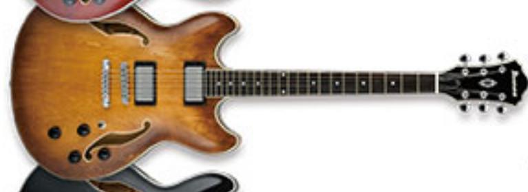
TBC (Tobacco Brown) NEW FINISH