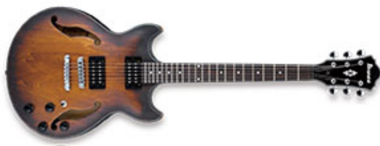
TF (Tobacco Flat)