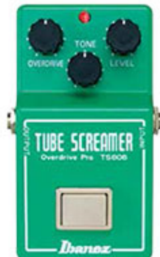
The Original Tube Screamer