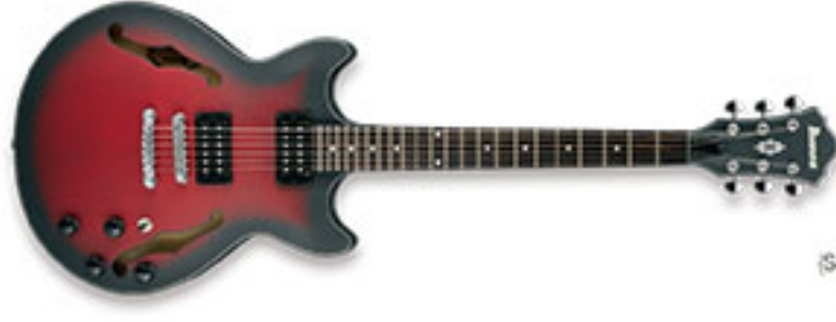
SRF (Sunburst Red Flat) NEW FINISH