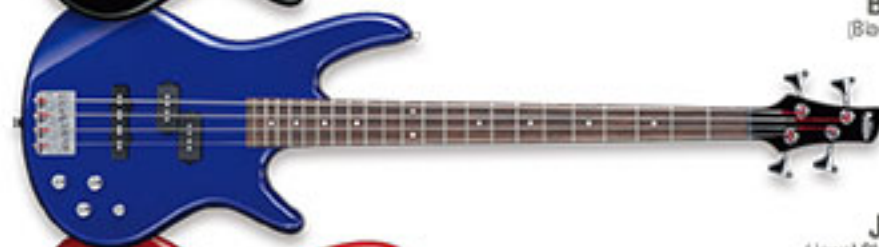
JB (Jewel Blue)