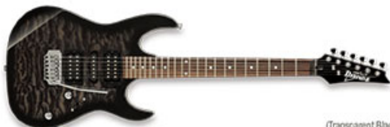
TKS (Transparent Black Sunburst)