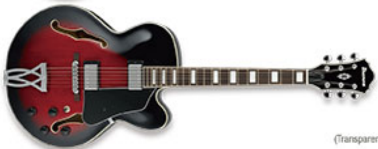
TRS (Transparent Red Sunburst)