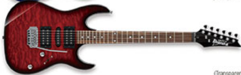
TRB (Transparent Red Burst)