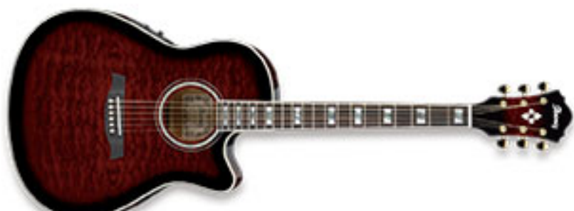
TCS (Transparent Black Cherry Sunburst High Gloss)

AEF Back by popular demand, the improved feedback-resistant AEF body offers an ergonomic and comfortable shape. AEF models feature a large range of: striking sunburst and solid finishes, Quilted or Flamed maple top/back/sides, or a spruce top with Mahogany body. The AEF37E and AEF30E models feature pearl block and abalone fretboard inlays while the AEF18E offers a laser engraved fire rosette. For comfort, clear highs, and strong midrange punch, there's no acoustic guitar that gets it all done at such an affordable price.