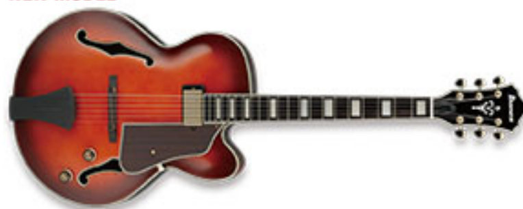
SRD (Sunset Red)