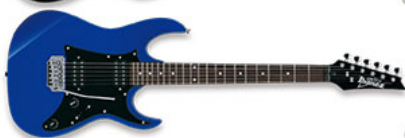
JB (Jewel Blue)