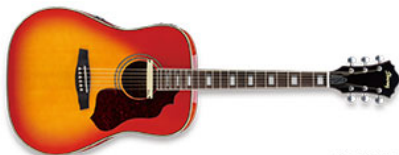
CS (Cherry Sunburst High Gloss)

SAGE There is no rule that your first guitar can't sound and look great. The Sage features large, classic pickguards that contribute to the Sage's understated vintage styling. The specially designed AP3 magnetic pickup produces a fuller, warmer sound. In appearance, sound, and playability, the Sage sets a new benchmark in entry-level guitars.