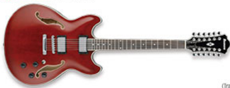
TCR (Transparent Cherry)