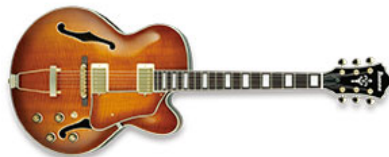
VLS (Violin Sunburst)