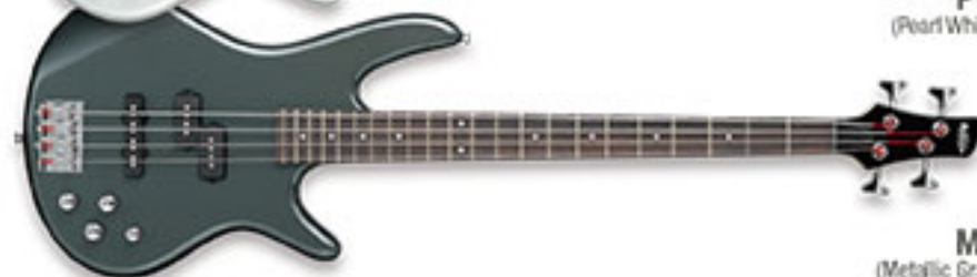
MG (Metallic Gray)