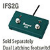
Sold Separately Dual Latching footswitch