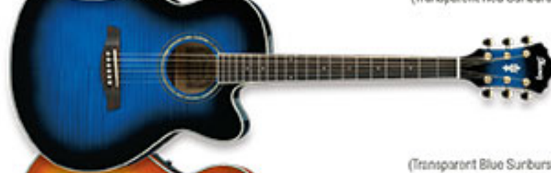
TBS (Transparent Blue Sunburst High Gloss)