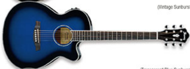
TBS (Transparent Blue Sunburst High Gloss)