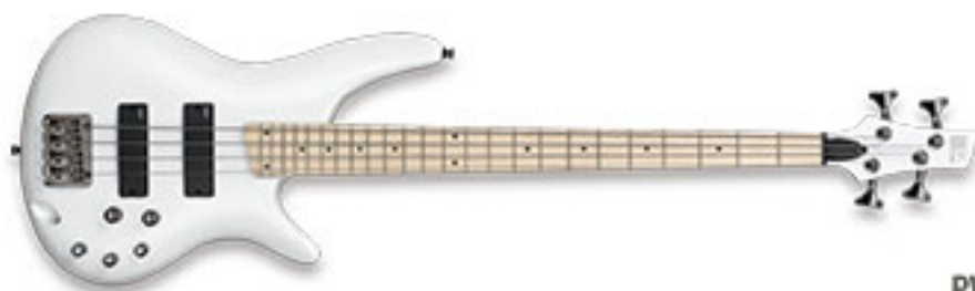
PW (Pearl White)