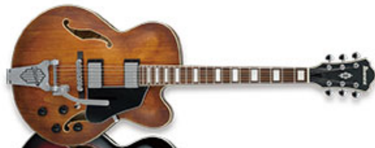
TF (Tobacco Flat)