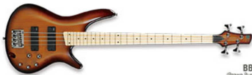
BBT (Brown Burst)