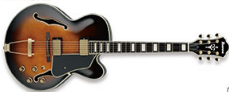
VSB (Vintage Sunburst)