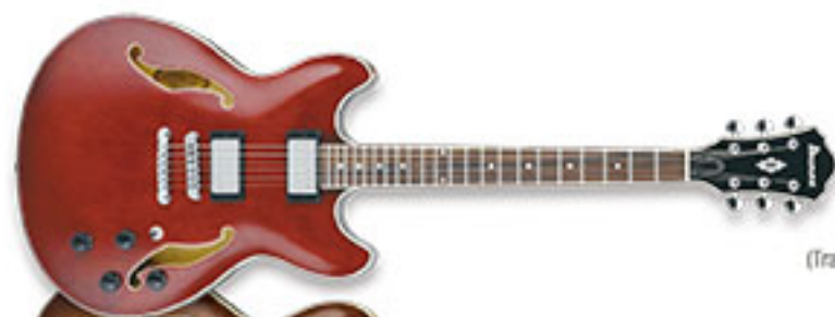
TCR (Transparent Cherry)