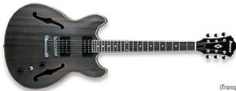
TKF (Transparent Black Flat)