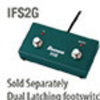
Sold Separately Dual Latching footswitch