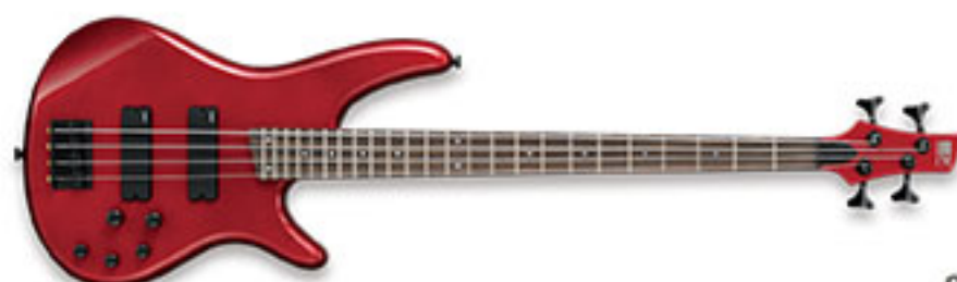
CA (Candy Apple)