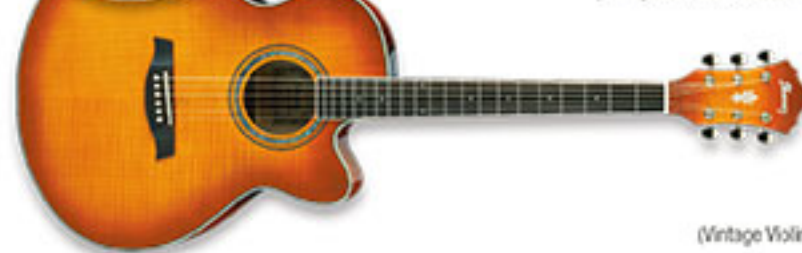
VV (Vintage Violin High Gloss)