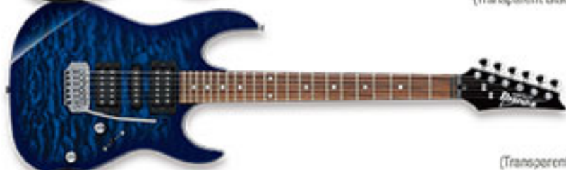
TBB (Transparent Blue Burst)