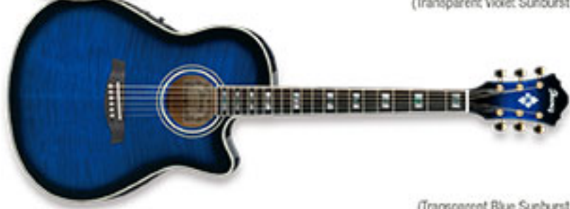
TBS (Transparent Blue Sunburst High Gloss)