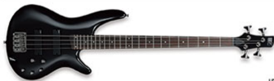
IPT (Iron Powder)