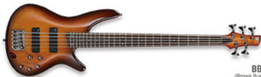
BBT (Brown Burst)