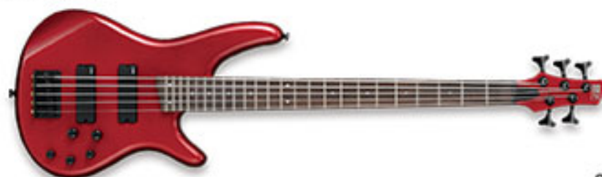
CA (Candy Apple)