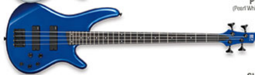
SLB (Starlight Blue)