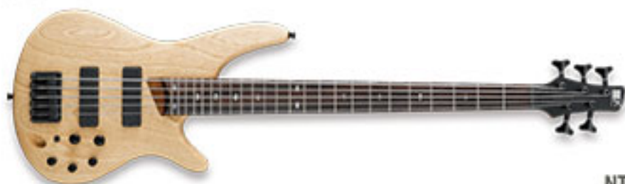
NTF (Natural Flat)