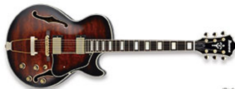
DBS (Dark Brown Sunburst)