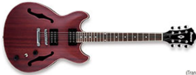
TRF (Transparent Red Flat)