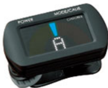
NEW MODEL Clip Auto Tuner