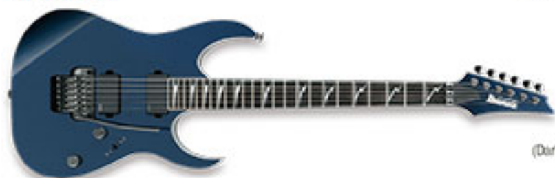
DTB (Dark Tide Blue)