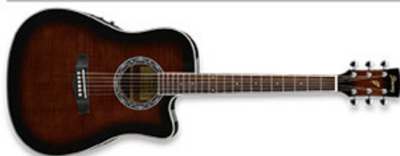
DVS (Dark Violin Sunburst High Gloss)