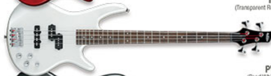
PW (Pearl White)