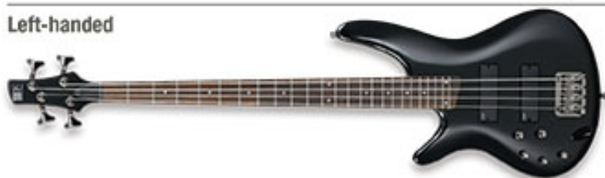
IPT (Iron Powder)