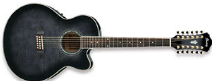
TKS (Transparent Black Sunburst High Gloss)