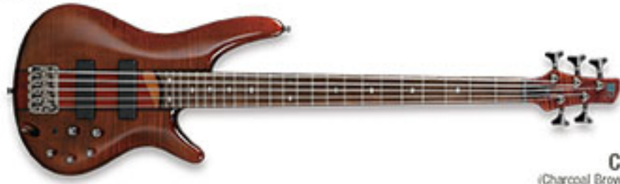
CN (Charcoal Brown)