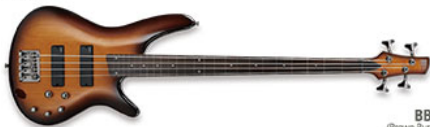
BBT (Brown Burst)