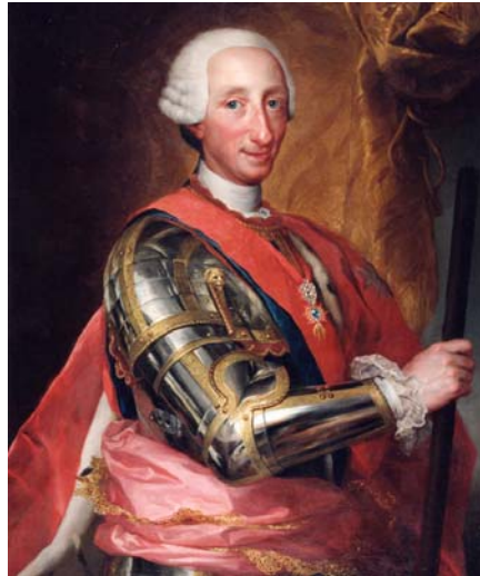
CARLOS III, KING OF SPAIN (1716-1788)