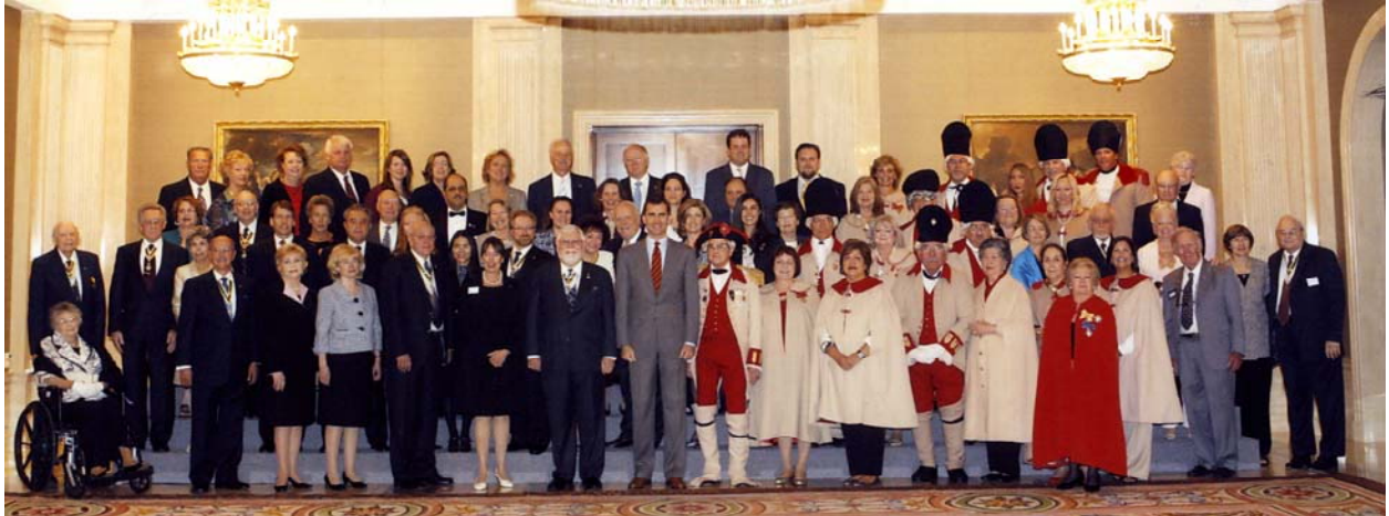
SAR and Granaderos de Galvez Meet with Crown Prince Felipe of Spain