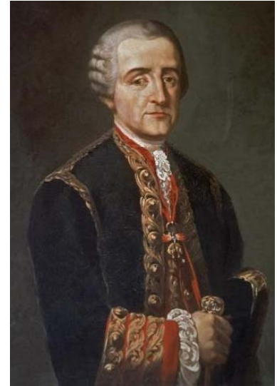
PEDRO PABLO ABARCA DE BOLEA, CONDE DE ARANDA SPANISH AMBASSADOR TO FRANCE (1719-1798)