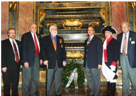
Wreath at Tomb of King Carlos III at El Escorial