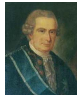
JOSE DE GALVEZ Y GALLARDO, MINISTER OF THE INDIES (1720-1787)