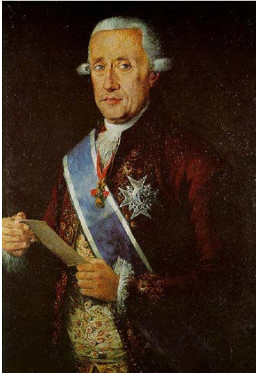
JOSÉ MOÑINO Y REDONDO, CONDE DE FLORIDABLANCA CHIEF MINISTER OF SPAIN (1728-1808)