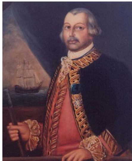
BERNARDO DE GÁLVEZ Y MADRID, GOVERNOR OF LOUISIANA (1746-1786)