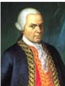
MATIAS DE GALVEZ Y GALLARDO, CAPTAIN GENERAL OF GUATEMALA (1725-1784)