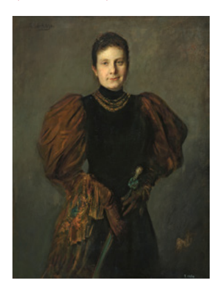
The Infanta Paz de Borbón

1894. Oil on canvas Museo Nacional del Prado