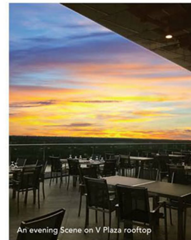
An evening Scene on V Plaza rooftop