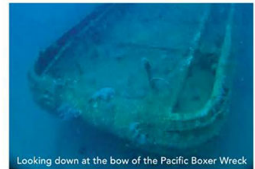
Looking down at the bow of the Pacific Boxer Wreck