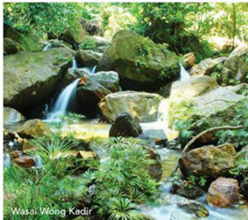
Wasai Wong Kadir