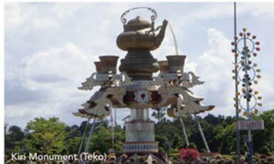
Kiri Monument (Teko)