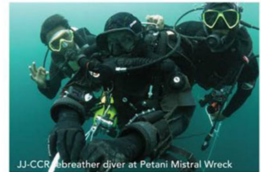
JJ-CCR rebreather diver at Petani Mistral Wreck