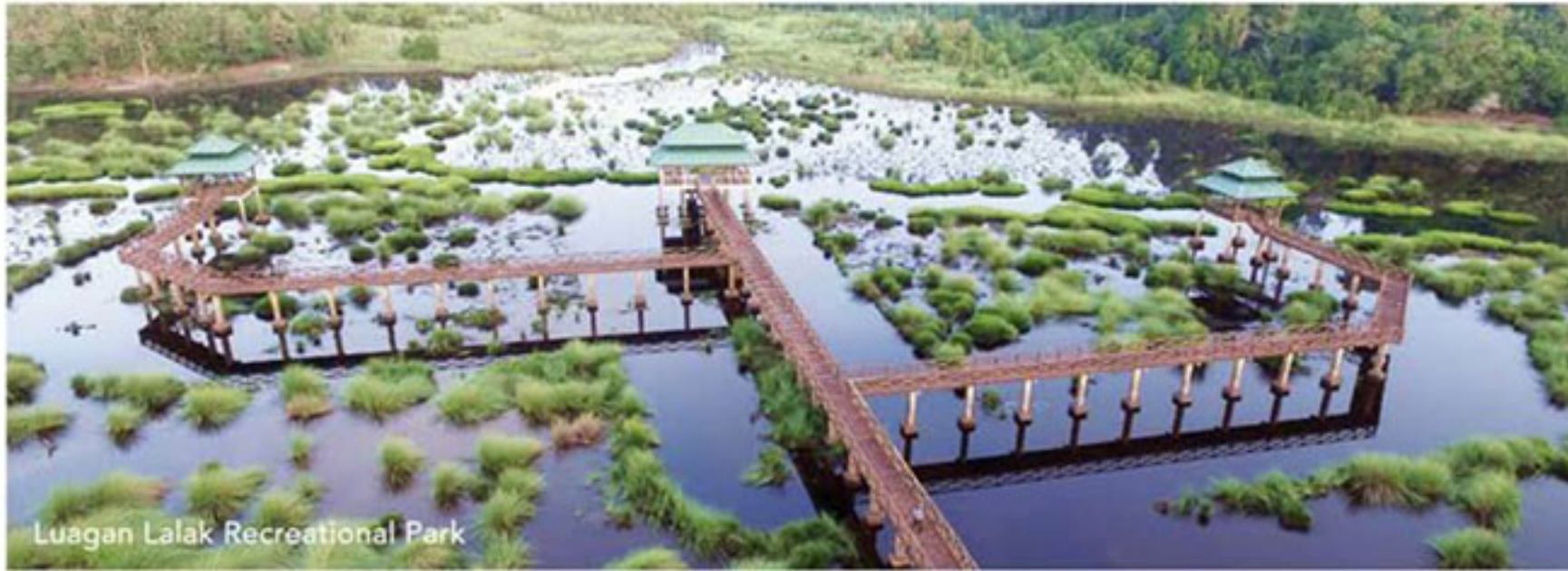
Luagan Lalak Recreational Park

If you're seeking peace and serenity, this is the tour package for you. Luagan Lalak Recreation Park is a freshwater swamp with lush greenery. Visitors can take a stroll in the park along its wooden walkways, the perfect getaway for nature-lovers. A fruit farm tour and visit to a traditional longhouse are sandwiched between. Your day ends with a stop at one of Belait's hidden treasures – the Wasai (Waterfall) Wong Kadir – where you can bathe in the natural water which is home to a myriad of freshwater fish and prawns.