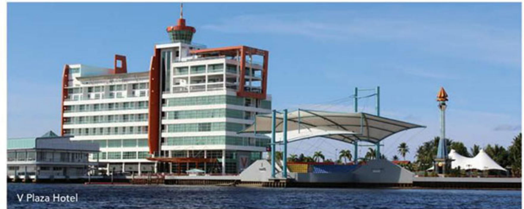
V Plaza Hotel