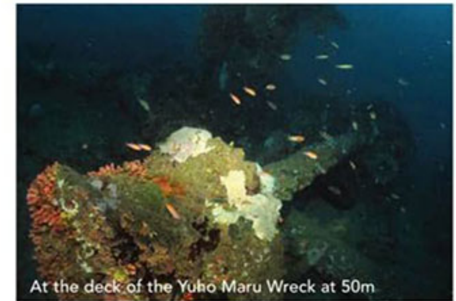
At the deck of the Yuho Maru Wreck at 50m