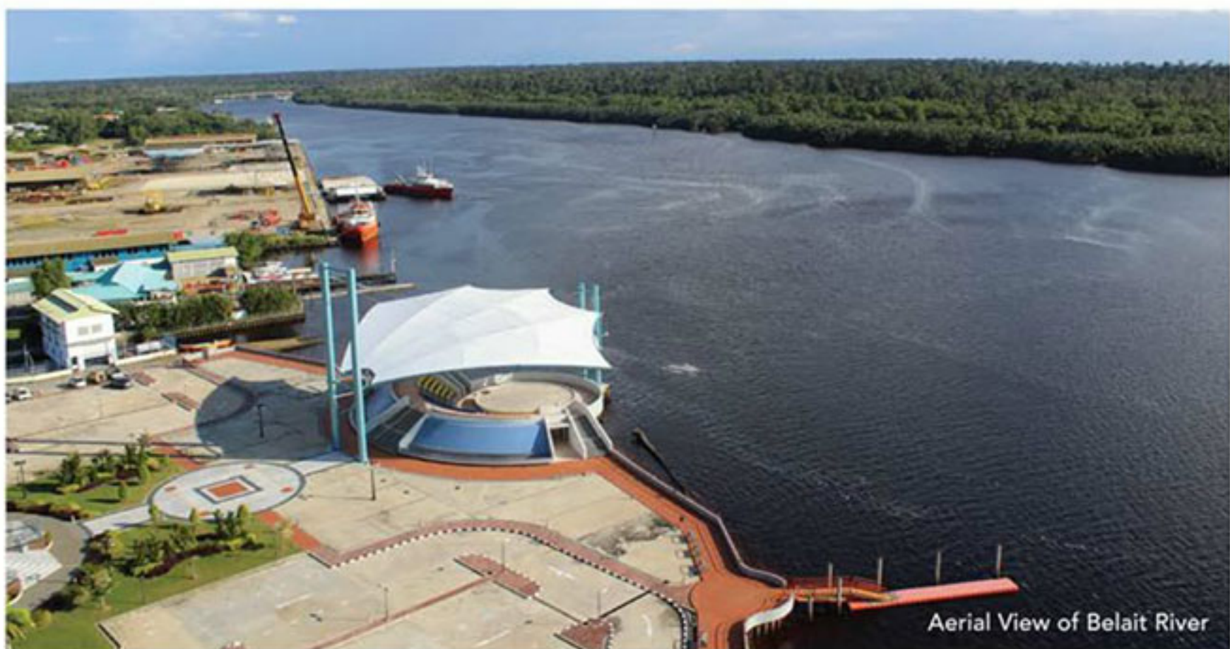
Aerial View of Belait River