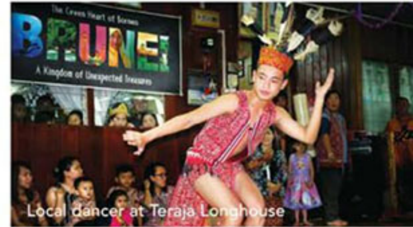
Local dancer at Teraja Longhouse