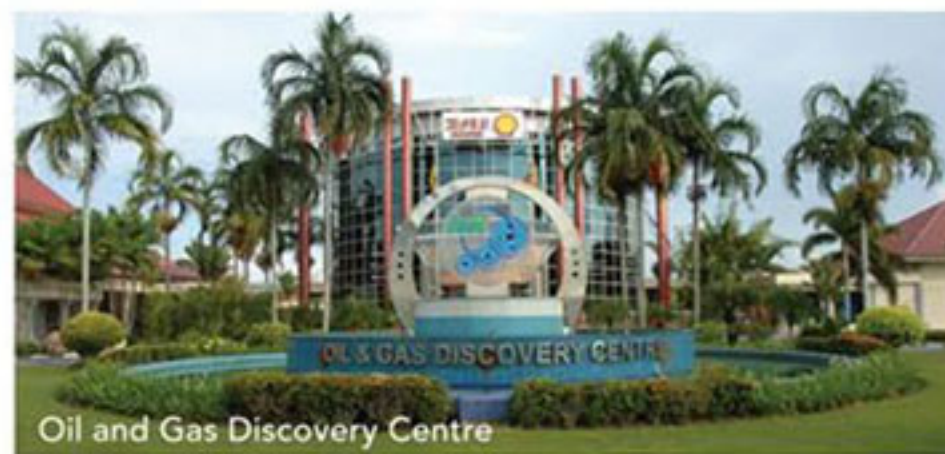
Oil and Gas Discovery Centre

Energy is a core pillar of Brunei Darussalam's economy, much of which can be attributed to the Belait district and Seria Town, where oil was first discovered. Ease into the day with stops and photo opportunities at some of Kuala Belait's most iconic landmarks, including the Silver Jubilee Park, Istana Mangalela and Menara Cendara Kenangan. The afternoon tour of Seria town features a submersive oil and gas experience, learning about the major companies and their processing facilities, as well as photo stop at the iconic Billionth Barrel Monument and a visit to the Oil and Gas Discovery Centre.