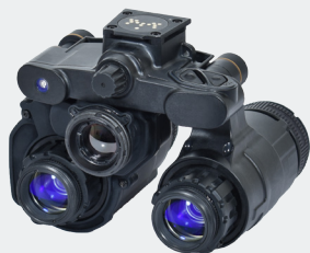
ENVG-B Directed Requirements Contract