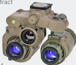
ENVG-B Program of Record Contract