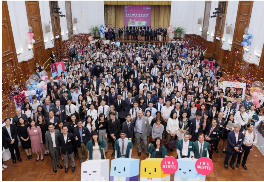
View of all the people attending the Mentorship Inauguration Ceremony