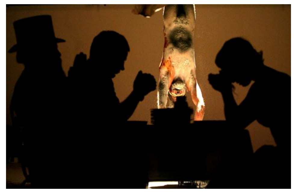
Six Minutes 2007 (Live Performance) FNB Dance Umbrella, National Arts Festival Fringe, Out the Box Fest RSA 60min