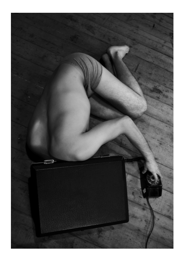
Suckle 2007 (Live Performance) Out the Box Fest RSA 60min