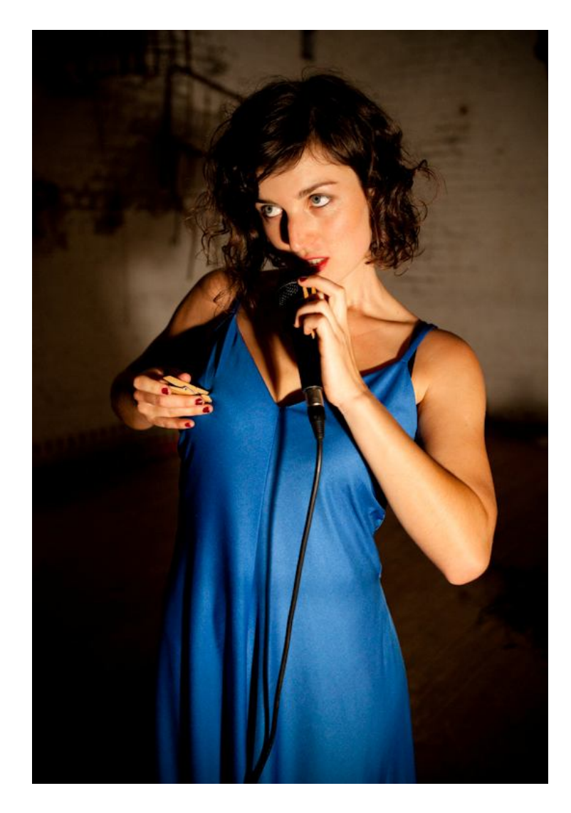
O the happy living things (Working Title) 2011 (Live Performance) GIPCA Gordon Institute for the Performing & Creative Arts 28min