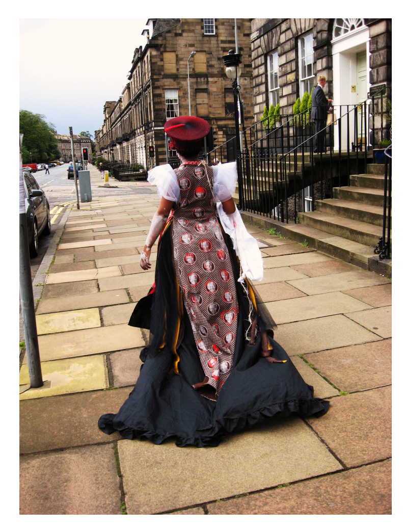
Inkosazana 2009 (Live Performance) Edinburgh Fringe UK, Out the Box Fest RSA 60min