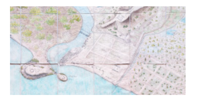
The Bute Map, c. 1820

The treaty granted the EIC the exclusive right to lease a plot of land to set up a "British factory". Following the Anglo-Dutch Treaty in 1824, a new treaty was signed between the EIC and Singapore's Malay rulers that ceded full sovereignty of the island to the EIC.