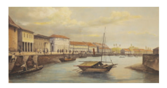
View From the Mouth of the Singapore River, 1830 Sketch by François-Edmond Pâris Engraved by Sigismond Himley Paris, 1835 Collection of National Library, Singapore

Known as the Bute Map, this earliest known landward map of Singapore was likely commissioned within the first year of the establishment of a British trading post in Singapore. It provides a remarkable view of the early development of the settlement.