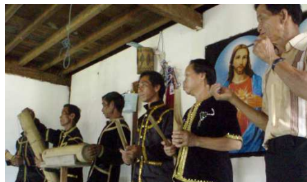
Fig. 2: From left: sompoton , tongkungan , tongkibong , tongkawir , and bungkau .

The traditional musical instruments of Dusun Tindal are mainly made of bamboo wood, bronze or brass, and goat or cow skin. The ones still exist today are suling , sompoton , tongkungan , tongkawir , tongkibong ,