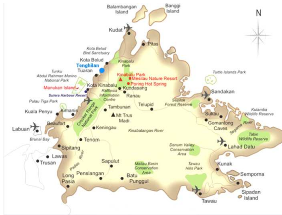
Fig. 1: Map of Tenghilan Town.

Kampung Tinuhan is a village with the distance approximately 10 minutes' drive away from the town of Tenghilan. Kampung Tinuhan is about 25 square kilometers in size with an estimated population of 350. Tenghilan is a small town (around 400 hectares) located on the west coast of Sabah, Malaysia, within the district of Tuaran. It is situated between the capital city of Kota Kinabalu and city of Kota Belud. The distance from Tenghilan to Kota Kinabalu is approximately 38 kilometers (about 45 minutes' drive).