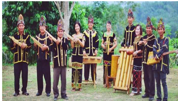
Fig. 3: Combination of traditional and modern Dusun Tindal musical instruments in Bamboo Orchestra.

Bamboo Orchestra is a new form of Dusun Tindal music ensemble which uses a combination of modern and traditional musical instruments. All the musical instruments are made of bamboo. The Bamboo Orchestra is currently very popular among the Dusun Tindal across the whole state of Sabah. The arrangement of the music compositions in Bamboo Orchestra performances is modernized and apt to imitate the simple popular musical styles by adding in the traditional musical melodies and aesthetical flavors. It is an effort to renovate and revive Dusun Tindal traditional bamboo musical instruments and ensembles. It is considered quite successful in attracting and promoting Dusun Tindal musical culture among the young generations, as well as opening up a new door for their music to reach the outside world (ibid.).