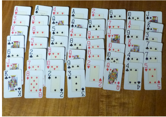
Fig. 2. Freecell (cells and foundation empty and not shown): not quite the impossible deal 11982 (see text)

Thanks to its popularity and the de facto standardisation of deal numbering, Freecell has been well studied with solver programs 7 , and a good deal is known about it including that only 8 of the first million deals are not solvable. The deal shown in Figure 2 was the result of the author trying to photograph the first of these, deal 11982. However there is a mistake: the deal 11982 has 10♥ and 8♥ swapped from their true positions in that deal. It is interesting that this small change actually makes the deal solvable (needing the full 4 cells), just as deal 11982 is soluble with 5. The distributed file freecelldeal.csp illustrates these facts.