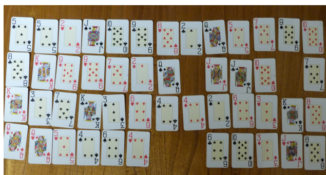
Fig. 1. A Montana deal after the aces are removed

A move in Montana is either to place a 2 in a space that appears in the first column or, in any other column, to place the card which follows (in the same suit) the card immediately to the left of the space. Thus the space