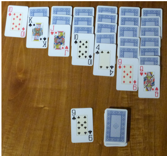
Fig. 4. Deal of Klondike, with stock and waste below, foundation missing and empty