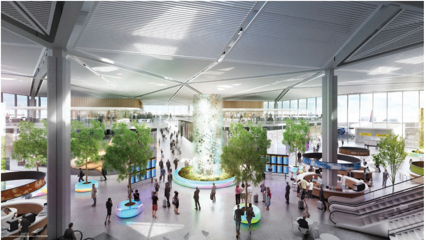
Located in a new site on the airport property, the new Terminal One eventually will replace the existing Terminal A, the airport's oldest terminal.

international and 10 domestic gates. In 2019, the Port Authority Board of Commissioners authorized $35 million for vision and master planning initiatives that would allow for the future replacement of Terminal B with a new world-class Terminal Two.