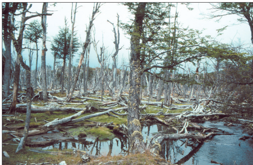
Figure 4. Tierra del Fuego, South America. Aquatic and forest ecosystems in this area have been severely altered by the invasion of beaver ( Castor canadensis ) introduced from North America.

The above guidelines have focused on maintaining biodiversity in general, and functional groups in particular, with the aim of maintaining ecosystem resilience. These approaches are likely to benefit a number of different species. However, some species may still “fall through the cracks” (Hunter 2005). Unless they are keystone species, highly threatened species are often very rare, and may contribute lit-