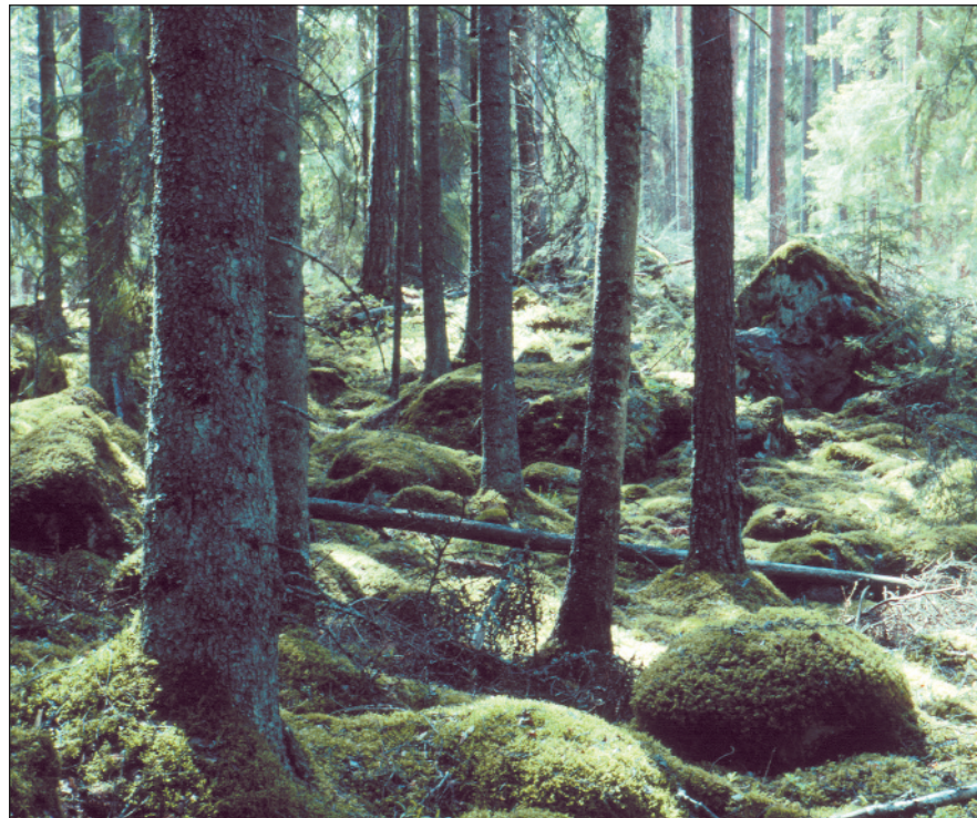
Figure 1. Structurally complex forest in the northern Ural Mountains, Komi Province, Russia.

The area surrounding patches of native vegetation is often termed the “matrix” (Forman 1995). The matrix is the dominant landscape element, and exerts an important influence on ecosystem function. A matrix that has a similar vegetation structure to patches of native vegetation (ie that has a low contrast) will supply numerous benefits to ecosystem functioning. Three key benefits of a structurally complex matrix are the provision of habitat