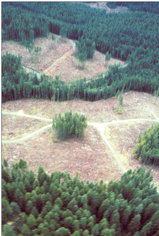
Figure 2. Retention harvesting to maintain structural complexity in the matrix and provide stepping stones for organisms on Vancouver Island, Canada.

The maintenance of a structurally complex matrix is particularly important where the proportion of land occupied by the matrix is large, and where areas of native vegetation are small or poorly connected.