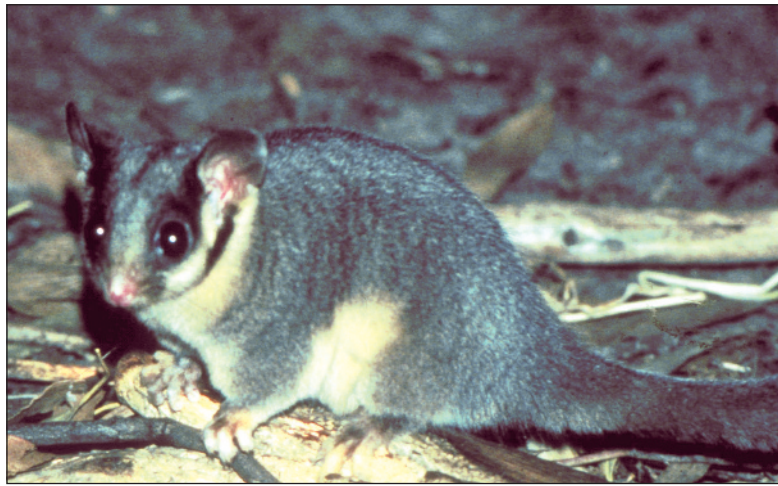
Figure 5. Leadbeater's possum ( Gymnobelideus leadbeateri ), an endangered marsupial in the Central Highlands of Victoria, Australia. Highly targeted management strategies are required to maintain viable populations of this species.

and financial perspective. Future work may be most effective if it is interdisciplinary and considers both conservation and production objectives.