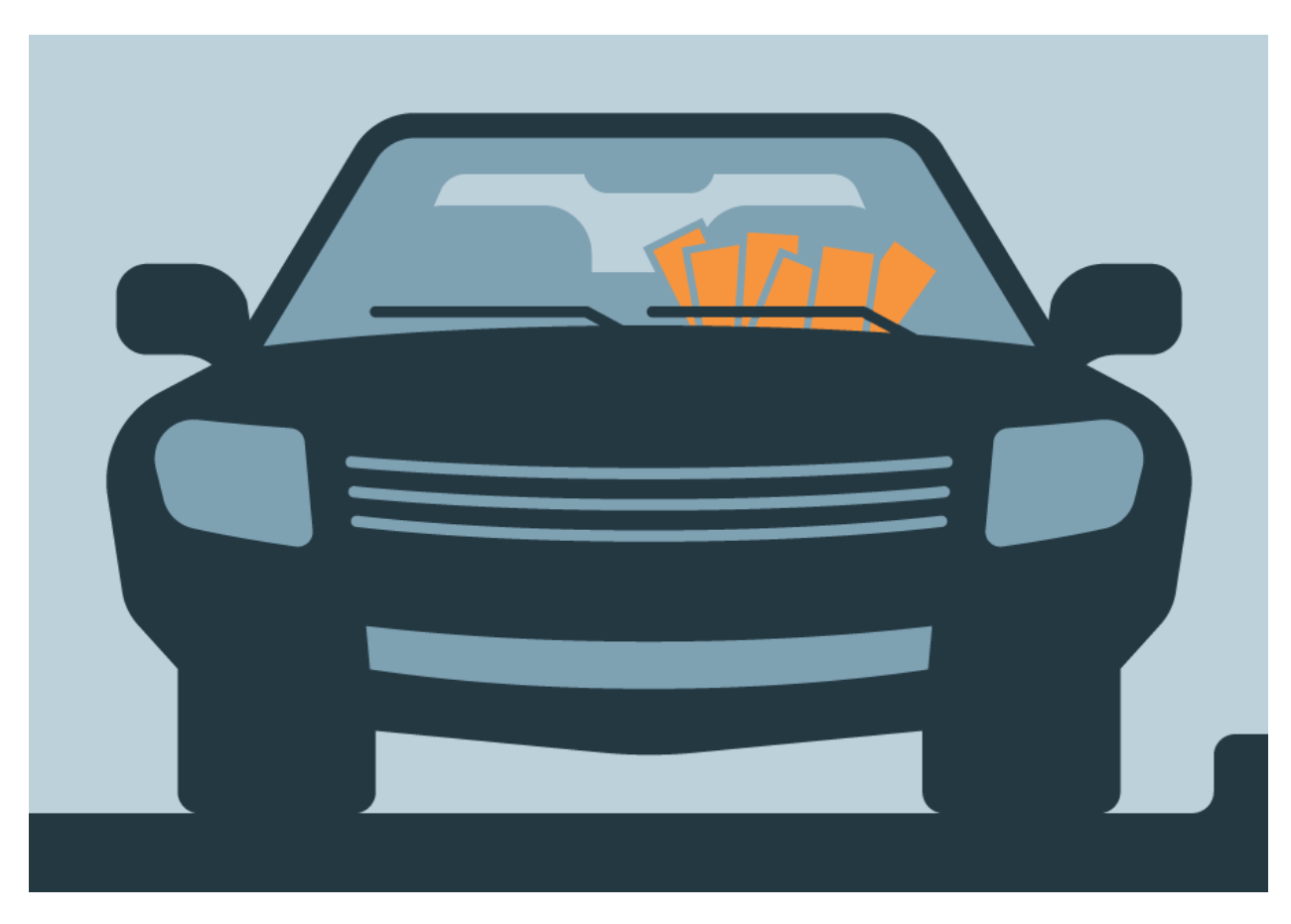
ProPublica Illinois revealed how Chicago's aggressive ticketing practices leave the city's working poor with more fines and fees—and spiraling debt.

the platform to discriminate. And in September, the U.S. Equal Employment Opportunity Commission ruled that seven employers, including Capital One, Edward Jones and Enterprise Holdings, violated civil rights law through their use of Facebook's targeting advertising before 2019 to exclude women and older workers from job ads.