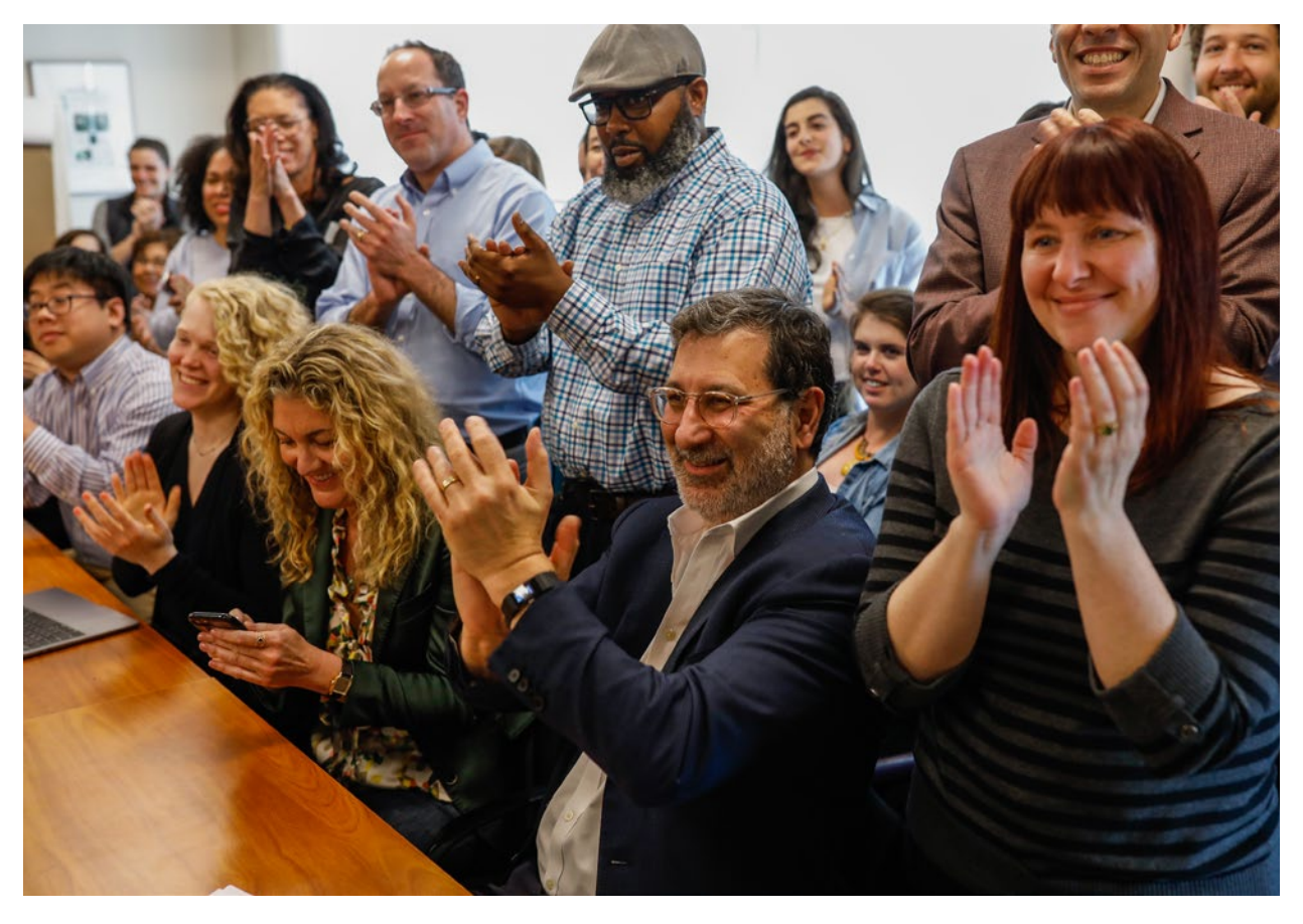
ProPublica staff reacts to our receiving the Pulitzer Prize for feature writing, April 15, 2019.