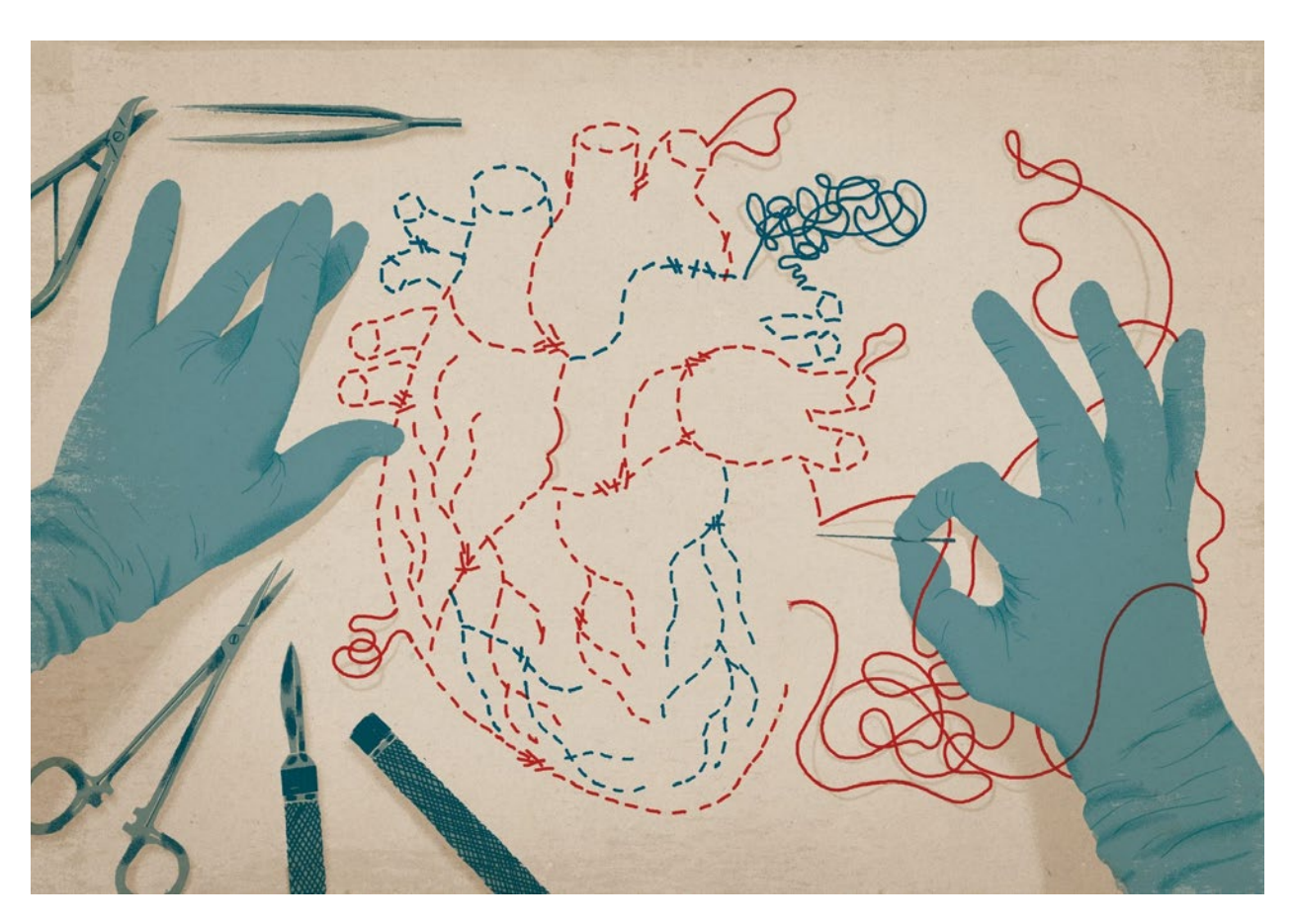
ProPublica and the Houston Chronicle investigated troubles at Baylor St. Luke's in Houston, an illustrious heart program that has recently had some of the worst outcomes in the country.

the voter registration system a misdemeanor crime. The secretary of state is now a nonvoting member of the SBE, and the board will include two former county clerks, one from each party.