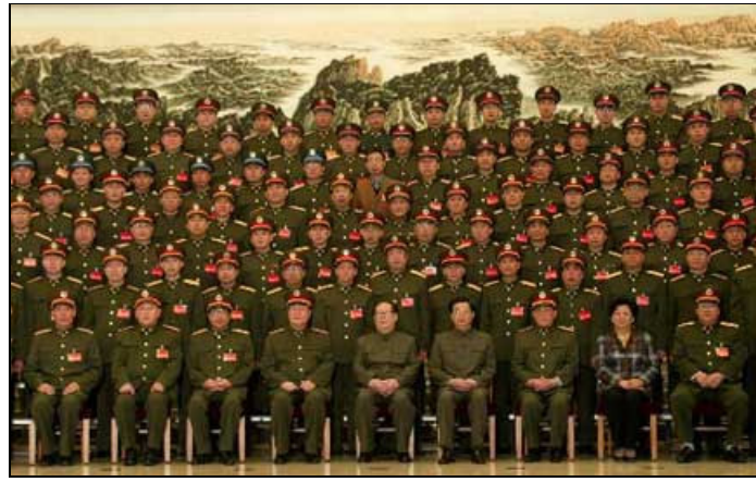
On 11/4/03, Jiang Zemin, General Secretary of the Military Commission of the Central Committee, met with the representatives of the 15<sup>th</sup> National Military Schools and Colleges Conference in Beijing

The photo from the Xinhua Net (6) gives a glimpse of the special relationship between Chen and Jiang. On November 4, 2003, Jiang (in the middle of the front row) met with the representatives of the 15<sup>th</sup> National Military Schools and Colleges Conference in Beijing. He was accompanied by Chen (second from the right in the front row and the only one in plain clothes) who had no business with the military.