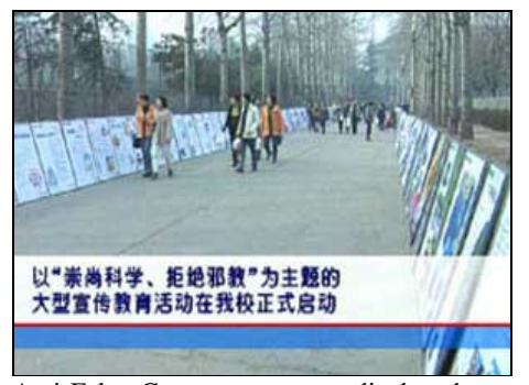
Anti-Falun Gong posters were displayed along the main street on the campus of the Beijing Foreign Language University (31)

Since colleges students, faculties, experts and scholars have active minds and can access information through a wide range of sources, colleges have always been the ideology hotbed in all movements in the recent history of China, such as the "May 4<sup>th</sup>" Youth Movement, the "Cultural Revolution", and the "June 4<sup>th</sup>" Student Democracy Movement. In order to prevent the intellectuals from knowing the truth and becoming awakened, colleges and universities have also become a major target for the hate propaganda, mind control and the persecution. Under the direct order of the Committee of Education, colleges and universities launched hate propaganda and instigated students to participate in the persecution. A few of the countless examples were the anti-Falun Gong column on the Qinghua University's campus website (30), anti-Falun Gong cartoon exhibits at the Northwest University of Technology and the Southern China Normal University, anti-Falun Gong essay contest at the LanZhou University, and so on. (32) (Please refer to Part 2 of the Investigative Report for details)