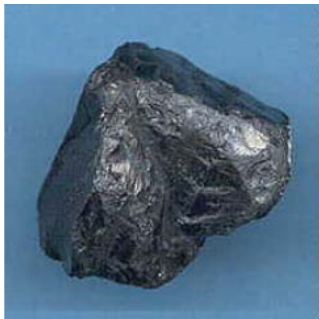
Figure 1. Bituminous coal.

Coal originated from ancient plants that flourished in swamp-like environments millions of years ago. In Virginia, coal was formed mainly during the Carboniferous Period of the Earth's history, 299 to 359 million years ago. There are also coal beds in Virginia that were formed during the Triassic Period, 201 to 250 million years ago. By comparison, most of the coals in the western United States were formed during the Cretaceous Period, 66 to 145 million years ago, and the Tertiary Period, 2.6 to 66 million years ago.