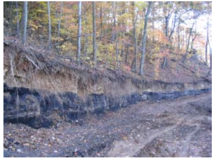
Figure 2. Coal bed in southwestern Virginia.

Coal occurs in Virginia in three widely separated areas, encompassing approximately 2,000 square miles of surface area: the Eastern Coalfields (Mesozoic basin fields such as the Richmond and