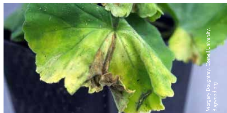
Margery Daughtrey, Cornell University, Bugwood.org

Wilting of geranium caused by Ralstonia solanacearum ( top left ). The base of infected plants will collapse and turn necrotic ( top right ). Foliar necrosis may occur in a wedge-shaped pattern ( bottom ).