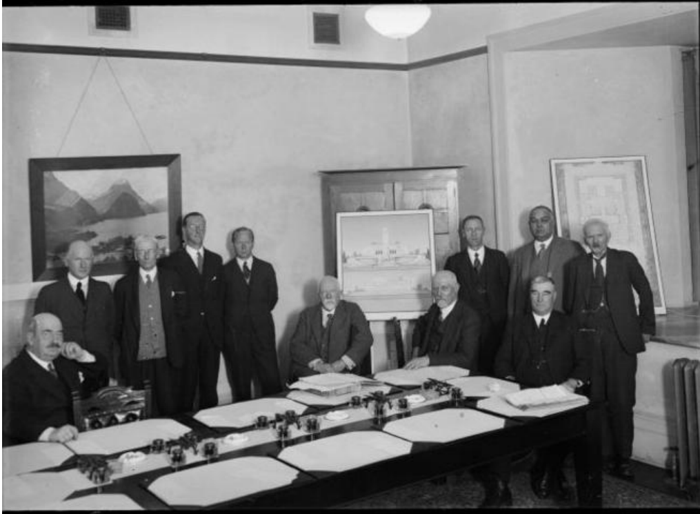
Dominion Museum Committee. Negatives of the Evening Post newspaper. Ref: EP-3876-1/2-G. Alexander Turnbull Library, Wellington, New Zealand, accessed 3/5/2013, http://natlib.govt.nz/records/23252624

The Mt Cook gaol was demolished and construction of the first structure – the Carillon, which was opened in 1932 (the hall of memories was not officially completed until 1964) began. The construction of the museum building began in 1933 to Gummer and Ford's design, a monumental and imposing structure of three storeys in the Stripped Classical style. It was constructed in reinforced concrete and partially faced with Putaruru stone. The roof was clad with copper sheathing and glass. A large central portico supported by square fluted pillars dominates the main façade.