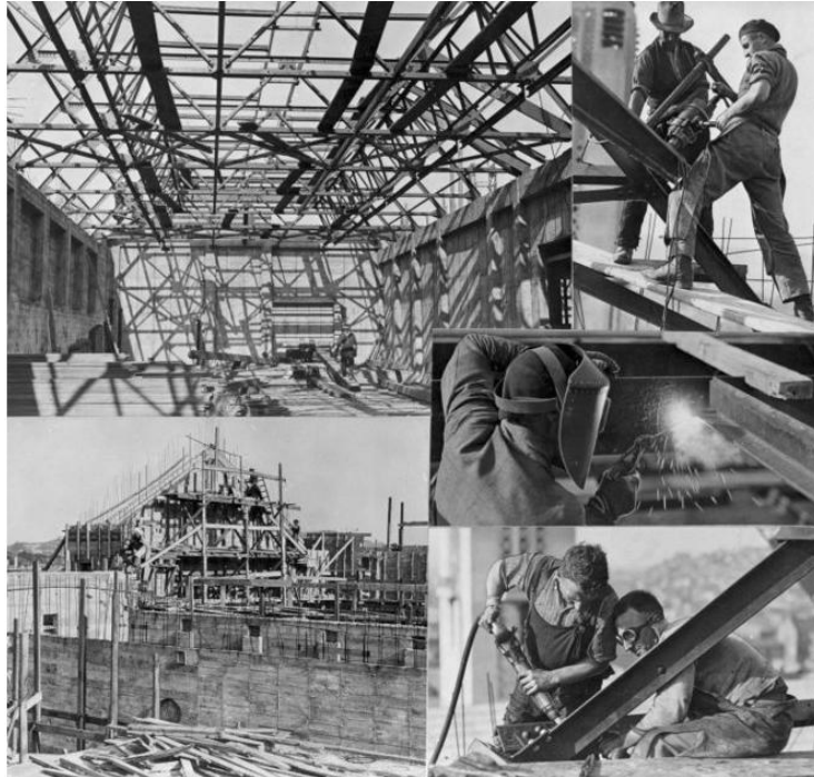
Montage of images showing the Dominion Museum under construction, Buckle Street, Wellington.