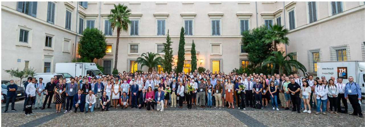
EOSAM was one of the few conferences which had a chance for on-site meetings in 2021. It was held at the University La Sapienza in Rome, Italy.

Check out the detailed schedule and more information at eosam2022.org