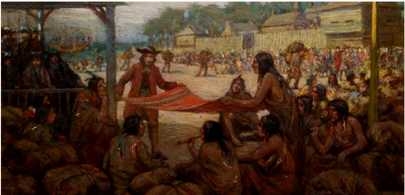
The Fur Traders at Montreal by George Agnew Reid, 1916 (courtesy Library and Archives Canada/C-011013).