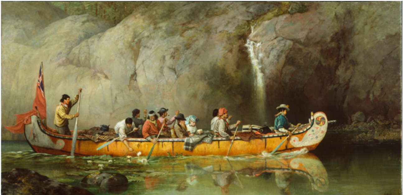
Canoe Manned by Voyageurs Passing a Waterfall by Frances Ann Hopkins, 1869.

Choose one of the two paintings below and answer the questions in the following chart. To support your analysis, download and build the Primary Source Pyramid from the Education Portal .