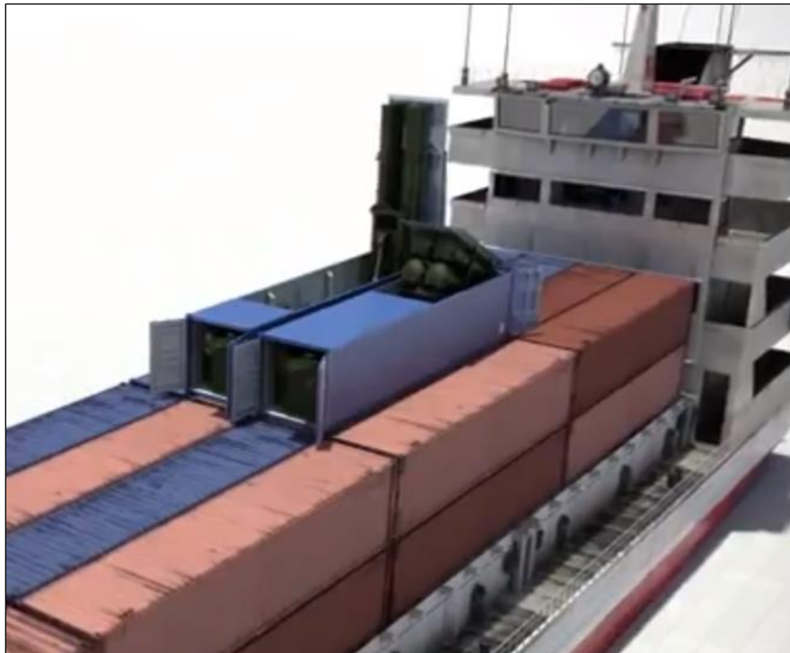
Figure 6. Illustration of Reported Potential Containerized ASCM Launcher

Source: Illustration accompanying Tariq Tahir, "China Feared to be Hiding Missiles in Shipping Containers for Trojan Horse-Style Plan to Launch Attack Anywhere in World," U.S. Sun , December 6, 2021.