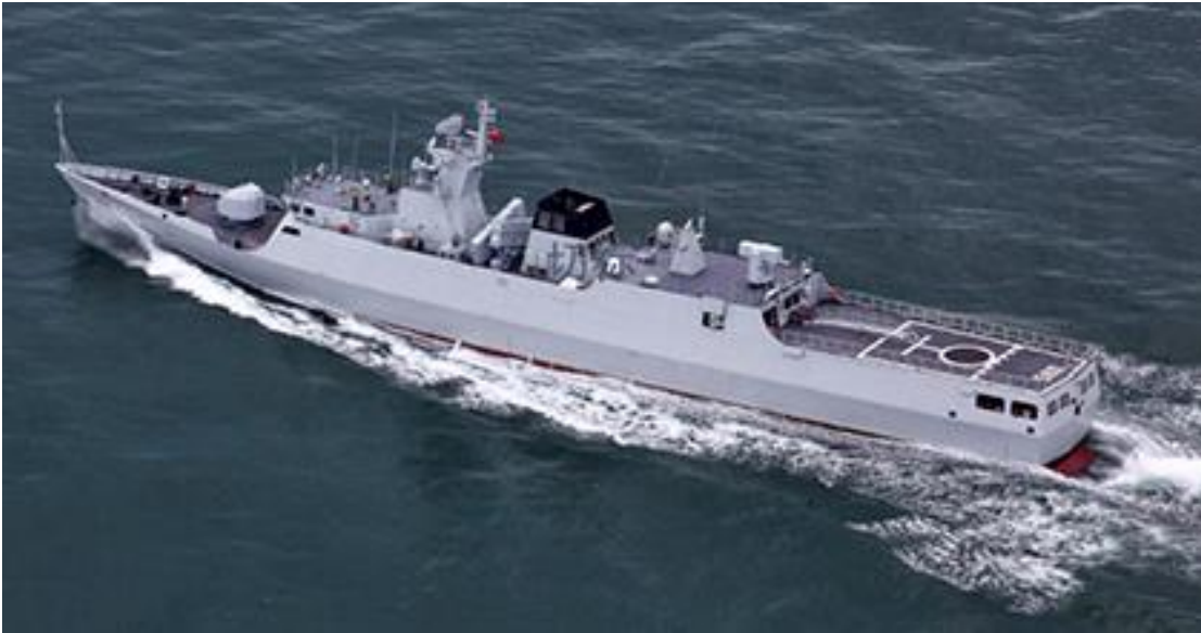
Figure 19. Jingdao (Type 056) Corvette