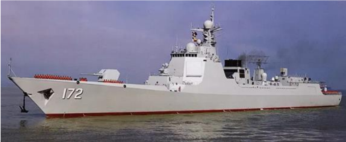
Figure 17. Luyang III (Type 052D) Destroyer