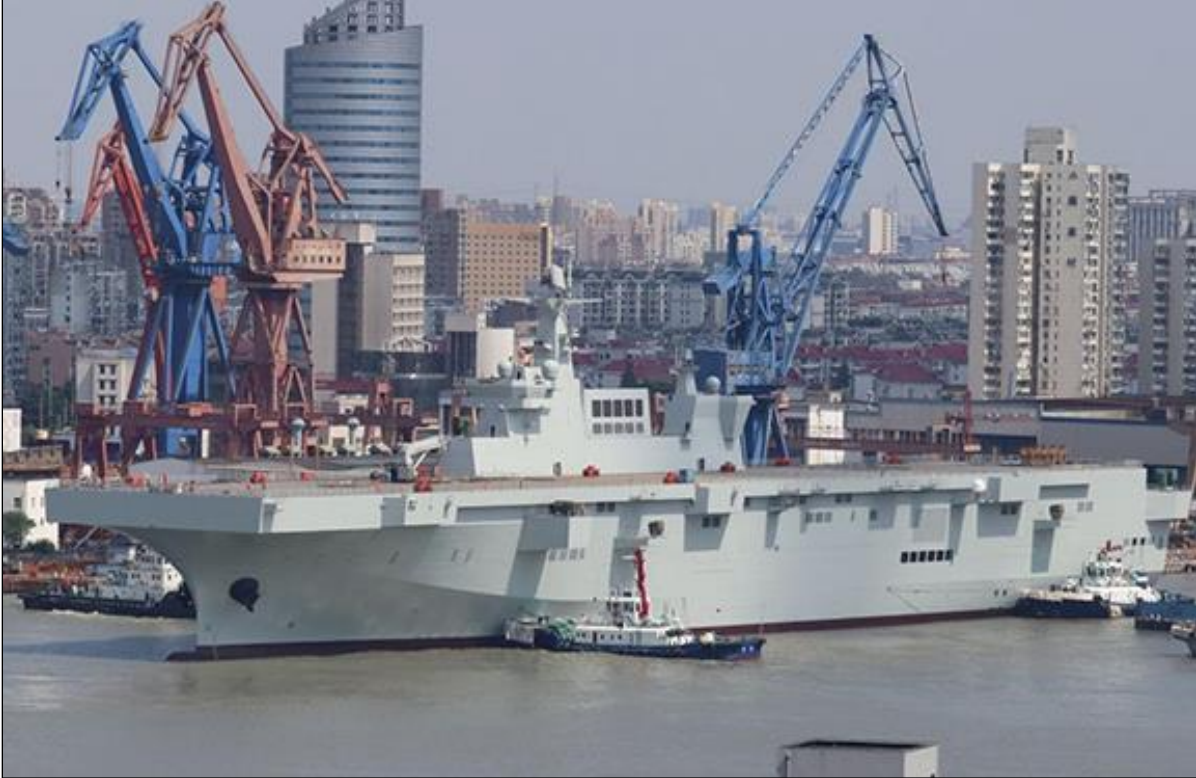
Figure 21. Type 075 Amphibious Assault Ship