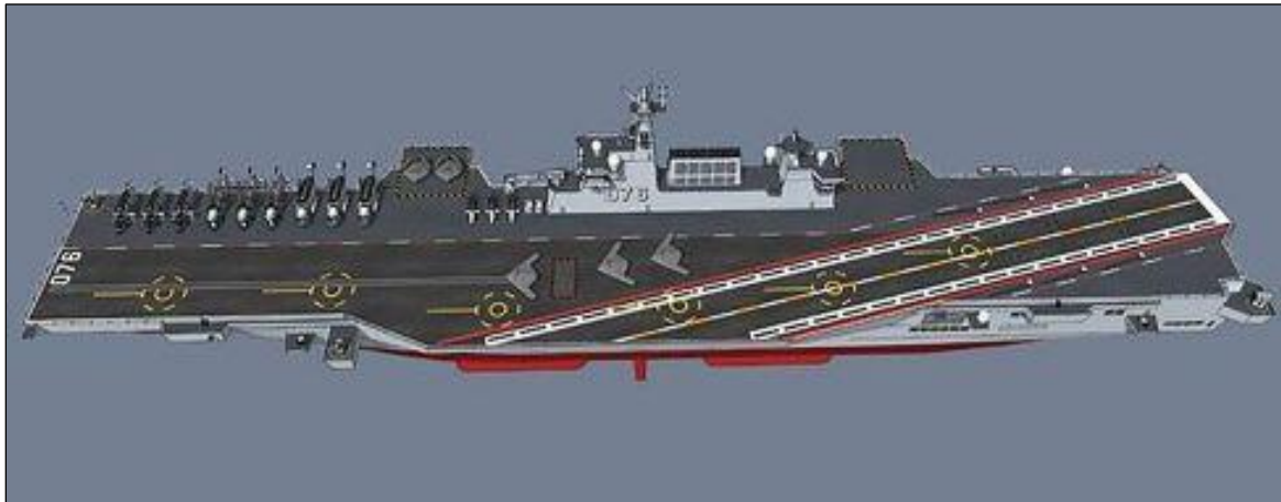
Figure 24. Notional Rendering of Possible Type 076 Amphibious Assault Ship