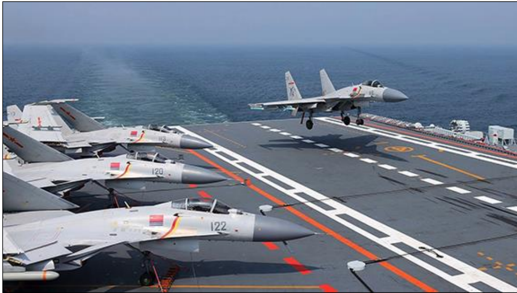
Figure 13. J-15 Flying Shark Carrier-Capable Fighter