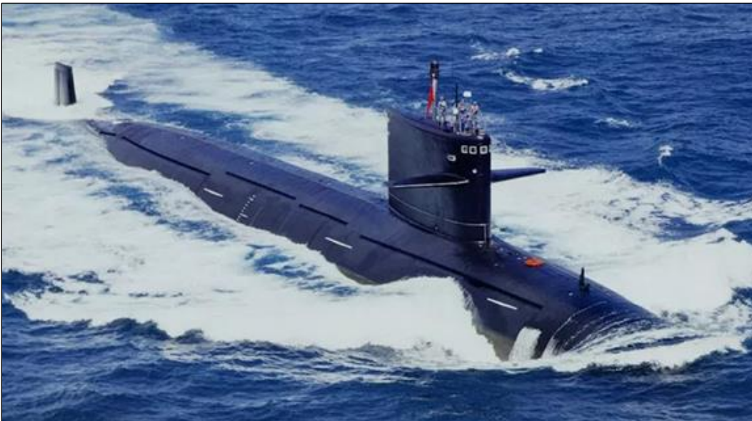
Figure 8. Shang (Type 093) Attack Submarine (SSN)