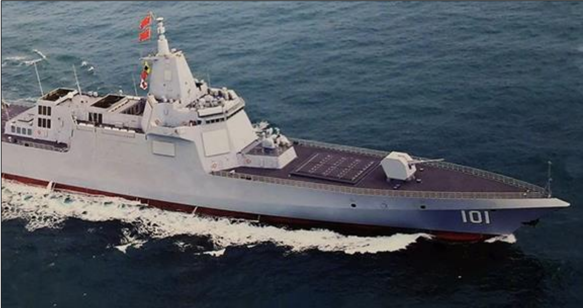
Figure 15. Renhai (Type 055) Cruiser (or Large Destroyer)