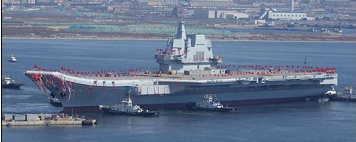
Figure 11. Shandong (Type 002) Aircraft Carrier