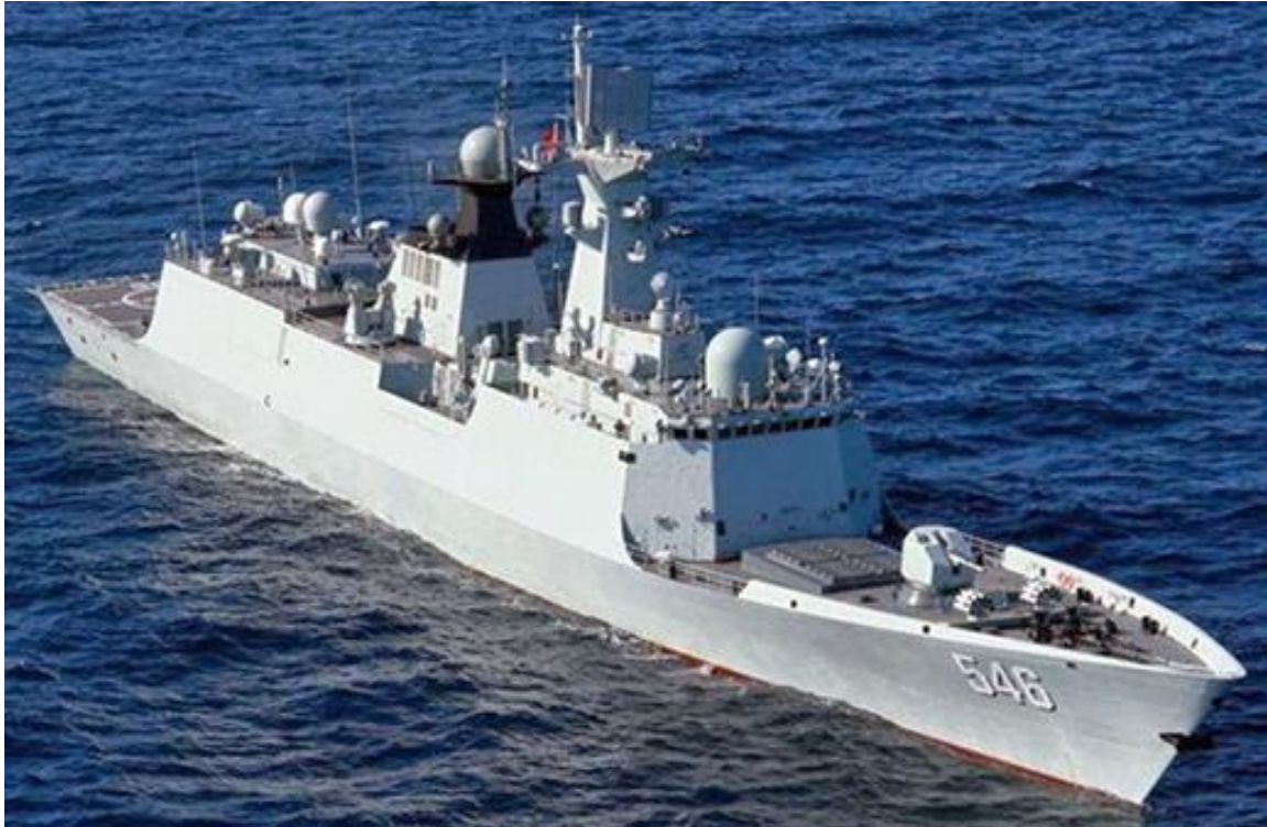
Figure 18. Jiangkai II (Type 054A) Frigate