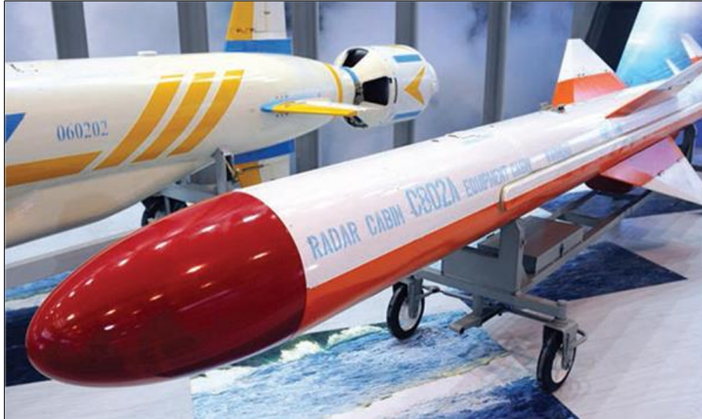
Figure 5. Reported Image of Anti-Ship Cruise Missile (ASCM)