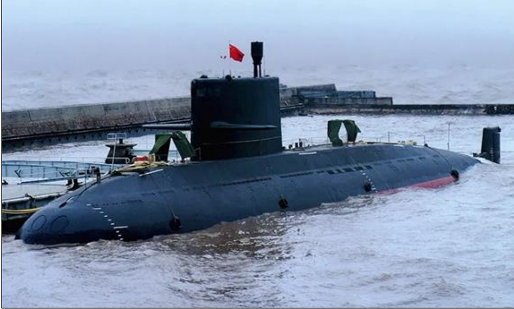
Figure 7. Yuan (Type 039) Attack Submarine (SS)