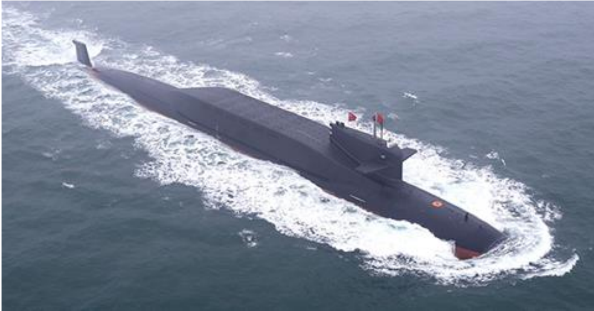
Figure 9. Jin (Type 094) Ballistic Missile Submarine (SSBN)