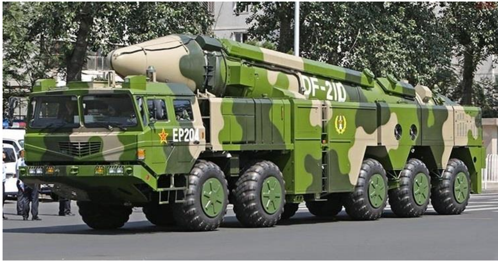
Figure 1. DF-21D Anti-Ship Ballistic Missile (ASBM)