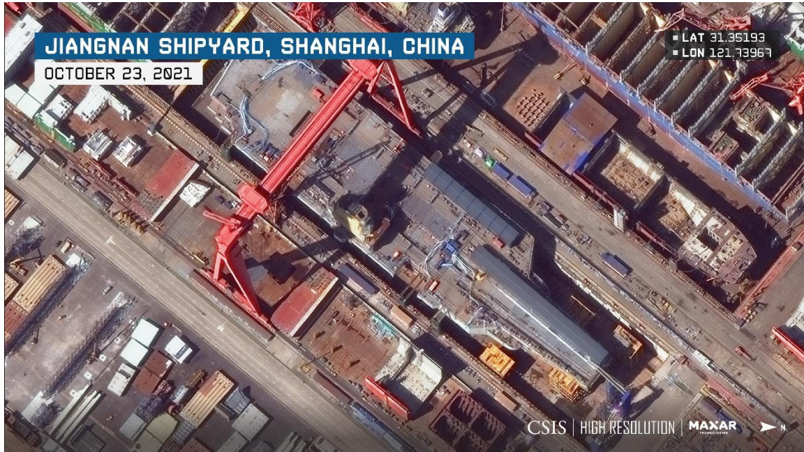
Figure 12. Type 003 Aircraft Carrier Under Construction