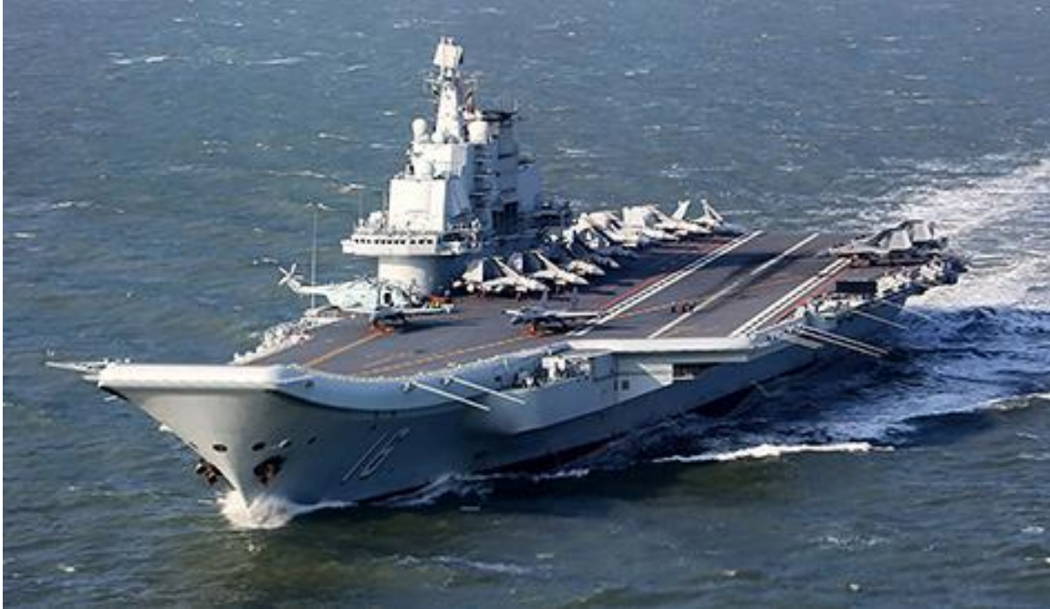
Figure 10. Liaoning (Type 001) Aircraft Carrier