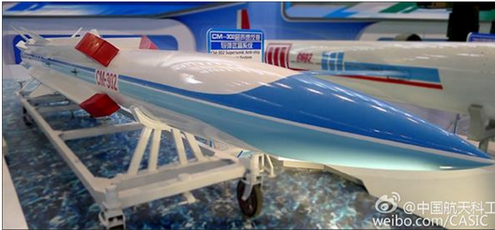
Figure 3. Reported Image of Anti-Ship Cruise Missile (ASCM)

Source: Detail of photograph accompanying Pierre Delrieu, “China Promotes Export of CM-302 Supersonic ASCM,” Asian Military Review , July 3, 2017. (The article states “This is an article published in our December 2016 Issue.”) The article states “According to Chinese news media reports, the China Aerospace Science and Industry Corporation (CASIC) CM-302 missile is being marketed for export as “the world’s best anti-ship missile.” The missile was showcased at the Zhuhai air show in the southern People’s Republic of China (PRC) in early November [2016], and is advertised as [a] supersonic Anti-Ship Missile (AShM) [ASCM] which can also be used in the land attack role. The report, published by the national newspaper China Daily , suggest[s] that the CM-302 is the export version of CASIC’s YJ-12 supersonic ASHm, which is in service with the PRC’s armed forces.”)