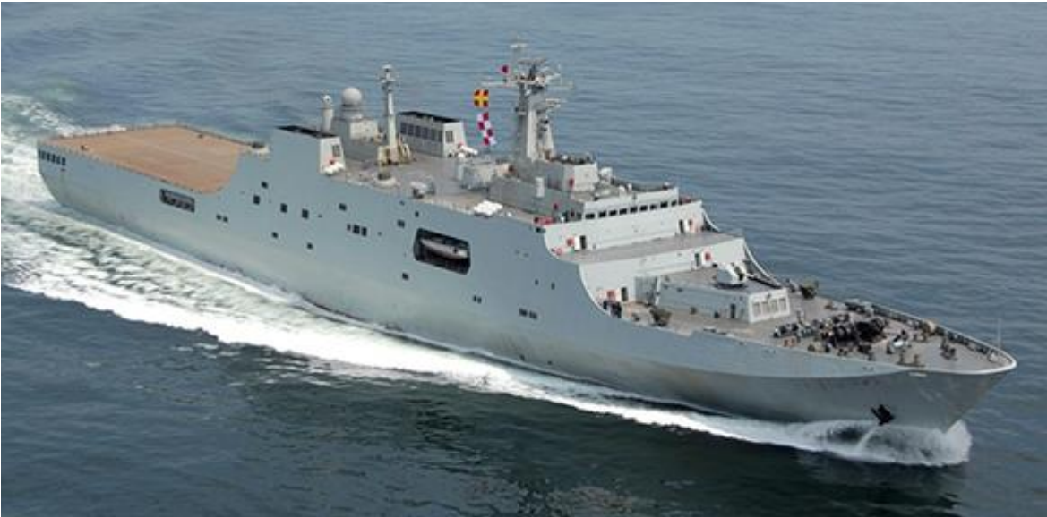
Figure 20. Yuzhao (Type 071) Amphibious Ship