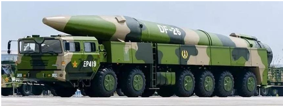
Figure 2. DF-26 Multi-Role Intermediate-Range Ballistic Missile (IRBM)