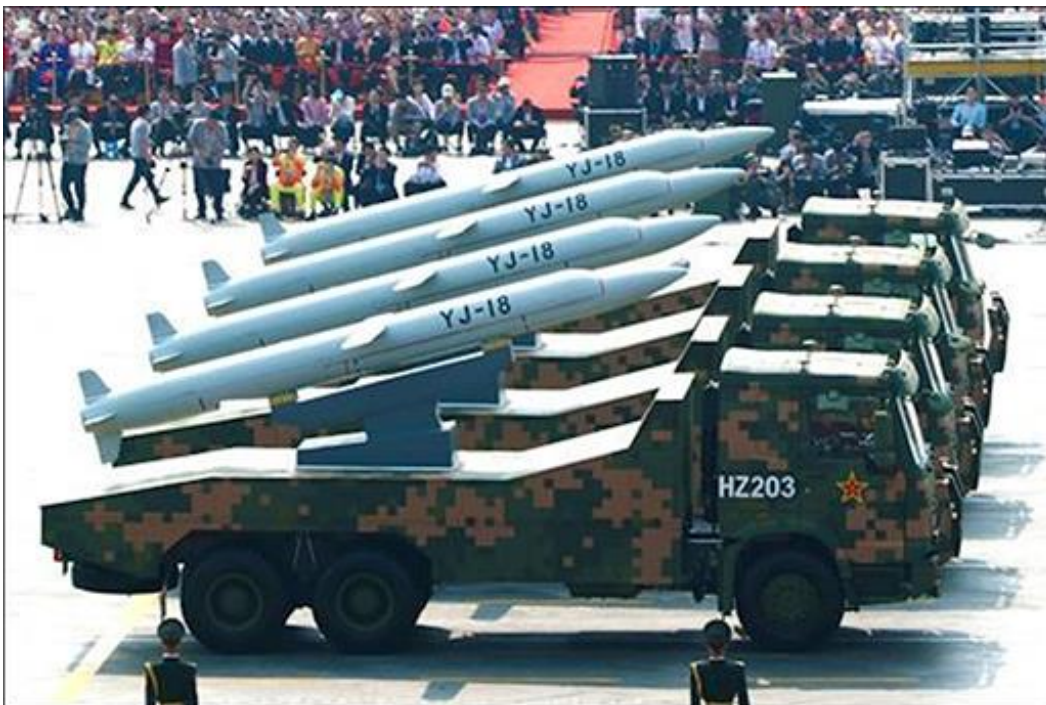
Figure 4. Reported Image of Anti-Ship Cruise Missile (ASCM)

The article states “A grand military parade was held in Beijing on 01 October 2019 to mark the People’s Republic of China’s 70 th founding anniversary.... One weapon featured was a new generation of anti-ship missiles called YJ-18. China unveiled YJ-18/18A anti-ship cruise missiles in the National Day military parade in central Beijing.”)