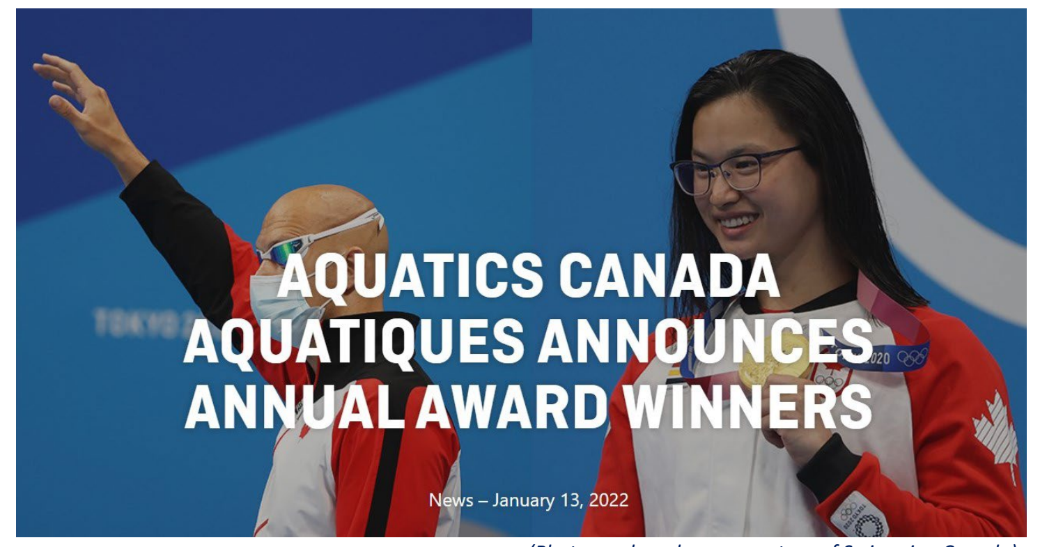
(Photograph and news courtesy of Swimming Canada)

At OAHOF, we would also like to congratulate all the recipients for their outstanding achievements and contributions to Canadian aquatic sports. Swimming Canada News