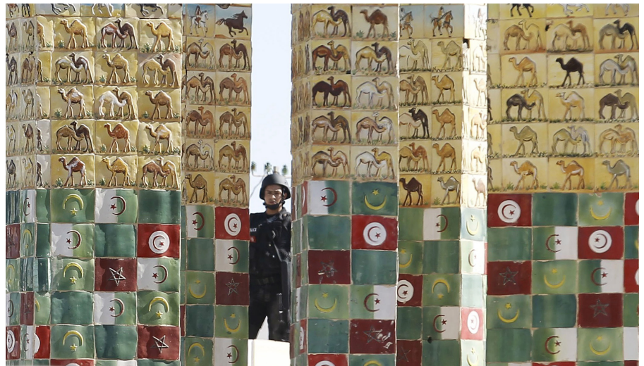
A tense security situation prevails in Tunisia following March 2016 attacks on the city of Ben Guardane by Islamic State militants based in Libya.

North African states are wrestling with how to deal with returning foreign fighters, as well women and children seeking to return from formerly IS-held territories. Other foreign fighters may redeploy, with Libya in particular likely to be a preferred destination for those fleeing Syria and Iraq, due to its weak governance and security structures and continued IS presence. North Africa is geographically close to Europe, and there are transnational links between jihadis in both regions, as became evident in the cases of the 2016 Berlin Christmas market and 2017 Manchester Arena attacks, which were both perpetrated by individuals with links to jihadist groups in Libya. Therefore, Europe can ill afford to