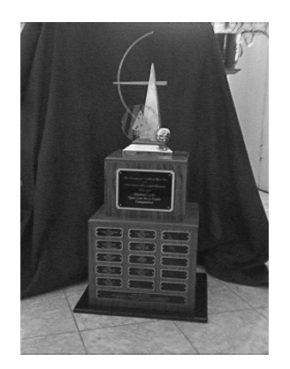
The Manfred Lachs Trophy

The Manfred Lachs Space Law Moot Court Competition is organized annually by the International Institute of Space Law (IISL) of the International Astronautical Federation (IAF). The first competition was organized for law students from northern America by the Association of US Members of the IISL (AUSMIISL) during the first World Space Congress (WSC) held in Washington, D.C., U.S.A. in 1992. In 1993, the Competition was renamed after the late Judge Manfred Lachs, the previous President of the IISL, of the International Court of Justice and of the United Nations Committee on the Peaceful Uses of Outer Space (UNCOPUOS). In the same year, the Competition was also extended to include European students and in 2000, the Asia-Pacific Round was added. This year will be the 11<sup>th</sup> Competition.