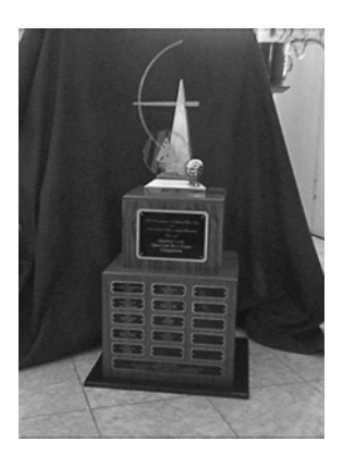
The Manfred Lachs Trophy

The Manfred Lachs Space Law Moot Court Competition is organized annually by the International Institute of Space Law (IISL) of the International Astronautical Federation (IAF). The first competition was organized for law students from northern America by the Association of US Members of the IISL (AUSMIISL) during the first World Space Congress (WSC) held in Washington, D.C., U.S.A. in 1992. In 1993, the Competition was renamed after the late Judge Manfred Lachs, the previous President of the IISL, of the International Court of Justice and of the United Nations Committee on the Peaceful Uses of Outer Space (UNCOPUOS). In the same year, the Competition was also extended to include European students and in 2000, the Asia-Pacific Round was added. This year will be the 15th Competition.