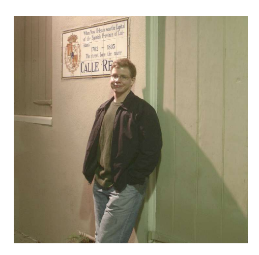
Post-transition ~ 85kg