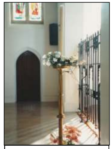
Paschal candle & grille