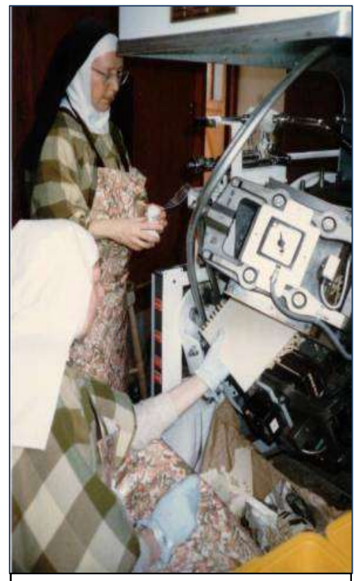
Making altar breads