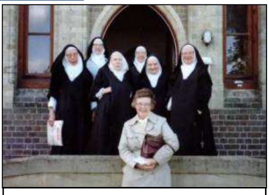
Leaving the convent, September 1994