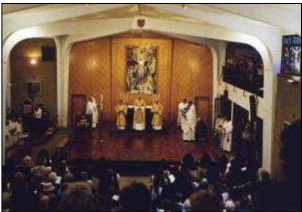
Farewell Mass at St Richard's