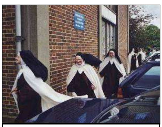
Arriving at St Richard's for the first time