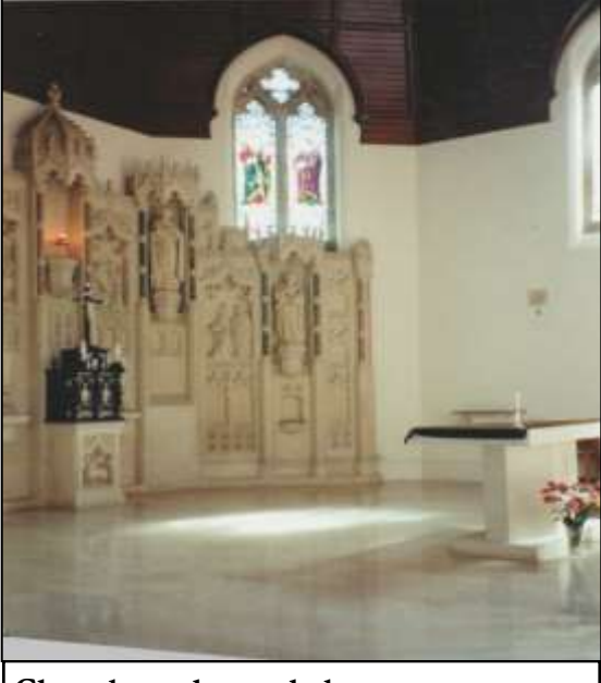
Chapel reredos and altar

The dates could be seen on the downpipe hoppers from the garden. The next alteration was to add second floor rooms in the early 1970s to provide additional space for visitors. The numbers of the community were increased in 1973 by amalgamation with the Carmelite community of Cambridge,