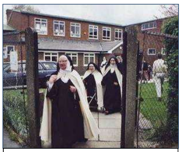
St Richard's School, before Farewell Mass

During the Mass the Bishop expressed his sorrow that the sisters needed to move to other convents, but stressed that this was also a time of thanksgiving for the tremendous witness that they had faithfully given over the years. After the Mass, everyone gathered in the nearby school hall for tea and the chance to have a chat with the sisters.