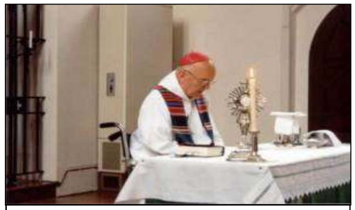
Bishop Fox saying a last Mass