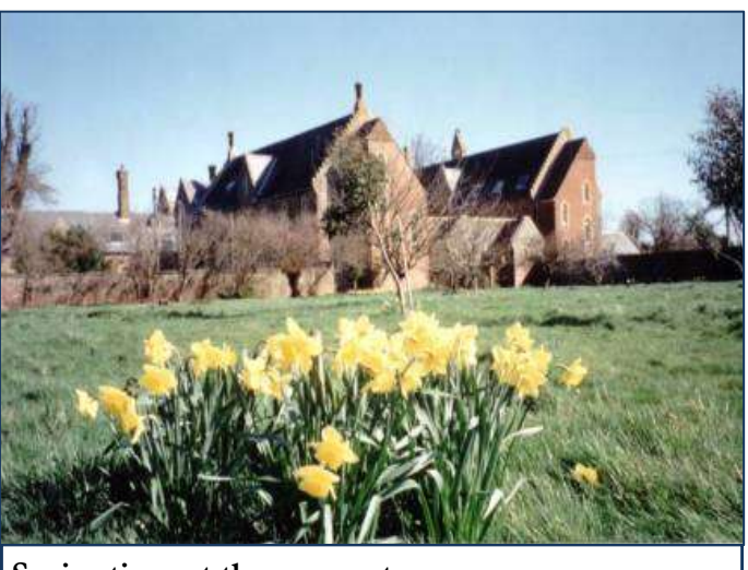
Springtime at the convent

It is interesting to note that, had it not been for the various geographical vagaries of other sites, the convent could just as easily have been built elsewhere - West Grinstead or Rustington and if that had been the case, the spiritual life of Chichester would have been the much poorer for it. The Convent building, which was built in 1872. still stands although the Carmelites left in 1994: no less than three hundred and sixteen