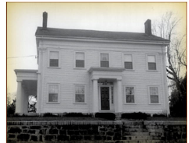
Dr. Elisha Bartlett House