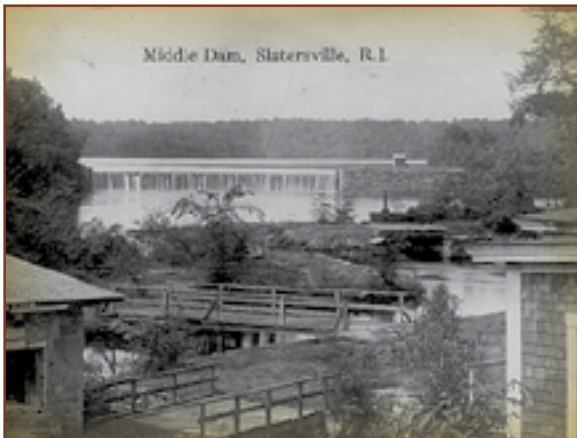
Slatersville Middle Dam, c. 1900. In the foreground is part of the Western Mill complex, along with the system of canals that powered it.

Follow the small path at the post office end of the parking lot towards the river. From here you can see two waterfalls. The larger dam, known as the Middle Dam, was built in 1849. It is 300 feet long, and causes a twentyfoot drop. Behind the dam is the 170 acre Lower Slatersville Reservoir. The smaller dam was built later to increase the water power. The sluice gate here controlled the amount of water flowing into the raceway that powered the Slatersville Mill.