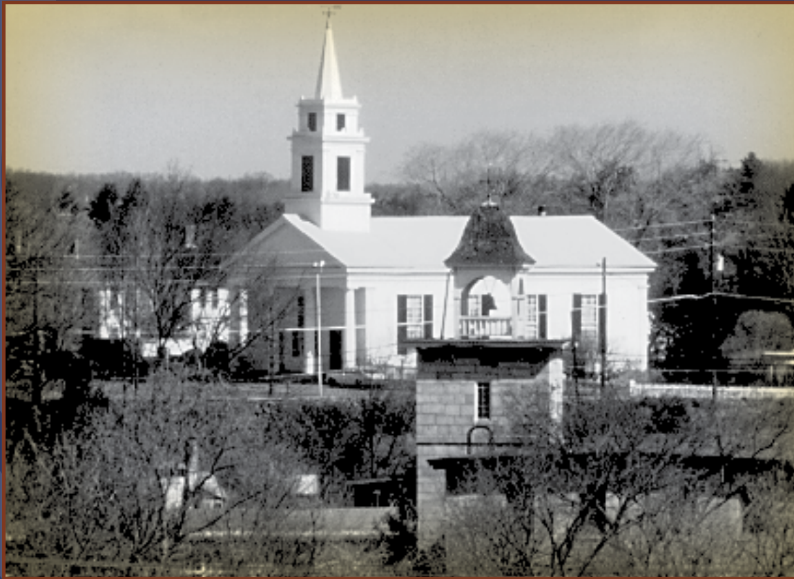
Slatersville Congregational Church and Mill. Photo courtesy of the Blackstone Valley Tourism Council. Postcards courtesy of Ray Auclair. Photo of John Slater courtesy of the Rhode Island Historical Society.