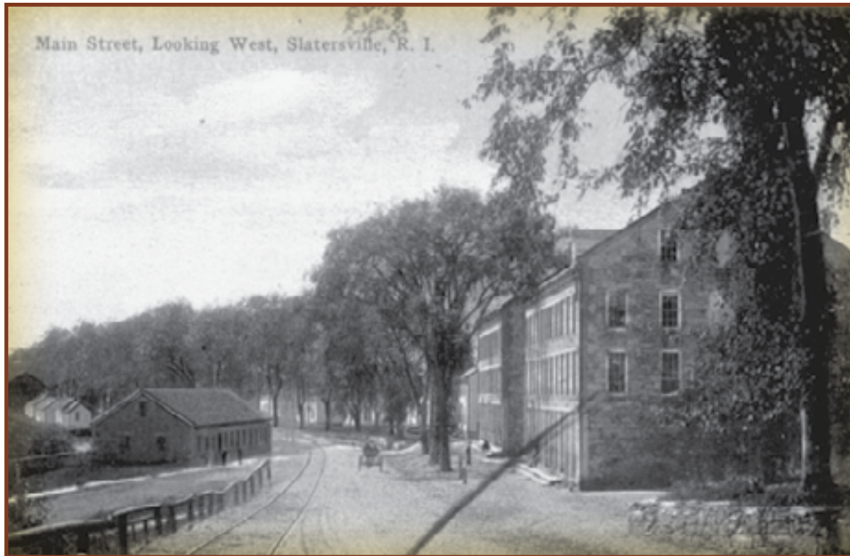
Main Street Slatersville during the 1890s. To the right are the Commercial Blocks, to the left is part of the Western Mills, including the library. Notice also the tracks in the street. They were for the horse drawn street cars that connected Slatersville with the other villages nearby.