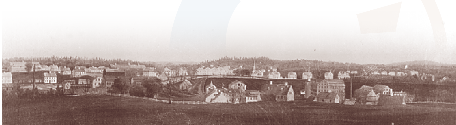
View of Slatersville c. 1860, looking north from Tabor Hill. The Center Mill can be seen in the right foreground. In the background is Main Street and School Street, including the First Commercial Block and the Congregational Church.

The current residents still exhibit the sense of pride instilled by the Slaters and Henry Kendall. While the surrounding areas have been developed, the village core has been preserved and Main Street looks much as it did in the 1920's after Kendall's renovations. Thus modern Slatersville is not only a mill village entering its third century, but the end result of a preservation project that has been lovingly carried out on a community level for eighty years.