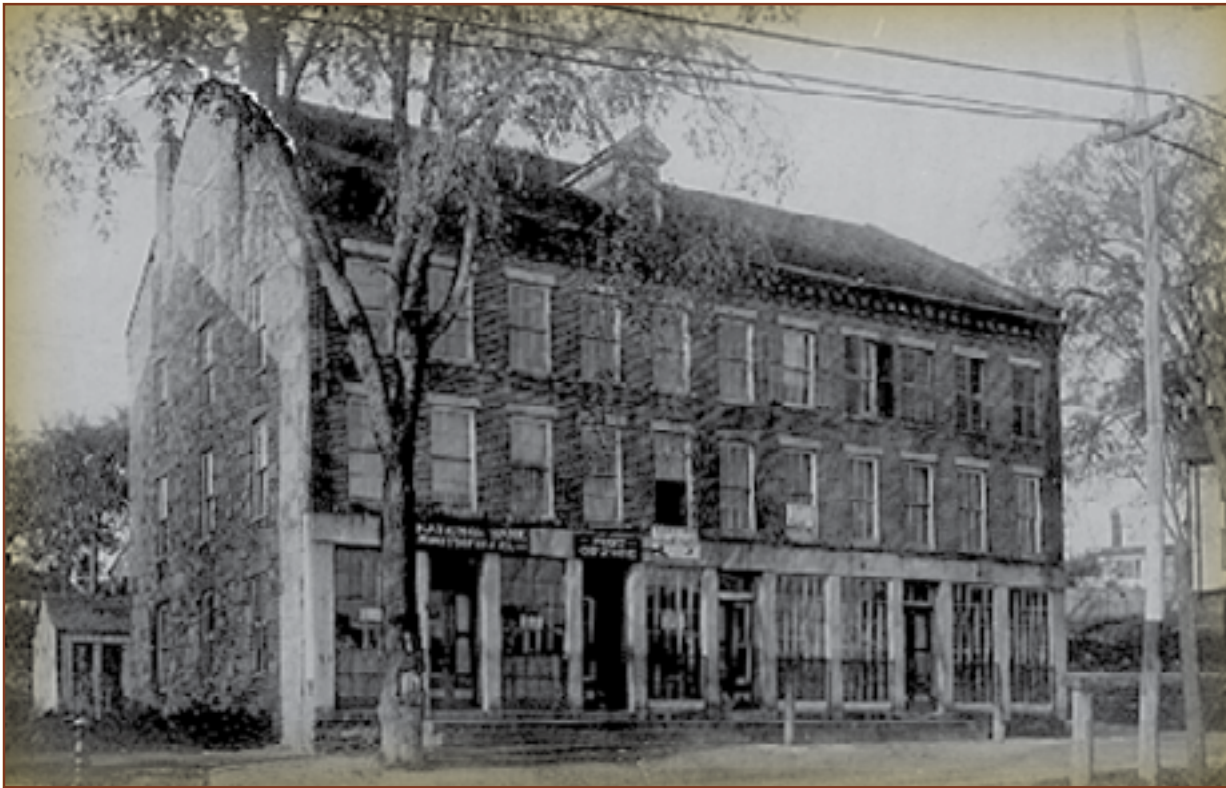
The First Commercial Block (1850) as it appeared at the turn of the century. At that time it housed a bank, the post office, a cobbler, and a general store.

The First Commercial Block (on the right) was constructed in 1850, when it housed the company store and the First National Bank. Many other businesses have used this space over the years, including barber shops and a hardware store. The stairway on the far side of the block leads to the old night-deposit vault for the bank. The Second Commercial Block was built in 1870. The upper floors of both buildings were used for workers' recreation - dances, social activities and later movies. Today, both are still in use.