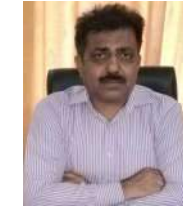
District Statistics & Evaluation Officer Udhampur