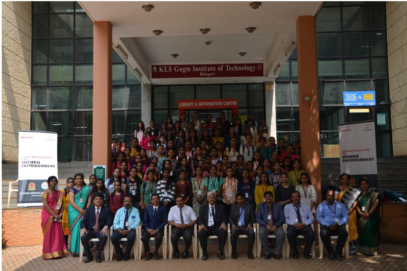
Grp Photo of dignitaries with trainee students.