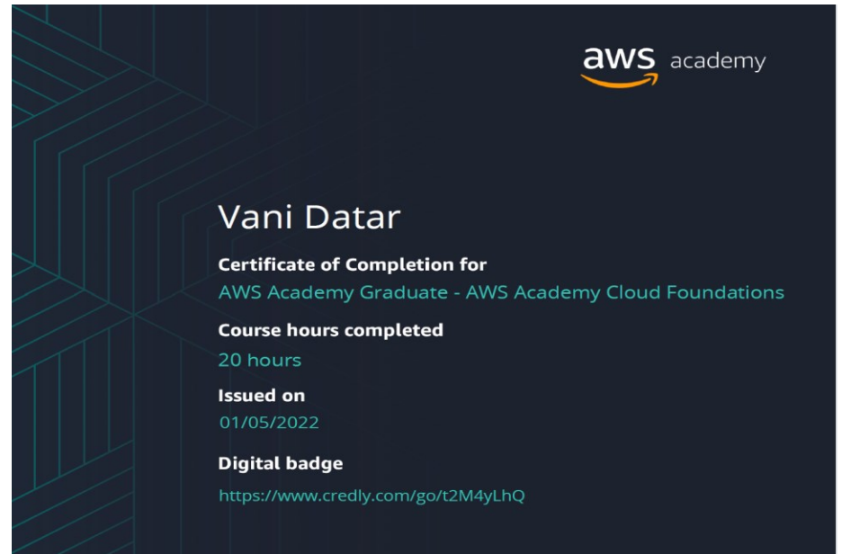
Faculty Mentors Course Completion Certificate for AWS Cloud Computing under AWS Academy Graduate.