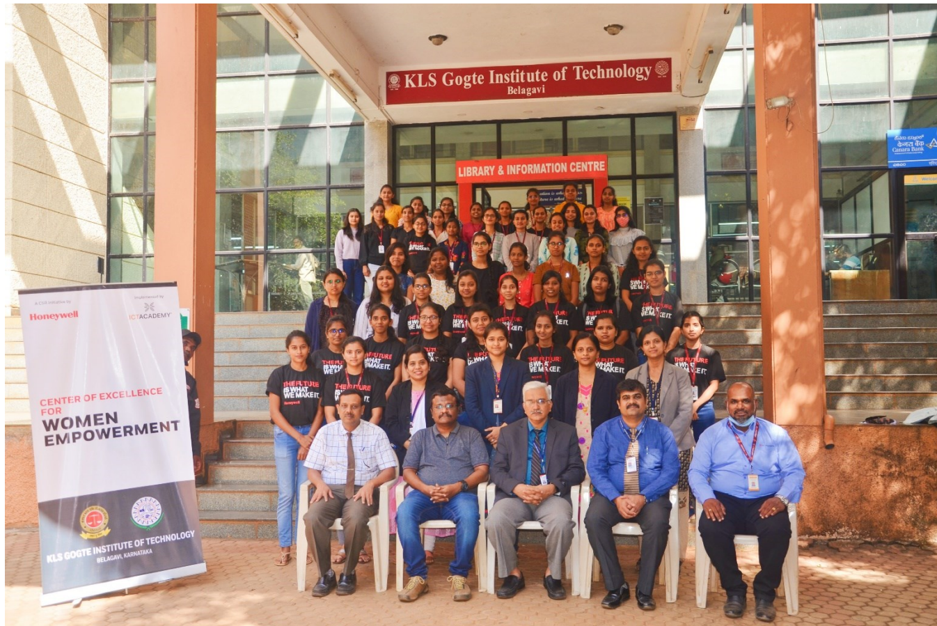
Group photo after Completion of Batches (145 final year girl students, along with 4 Faculty mentors) for AWS Cloud Computing training under A CSR Initiative by Honeywell – Women Empowerment at KLS Gogte Institute of Technology, Belagavi.