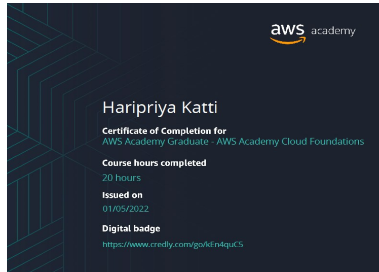
Students Course Completion Certificate for AWS Cloud Computing under AWS Academy Graduate.